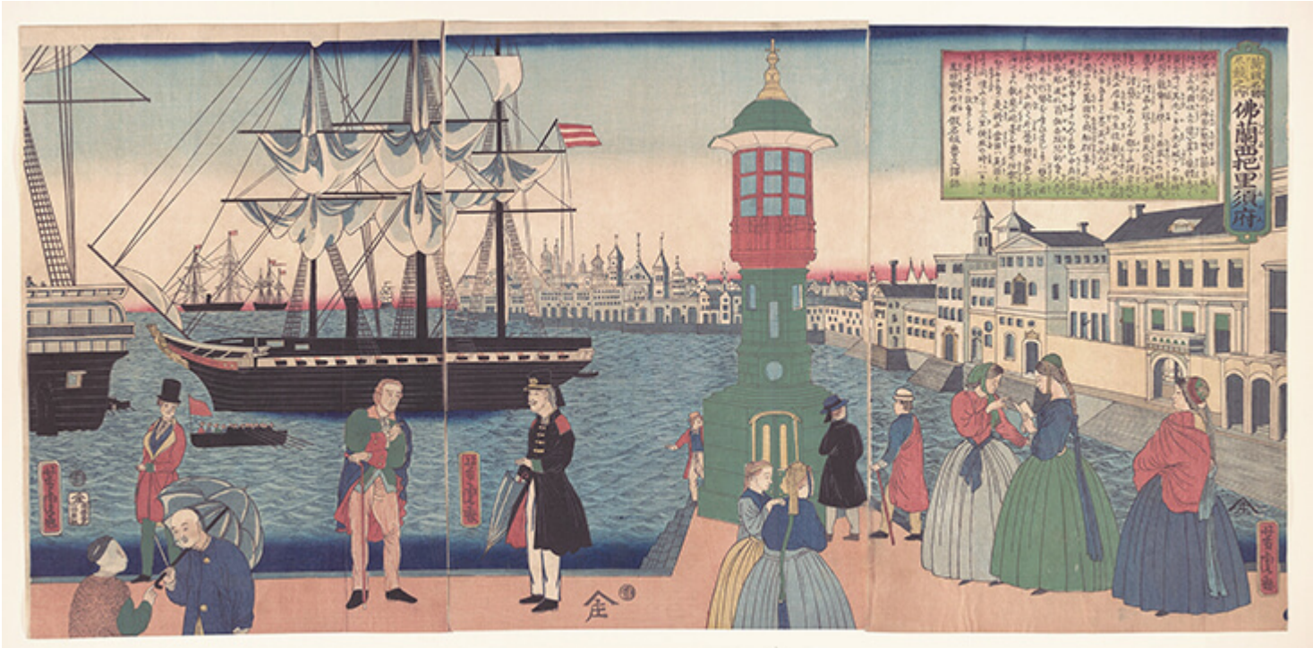
Paris, France, 1862

In Paris, France, 1862 , Yoshitora explores a similar triptych format, to create a wide-angle view across a Parisian harbour scene. In the foreground, Japanese people mingle with Parisians, signifying the growing internationalism of the world during this fascinating period in history. Yoshitora draws the Parisian architecture of the bay in exquisite detail, outlining the Neoclassical facades of the buildings as they gently curve towards the flat horizon line. Indigo shades are scattered throughout the entire scene, colouring clothing, shadowy doorways, and the darkest depths of the water below.