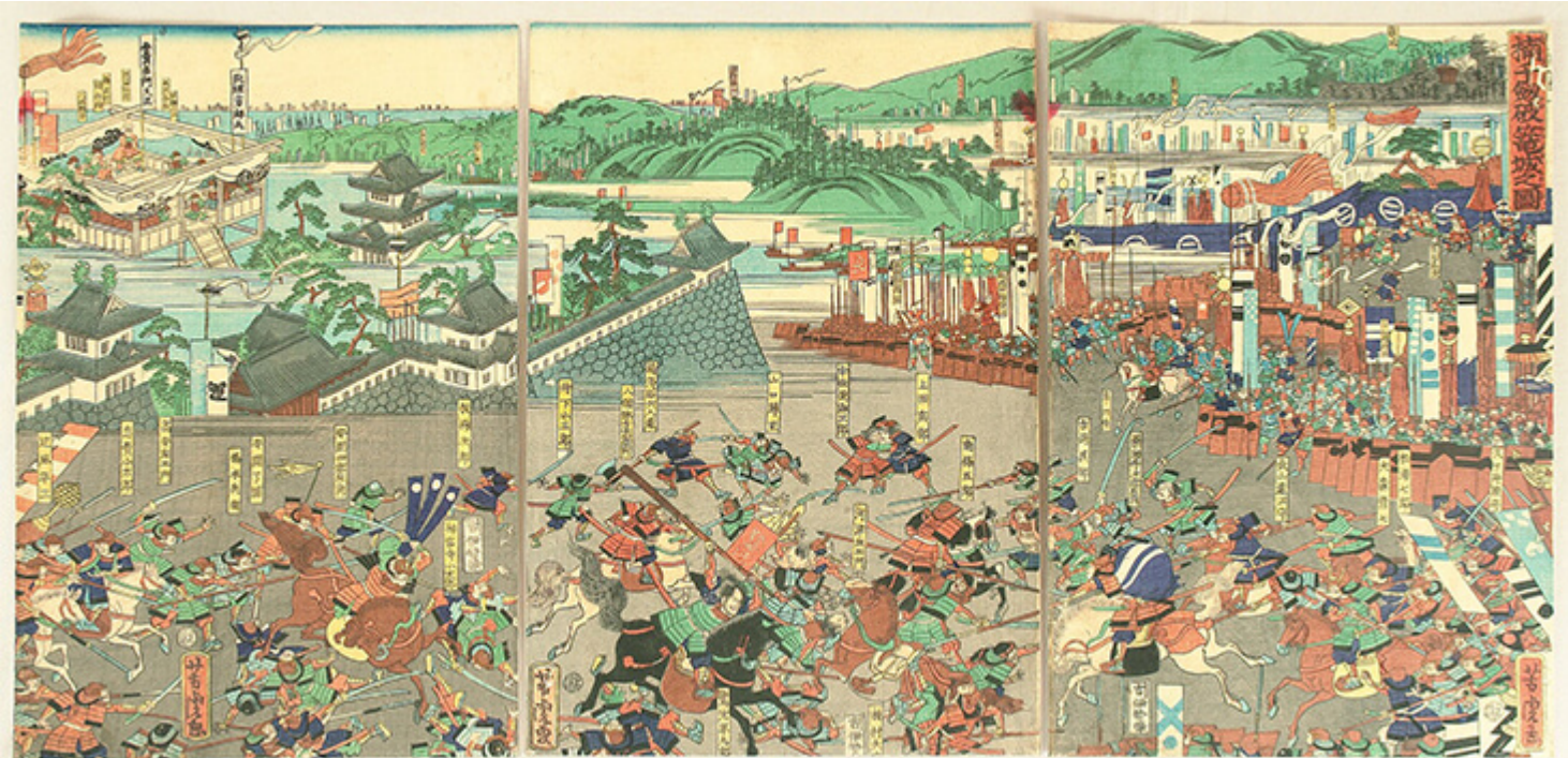
Battle of Ashikaga and Kusunoki, 1860s

flap into the sky as warriors charge towards their fate, while an intense patch of indigo sweeps in from the right and frames the centre of the action.