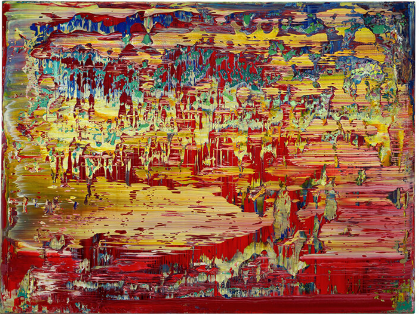
Abstraktes Bild, 1989, Christie's