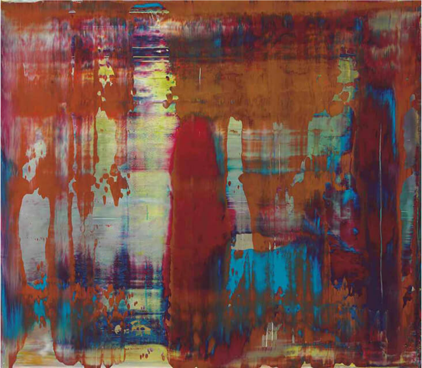
Abstraktes Bild, 1997 Christie's

Made just a year later, the diptych painting Abstraktes Bild , 1990 is smoother in finish, with a glossy, almost metallic sheen that runs horizontally across our line of vision. In its centre, a streak of white appears to catch the light, flickering in uneven ripples as if moving on water. Next to it, underlayers of dark red peek through, adding dark layers of depth and intensity to the image. Abstraktes Bild , (811-2), 1994 has a similar slippery, wet quality, suggesting glassy reflections caught on a shimmering lake. Pale green and