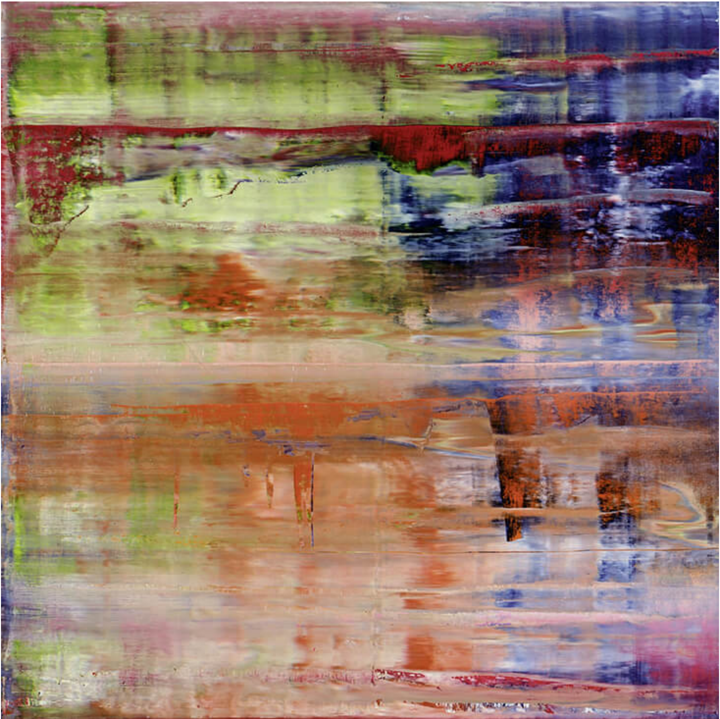
Abstraktes Bild, (811-2), 1994

It was in the 1970s that Richter first began making abstract paintings, and by the 1980s he had perfected a process that occupied him for several decades to follow. First, he would paint bands of colour onto huge, wall sized canvases and let them dry. Over these bands he would squeeze out thick