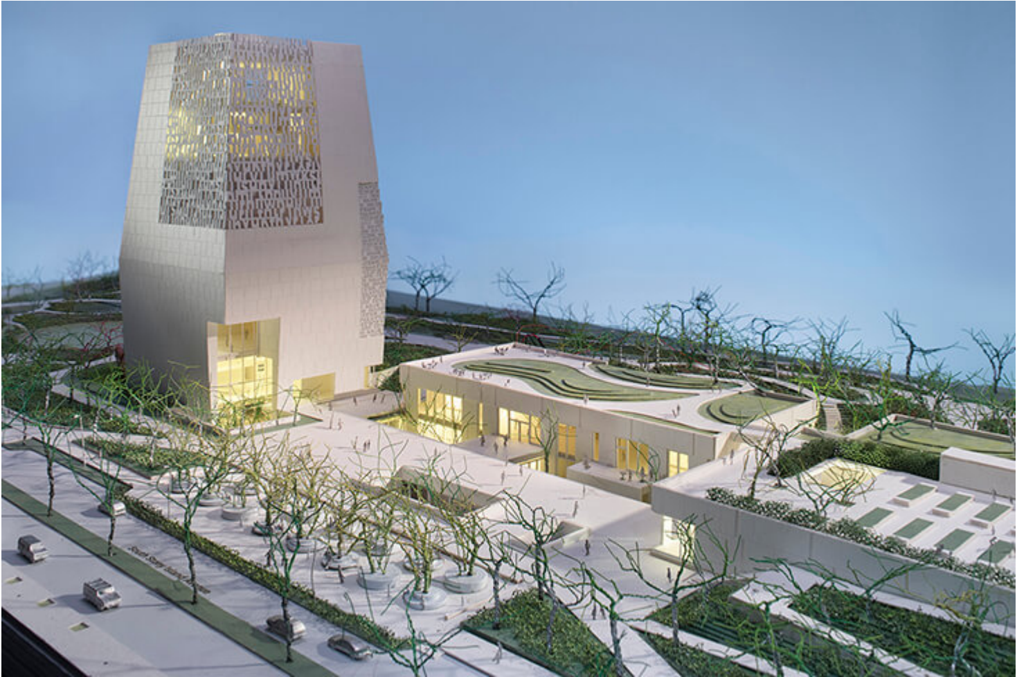
Billie Tsien and Tod Williamsâ design for the Obama Presidential Centre, 2016