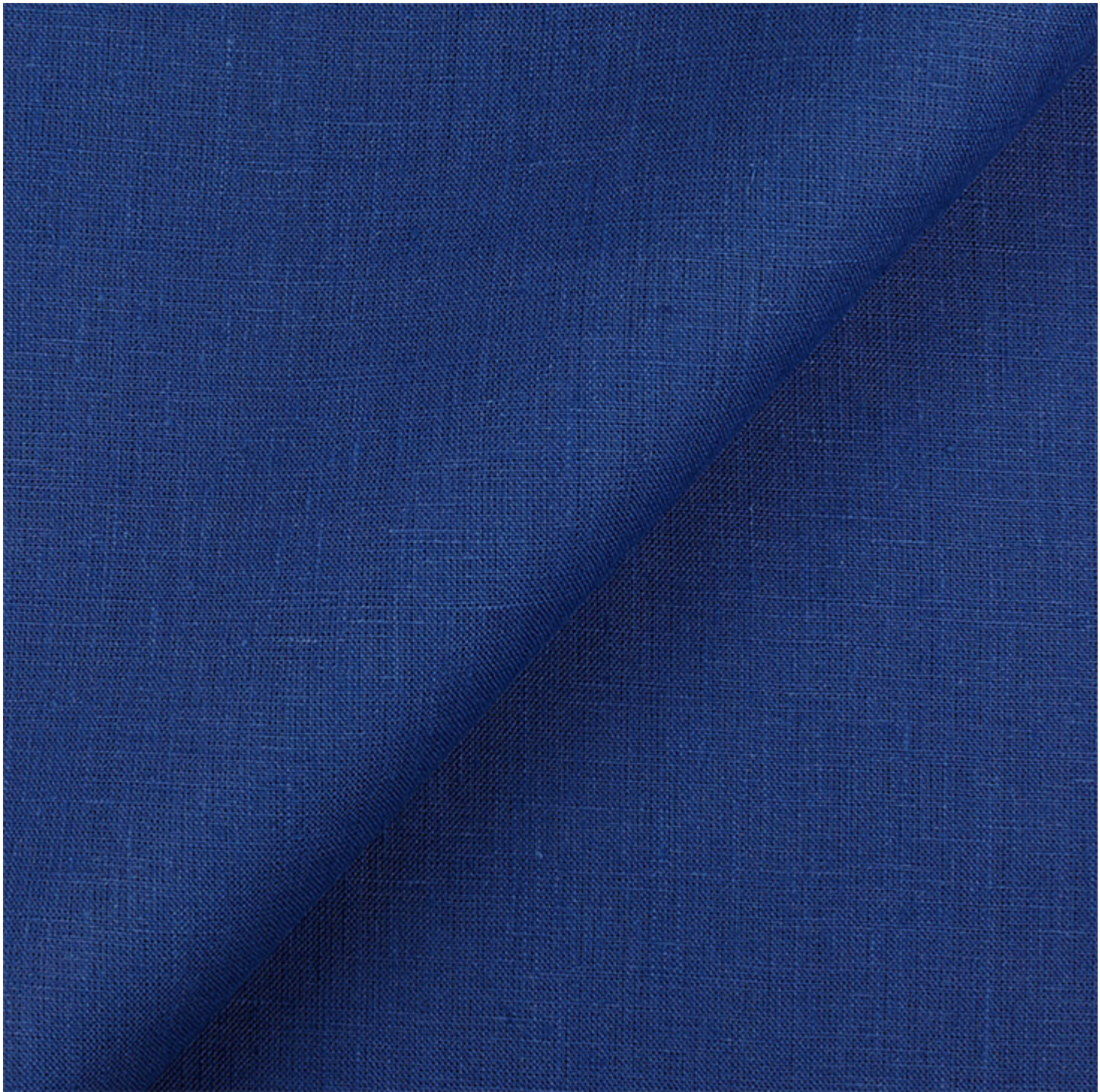
FS ROYAL BLUE Medium Weight Softened 100% Linen

your creations with #FabricsStoreSloanPattern hashtag.