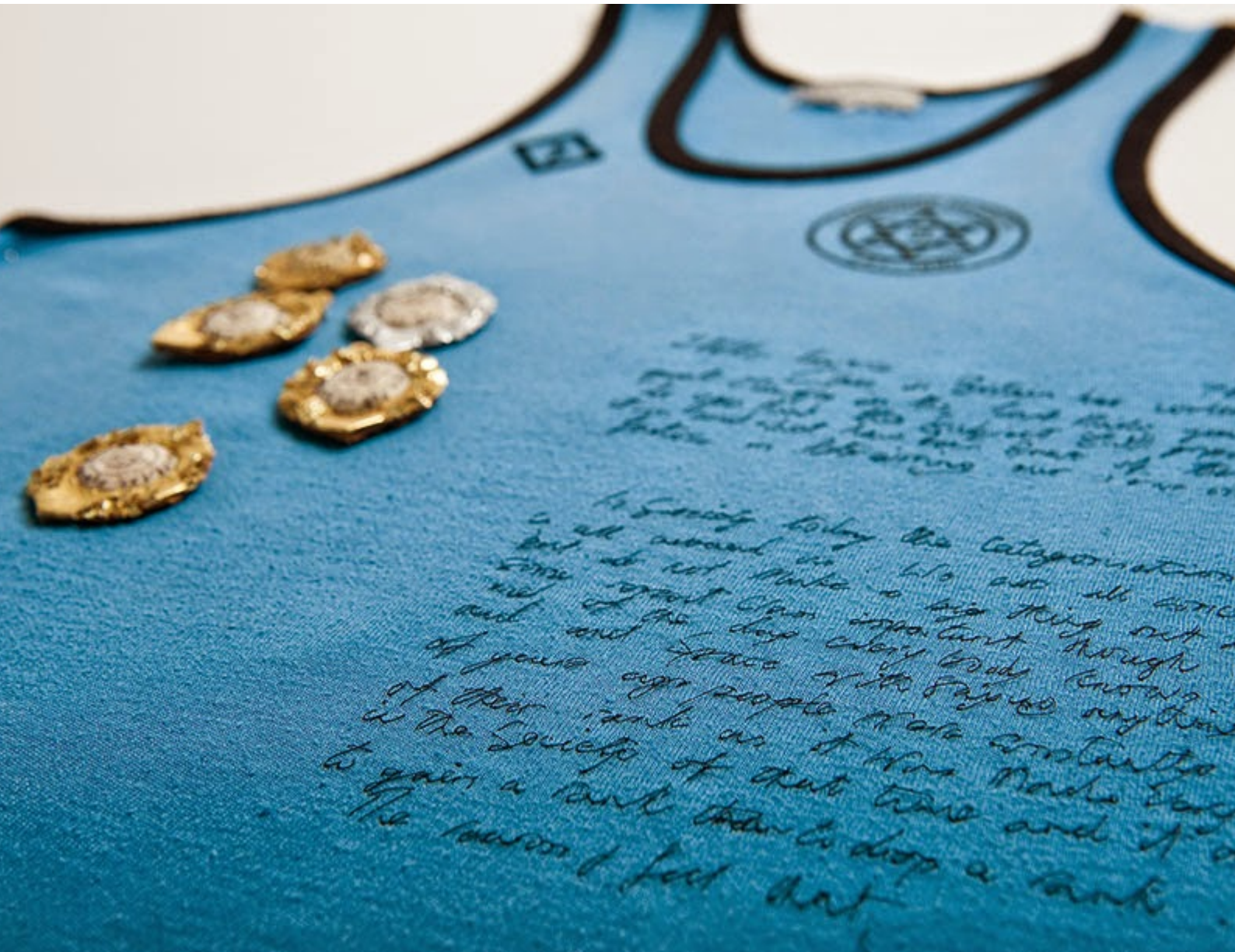
'A Boy who Loved to Run'.