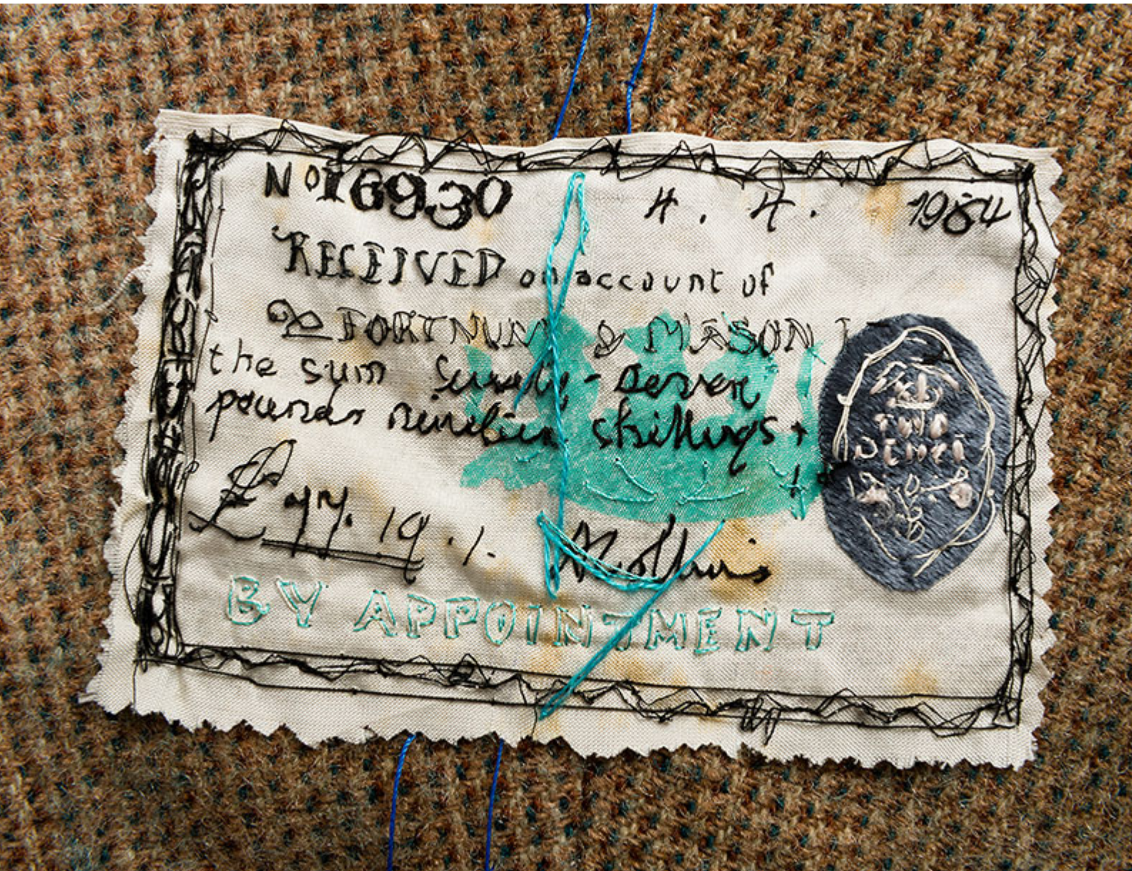
Part of ‘...because its there’ for Fortnum & Mason.