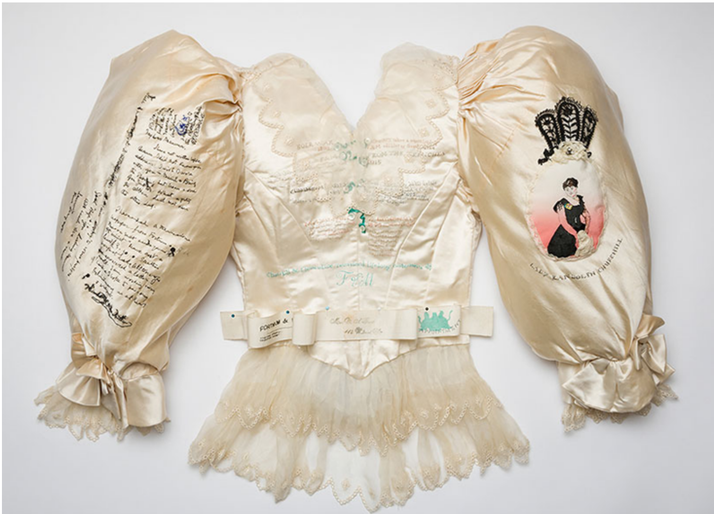
"'I wish I were with you' Commission for Fortnum & Masons, Piccadilly, London"