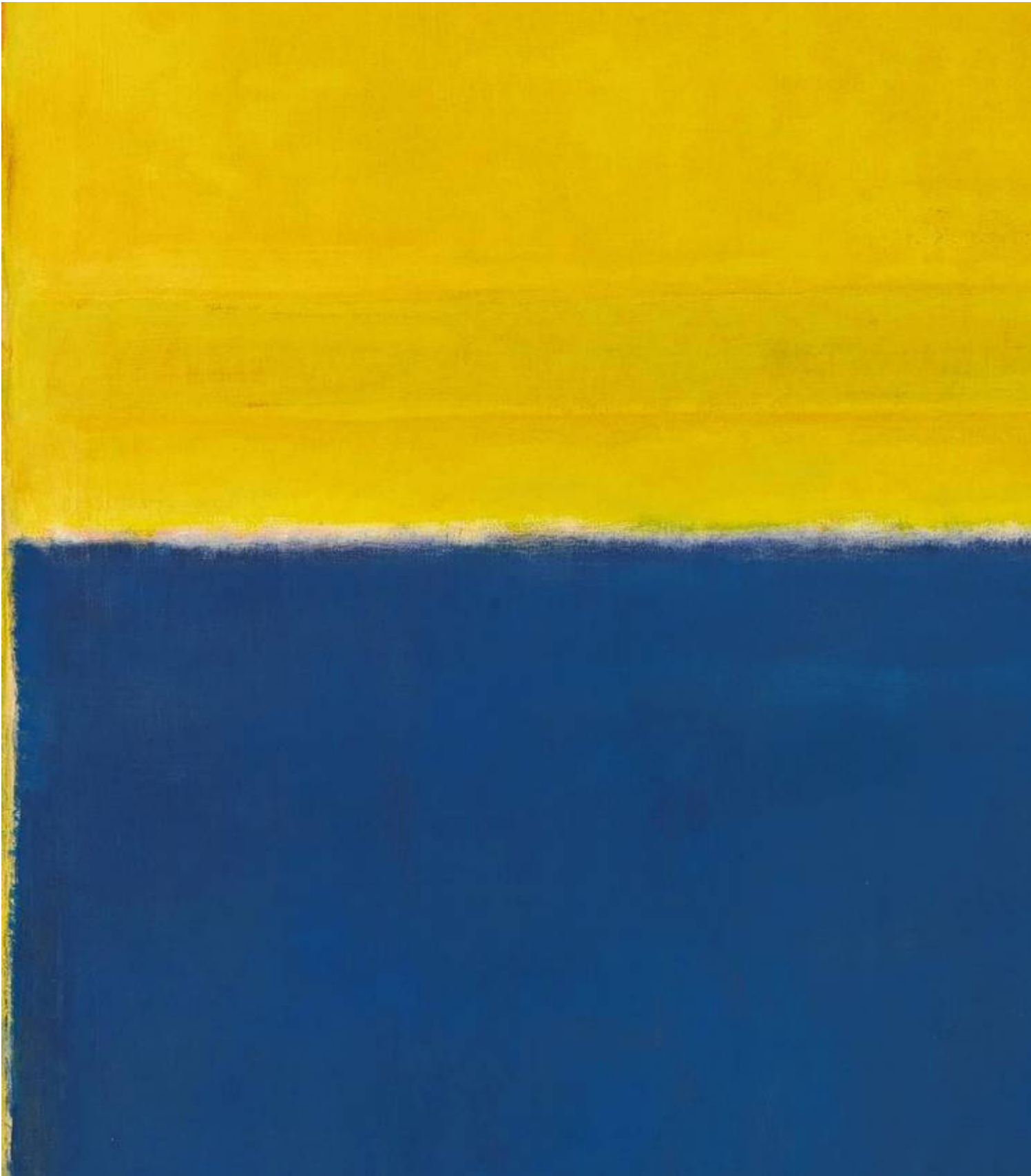
Mark Rothko, Untitled (Yellow and Blue) detail, 1954