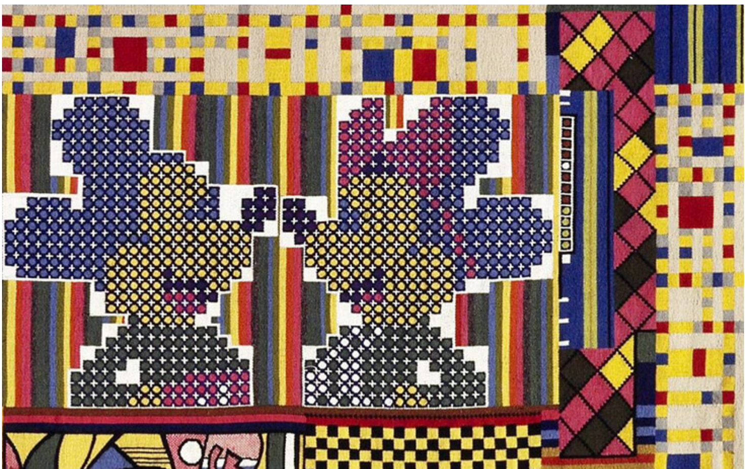
Eduardo Paolozzi, The Whitworth Tapestry (detail), 1967, The Times

After training as an artist in Edinburgh, Oxford and London throughout the 1940s, the young Paolozzi remained in London where he hit the ground running, experimenting with a vast range of different disciplines. It was during these early years that Paolozzi established his place as a leading forerunner in Pop Art, creating endless reams of collages, prints and sculptures that played with cut apart imagery from American advertising.