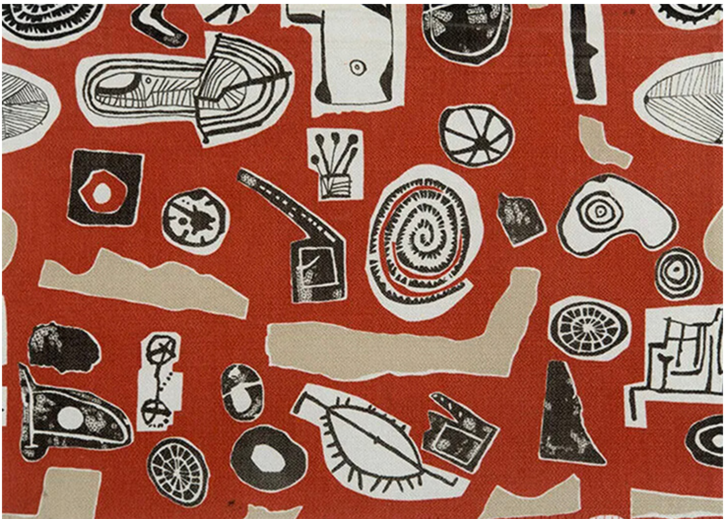
Eduardo Paolozzi, Collage Elements, 1952, screen-printed rayon for David Whitehead Ltd textiles

channels Paolozzi was able to produce some of the most progressive textile prints of mid-century modernism. His designs were recognised for their daring and unconventional motifs and patterns that brought jazzy swirls and stripes in tandem with old pipes and bicycle wheels, proving that just about anything could be recycled into a mesmerising repeat pattern. During the 1950s Paolozzi also taught in the textile and print department at the Central School of Art and Design in London, where he would often work late into the night on his own projects.