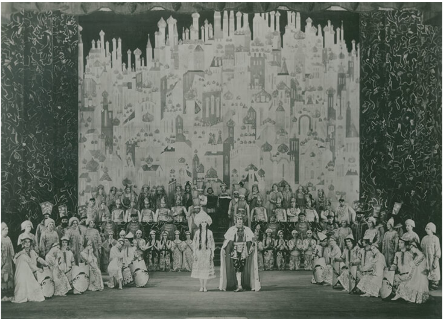
A scene from the ballet The Firebird , 1950s, with sets and costumes designed by Natalia Goncharova

beauty of peasant dresses and fabrics, merged with the faceted forms of Futurism to create a visual feast of colour, pattern and movement. It was the celebratory mood of the story that really fired up Goncharova's imagination, as she explained, "At that time it was the festive, folk aspects of weddings that stood out for me, the colourful costumes and dances that connect weddings with holidays, enjoyment, abundance." Inspiration came, in particular from a village wedding Goncharova attended as a child in rural Russia, filled with overcrowded happiness and excitement, with guests dressed in hand-woven clothing and vibrantly coloured headscarves.