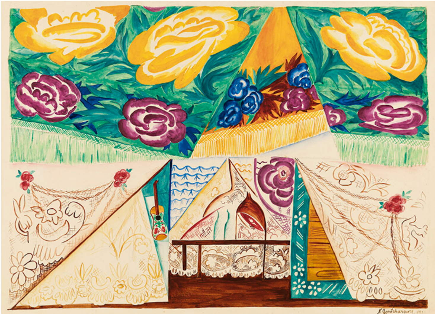
Natalia Goncharova, Set design for Espana or Triana, 1916, Sothebys, London