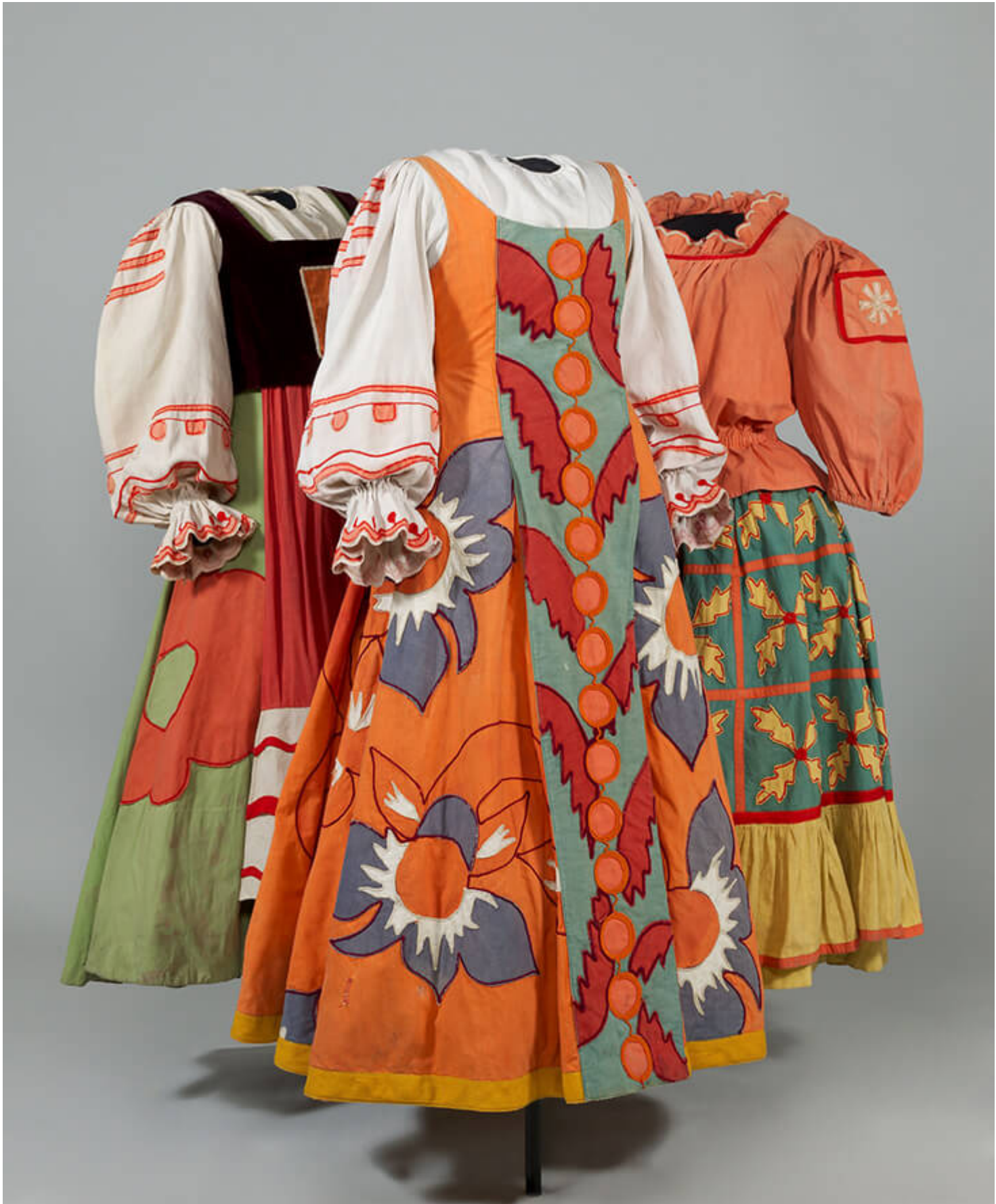
Natalia Goncharova's peasant inspired costumes for Le Coq D'Or, 1914,