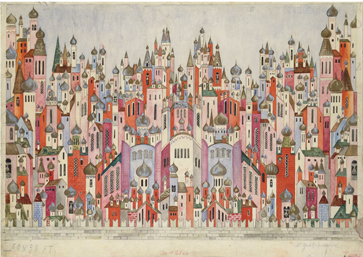
Natalia Goncharova, set design for the final scene of The Firebird , 1926

For the next 15 years, Goncharova worked side-by-side with Diaghilev on a series of hugely successful productions, moving widely throughout Europe with his troupe. Both shared a desire to bring the magic of Russia to European audiences, along with a fascination in the cutting-edge languages of avant-garde European art. They were both also fearless, charismatic leaders who dared to push into uncharted territory, making for one of the most successful collaborations of the 20 th century.