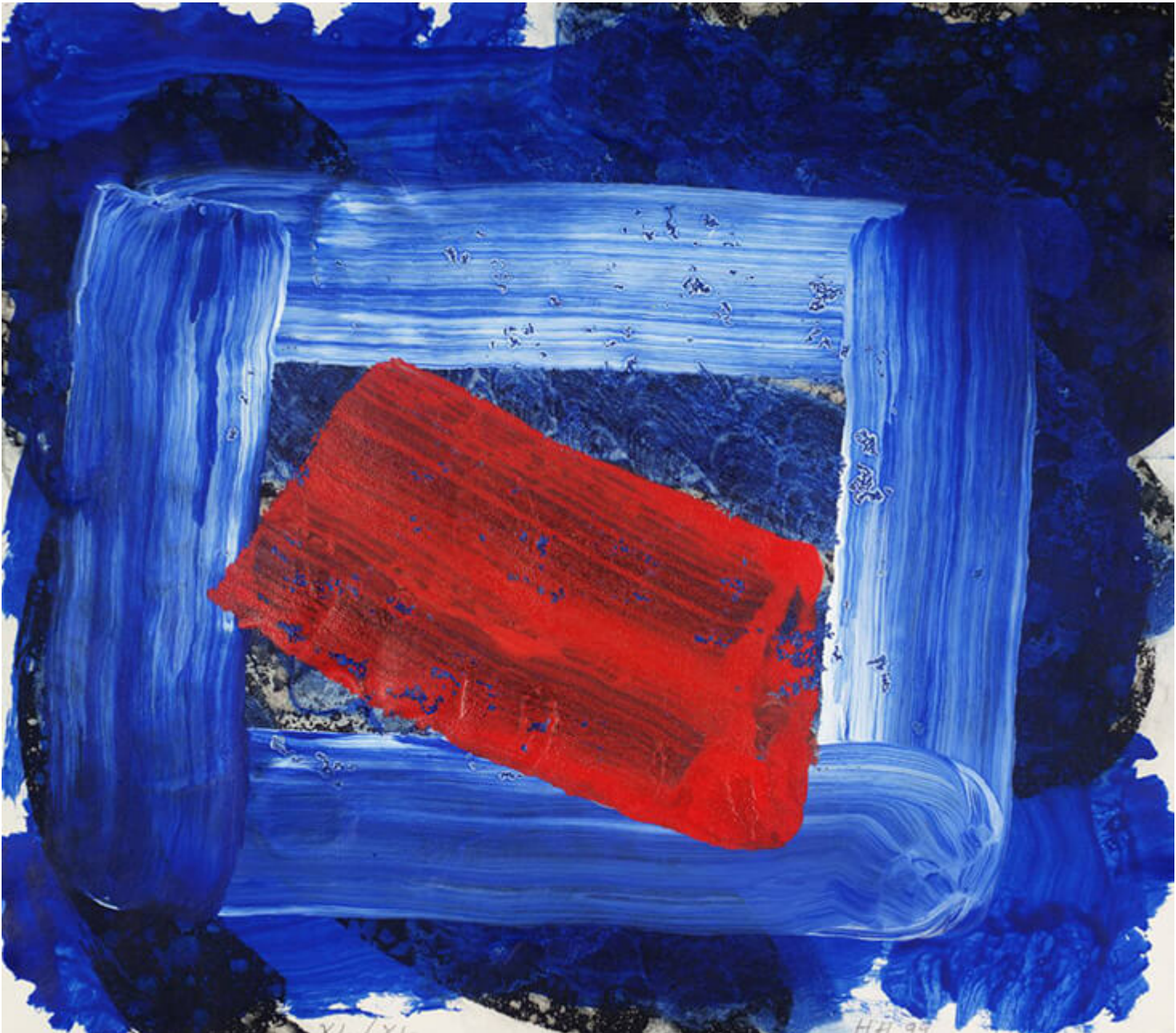
Norwich / Howard Hodgkin / 1999

suspended mid-air. In the later etching Strictly Personal , 2001, angular, gestural brushstrokes sweep across the surface with apparent ease, overlapping one another in a rhythmic, melodic dance. Acid bright crimson seeps into the paper like a deep stain, vibrating against a deliciously liquid streak of apple green.