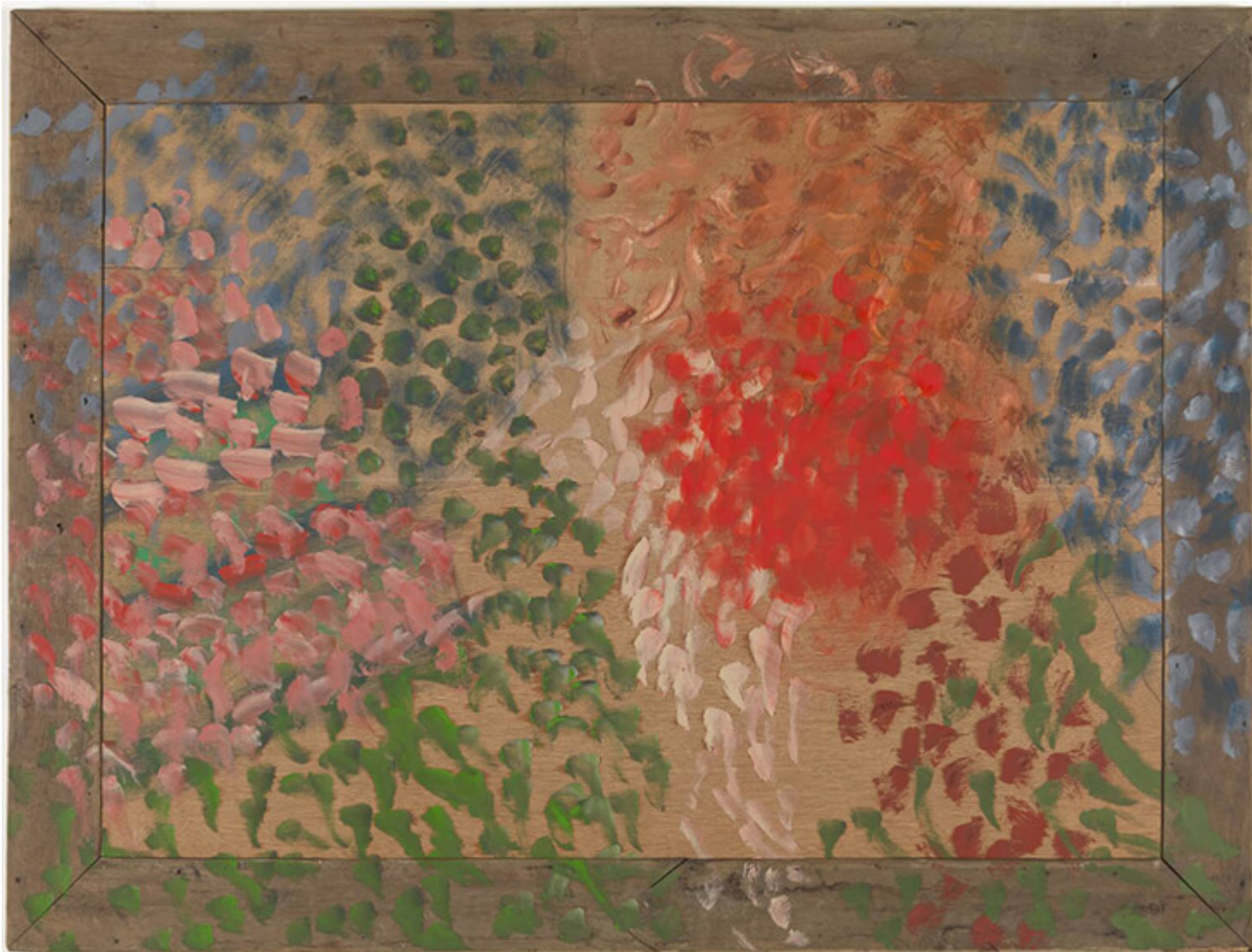
Come into the Garden, Maud / Howard Hodgkins / 2000â3