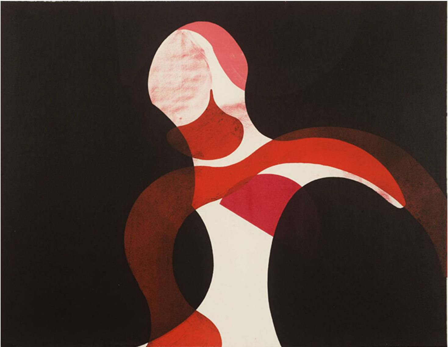
Girl at Night / Howard Hodgkin / 1966

Bold, powerful and intoxicatingly bright, POPPY Linen 's candy hue can bring a snap of life to everything around it. British abstract painter Howard Hodgkin saw this colour's vibrant, sparky potential, layering it into his evocative arrangements of colour, texture, shape and light as a foreground flare of colour that jumps towards us. He also saw the potent emotional resonance in this shade of red, which brings fiery heat into his intensely personal artworks, leaving them red raw with passionate wounds of expression. "The only way an artist can communicate with the world at large is on the level of feeling," he wrote.