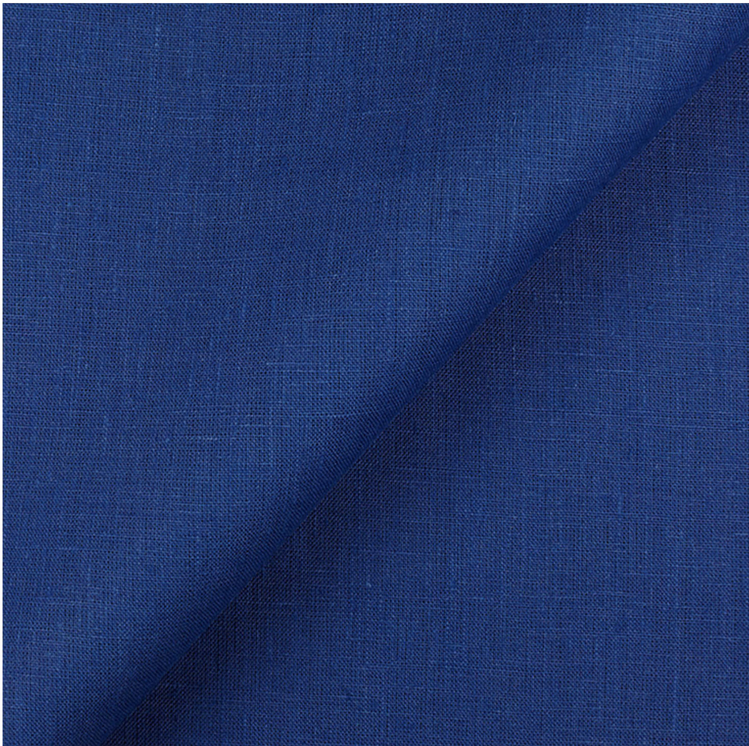
FS ROYAL BLUE Medium Weight Softened 100% Linen

your creations with #FabricsStoreSloanPattern hashtag.