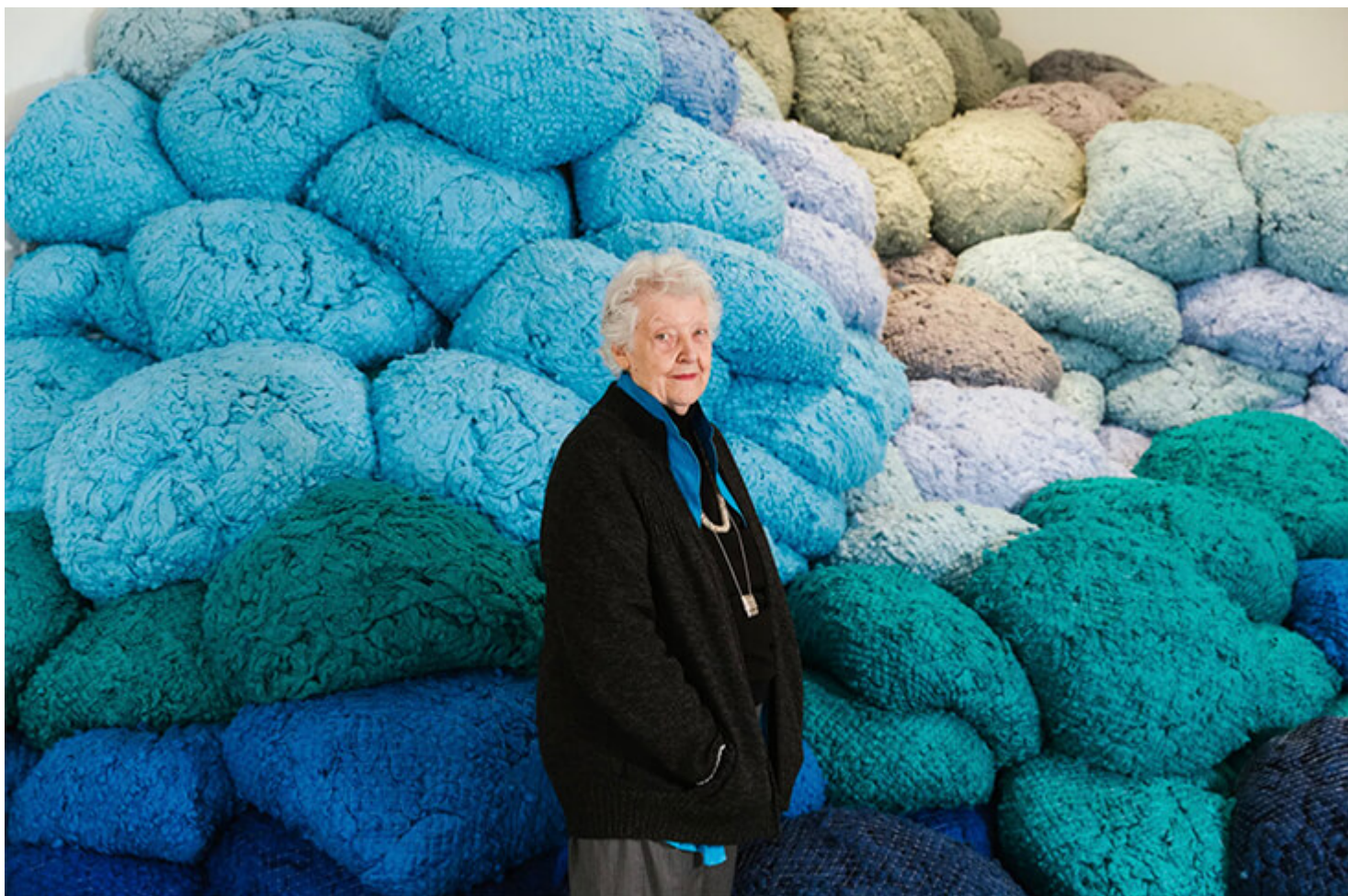
Sheila Hicks at The Hepworth Wakefield

While it's clear that Hicks has had a profound impact on a whole host of contemporary artists who see in her work the wild and spontaneous potential of thread, that was never Hicks's intention. She says, "I don't want a legacy. I just want to have fun while I'm here." But after a lifetime of making weavings in just about every size, material and variation possible, she still continues to emphasize the importance of challenging herself, and expecting the unexpected. "I don't want to go do something I know how to do," she says, "I want to do something I don't know how to do."