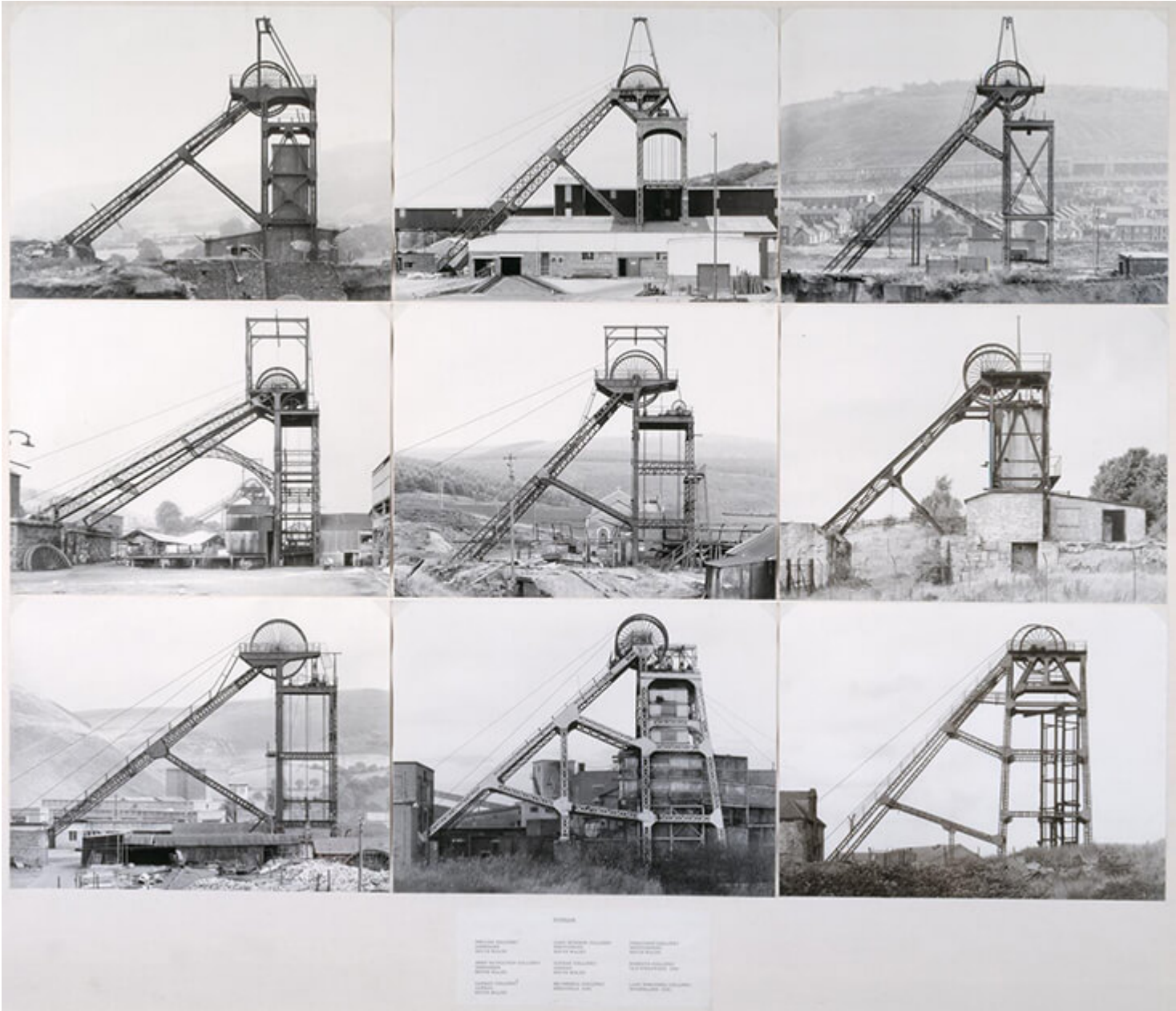
Bernd Becher and Hiller Becher, Pitheads, 1974, Tate

Over time, Beuys's teaching methods became increasingly erratic and experimental. He declared "everyone is an artist," and admitted any willing students into his lessons, even if they had failed the entrance exams. Beuys encouraged his students to see their daily lives as a continuous work of art and argued that simple acts like posting a letter could be as much a work of art as a hand-crafted object. He even founded a political party with his students, called the German Student Party. Such was his popularity, Beuys