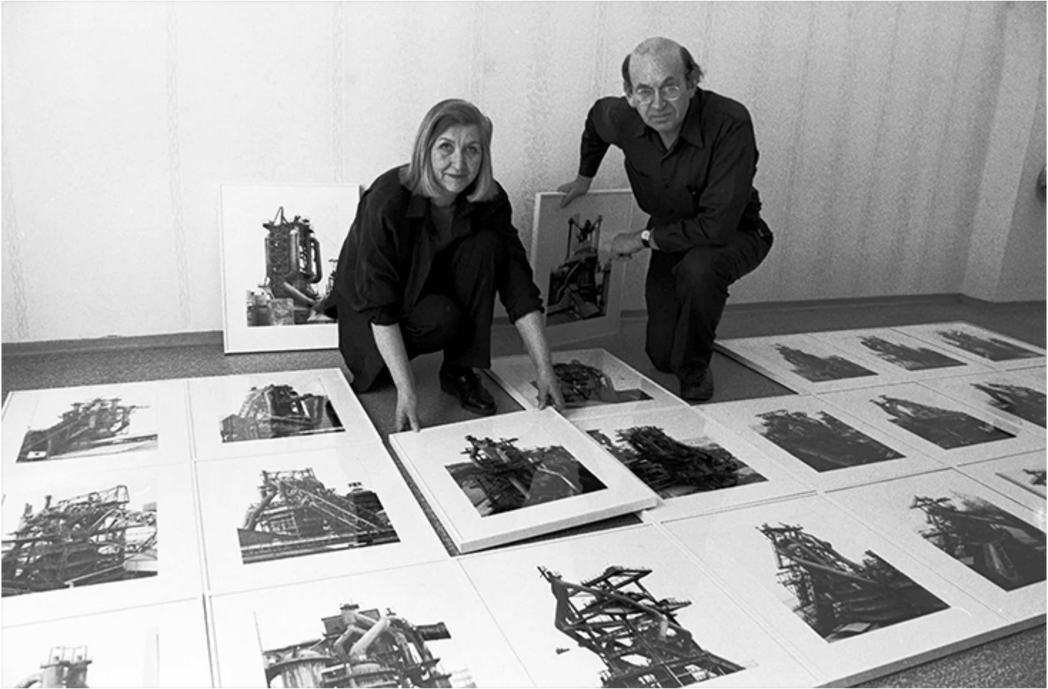
Bernd Becher and Hiller Becher with their striking minimalist photography

Beuys was appointed as professor of monumental sculpture at the Kunstakademie in 1961, but his teaching methods moved far beyond sculpture, incorporating elements of performance, poetry, installation and drawing. In fact, drawing was at the core of Beuys's teaching, because he believed it rooted each and every student to their own autonomous way of seeing and understanding the world. He told his students, "You mustn't look how the others draw, but must discover your own way of drawing." He also organised "ring discussions" in which students would gather in a circle and have active discussions about world politics and how it could inform their artistic practice.