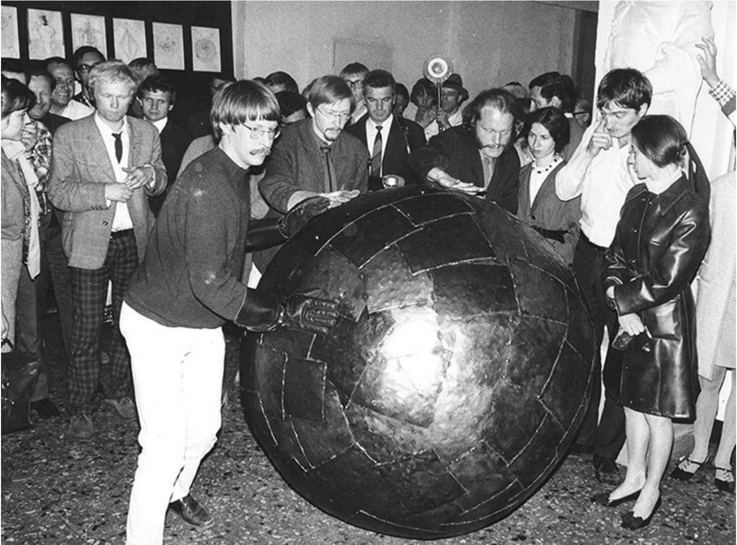
Students at the Kunstakademie Dusseldorf in the 1970s

Kunstakademie Dusseldorf was founded in 1773 in the relatively small German city of Dusseldorf, and it quickly became recognised across Germany as a leading art institution. In the 1960s, the school hit the international stage, and this was largely because of the school's outstanding roster of teaching staff. One of the school's most influential and boundary-pushing teachers was the legendary performance artist and "social sculptor" Joseph Beuys, who saw teaching as an extension of his art practice. He even claimed, "To be a teacher is my greatest work of art."