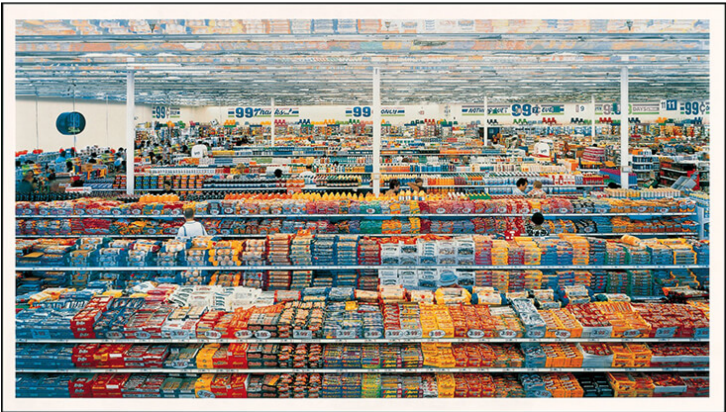
Andreas Gursky, 99 Cent, 1999, the San Francisco Museum of Modern Art

serial artworks merged the boundaries between photography, conceptual art and even sculpture in an entirely new and novel way. As teachers, the Bechers encouraged their students to take an observational, socially engaged approach to photography, and to find ways of relating their photographs to their own humble, ordinary, and individual experiences out in the real world. Today, a core group of the Bechers' former students from the 1970s and 1980s, including Andreas Gursky, Thomas Ruff and Thomas Struth, are world-renowned, and known collectively as the Dusseldorf School of Photography. Meanwhile, the conceptual approach that the Bechers pioneered continues to dominate the nature of photography today.