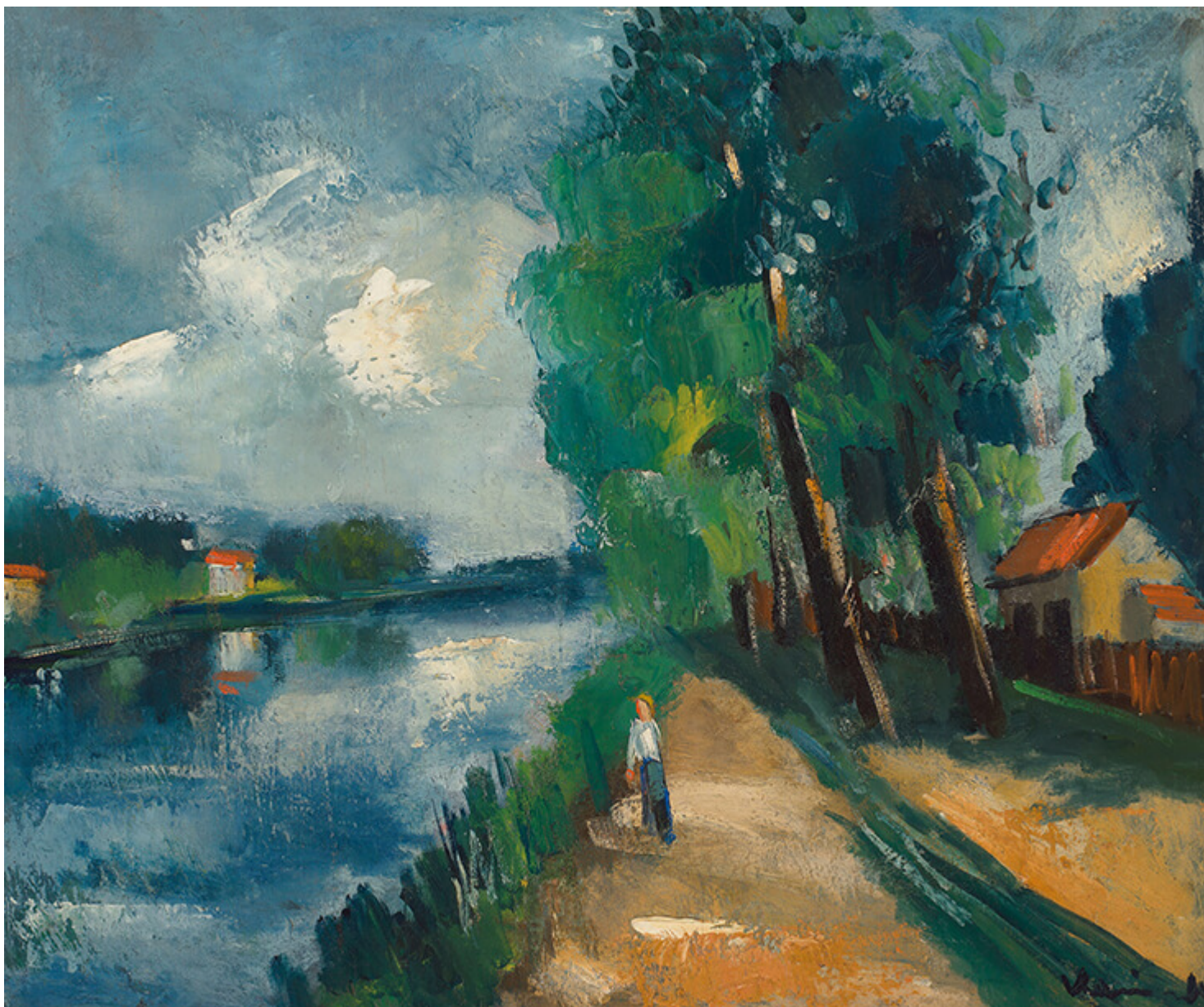
Maurice de Vlaminck, Promeneuse au Bord de la Rivière , 1918

Much like Monet, the French Fauvist painter Maurice de Vlaminck looked to the natural world for his subject matter, and he also painted directly from life. But Vlaminck's use of colour was more forceful and charged, derived as much from nature as the wild, turbulent inner workings of his mind. Meanwhile, his brushstrokes were bolder, bigger, and gutsier. Promeneuse au Bord de la Rivière , 1918 was made early in Vlaminck's career, when he had recently begun making his name as a leading Fauvist alongside his contemporaries Henri Matisse and Andre Derain. Here a simple amble