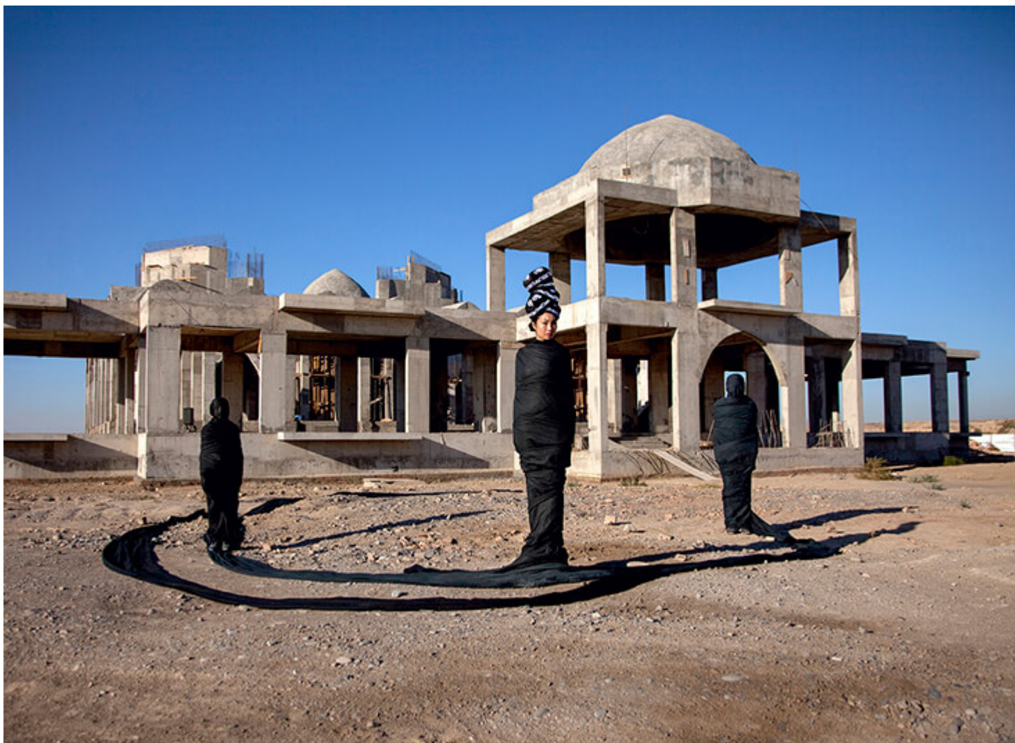
The Global Entry 1, Almagul Menlibayeva, 2011

In her work The Global Entry 1 , women swathed in black are interconnected by the fabric that binds them. The fabric also mimics the shadows, while the women's bodies resemble columns of the unfinished and abandoned building in the background.