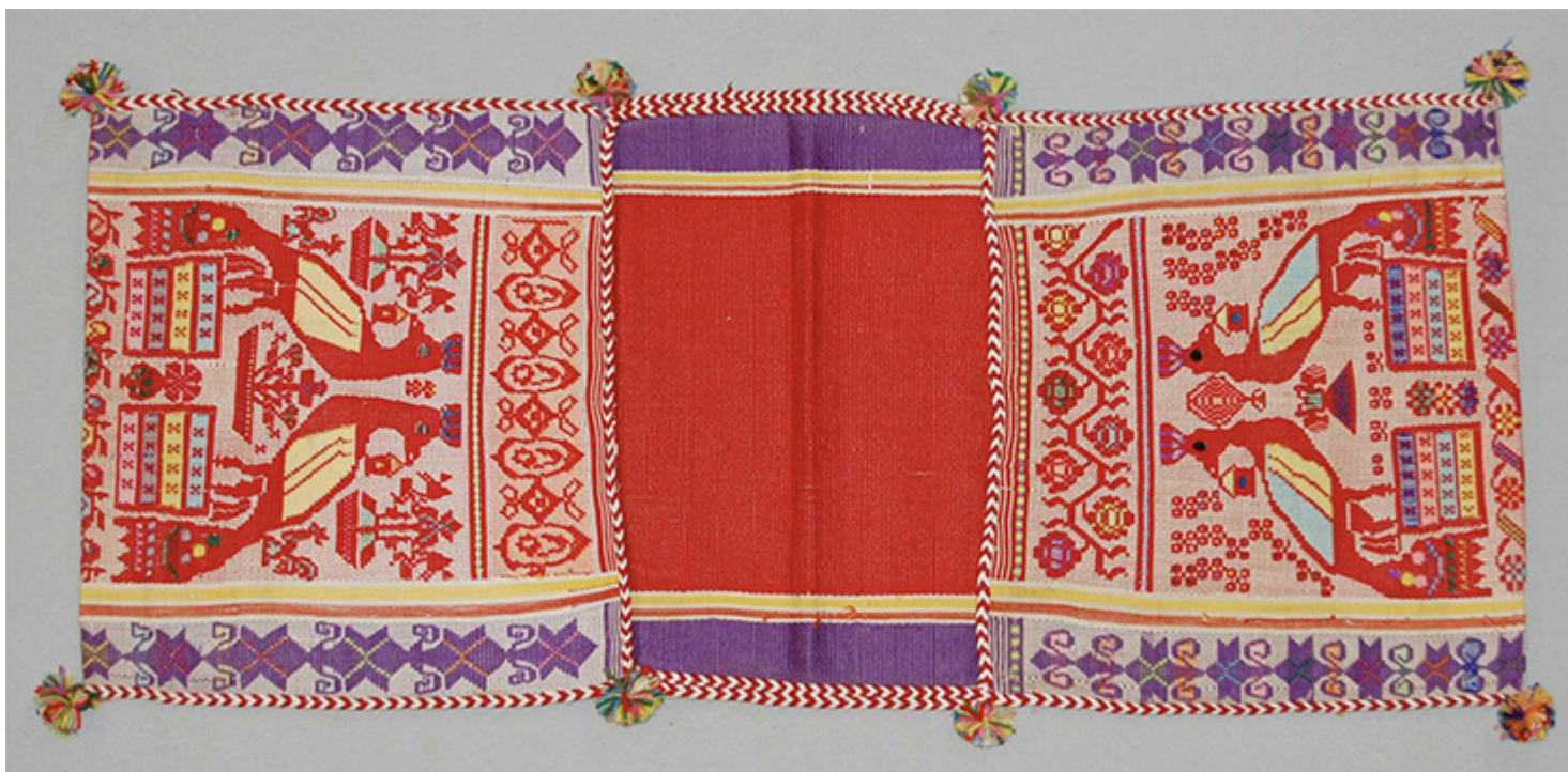
Embroidered Alphorja, saddle bag, North Peru, 1980s

Embroidery has remained a mainstay of South American society since this time, and cultures across the continent have developed their own distinct embroidery traditions, often relating to the garments they adorn. In many indigenous cultures, woven bags were an important item that could help identify where a wearer was from, with motifs that related to a particular area such as local wildlife, star patterns and plant forms. Other significant items of embroidered clothing include the Manta cloak, originating from Peru and later popular throughout South America and Mexico. Made from a square of fabric, it is more commonly known today as a poncho, and worn by men, women and children.