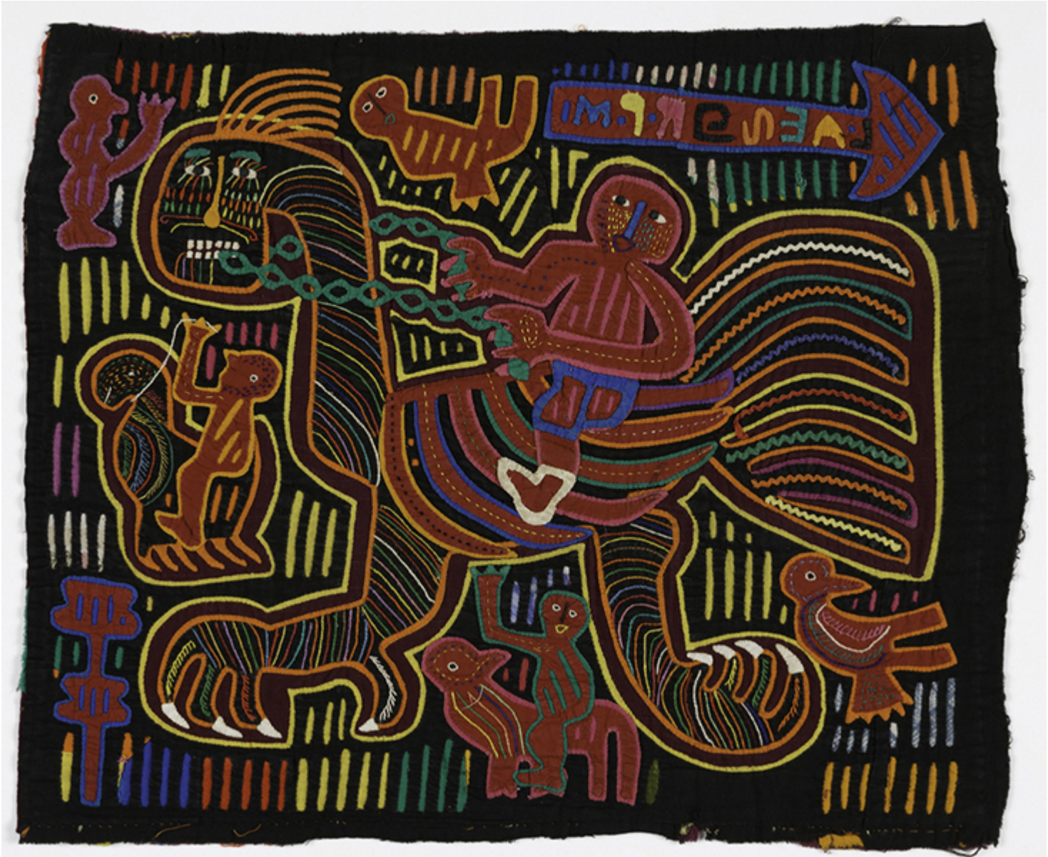
Embroidered mola blouse, made by the people of Kuna, Panama, 1965

The mola is another traditional garment from South America, originating in Panama, a short-sleeved blouse decorated on the front and back with dazzling panels of ornate embroidery in intense, vivid colours, usually worn by women. It is thought the style evolved from the indigenous Kuna women of Panama, who used to paint their naked bodies with similar intricate designs, which were later translated into embroidery.