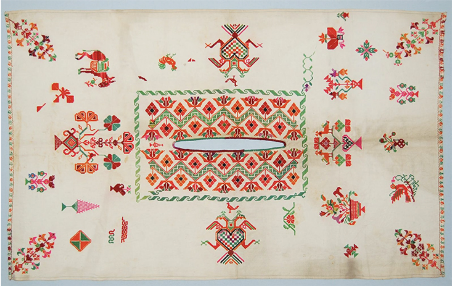
Embroidered Huipil, Mexico, early 20th century

Mantas were originally worn for festive occasions, but they have been adopted more recently as a practical form of outerwear that persists today. In early centuries the embroidery on mantas was usually carried out by men, but it later became a predominantly female occupation. Some are particularly elaborate, featuring richly illustrative embroidered stories including battle scenes, mythology and the natural world, while others feature geometric zig-zagged patterns.