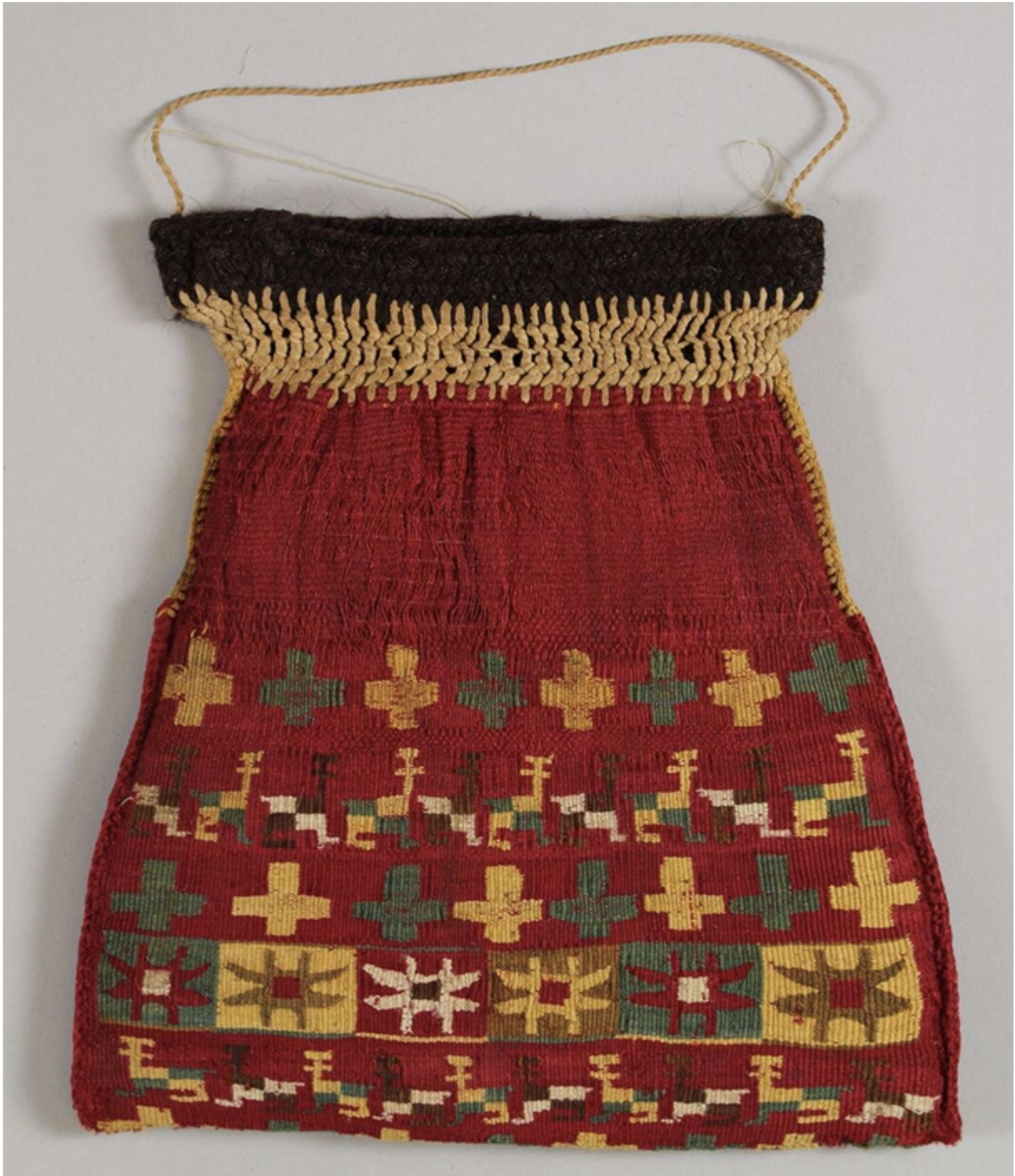
Peruvian woven bag, around 1533