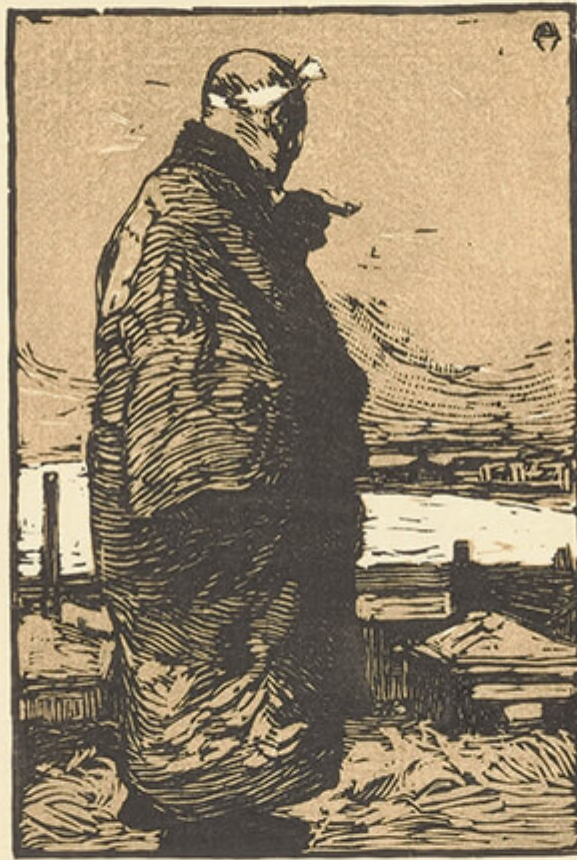
Kanae Yamamoto, "Fisherman," 1904