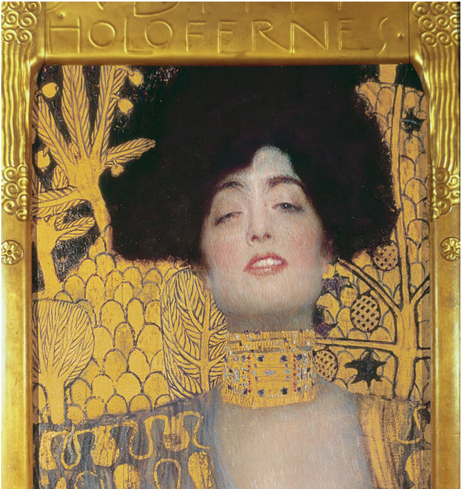
Gustav Klimt, Judith, 1901 (detail)

Klimt met Flöge in 1891 and she became his lifelong muse and creative partner for the rest of his life. A strong-minded, independent woman, Flöge