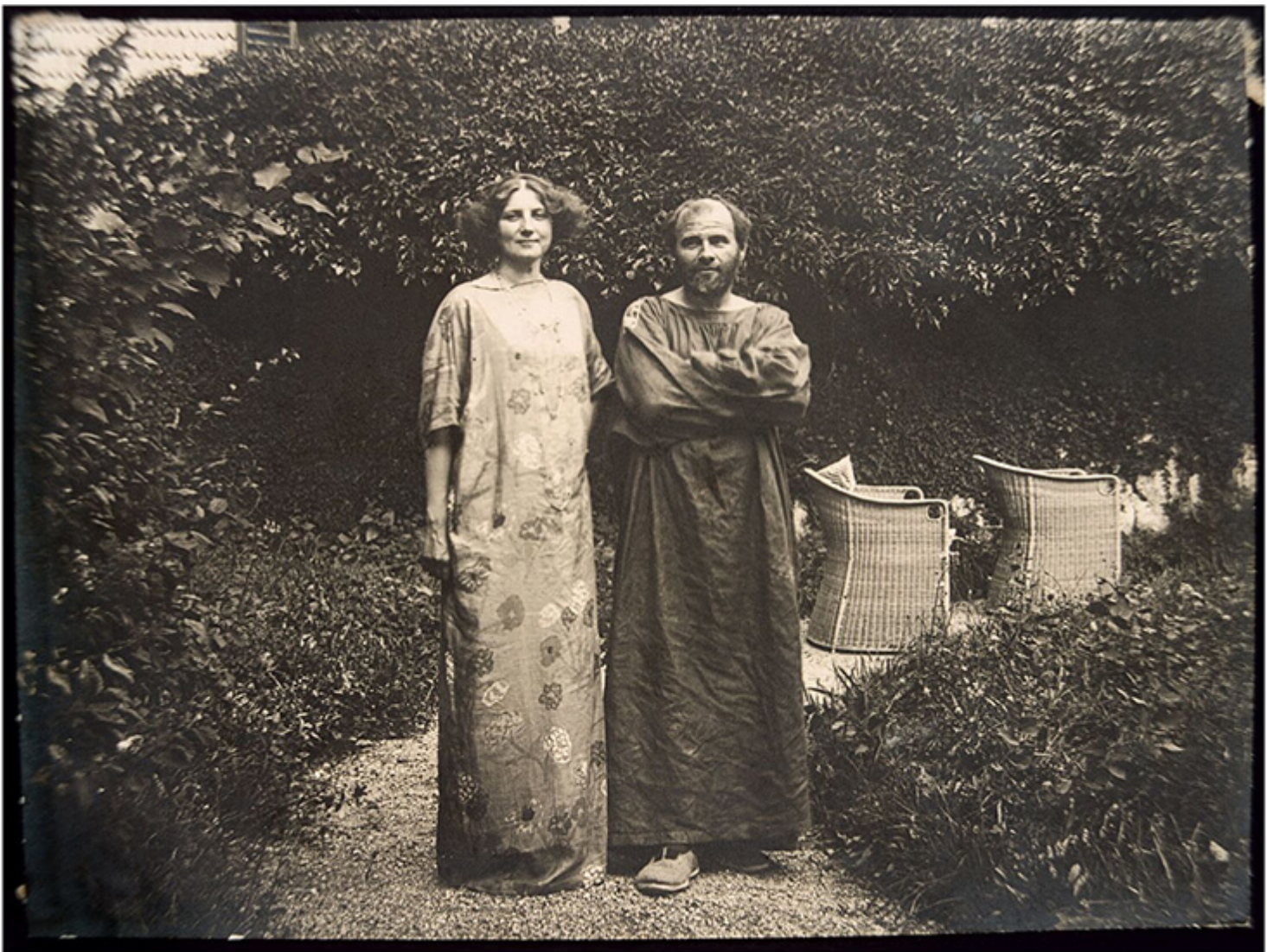
Gustav Klimt and Emilie Floge wearing their loose "Reform" style clothing,

Austrian Art Nouveau painter Gustav Klimt is world-renowned for his sinuously flowing fabrics that adorned women and intertwined lovers in richly ornate blankets and gowns. But perhaps less well-known is the love affair he had with fashion designer Emilie Floge, and the impact their creative interchange had on the shape of his art. Floge's loose, bohemian clothes and "Reform" dresses became a defining feature of Klimt's art, flowing upon bodies of his figures and transforming them into sensuous, erotic and all-powerful goddesses.