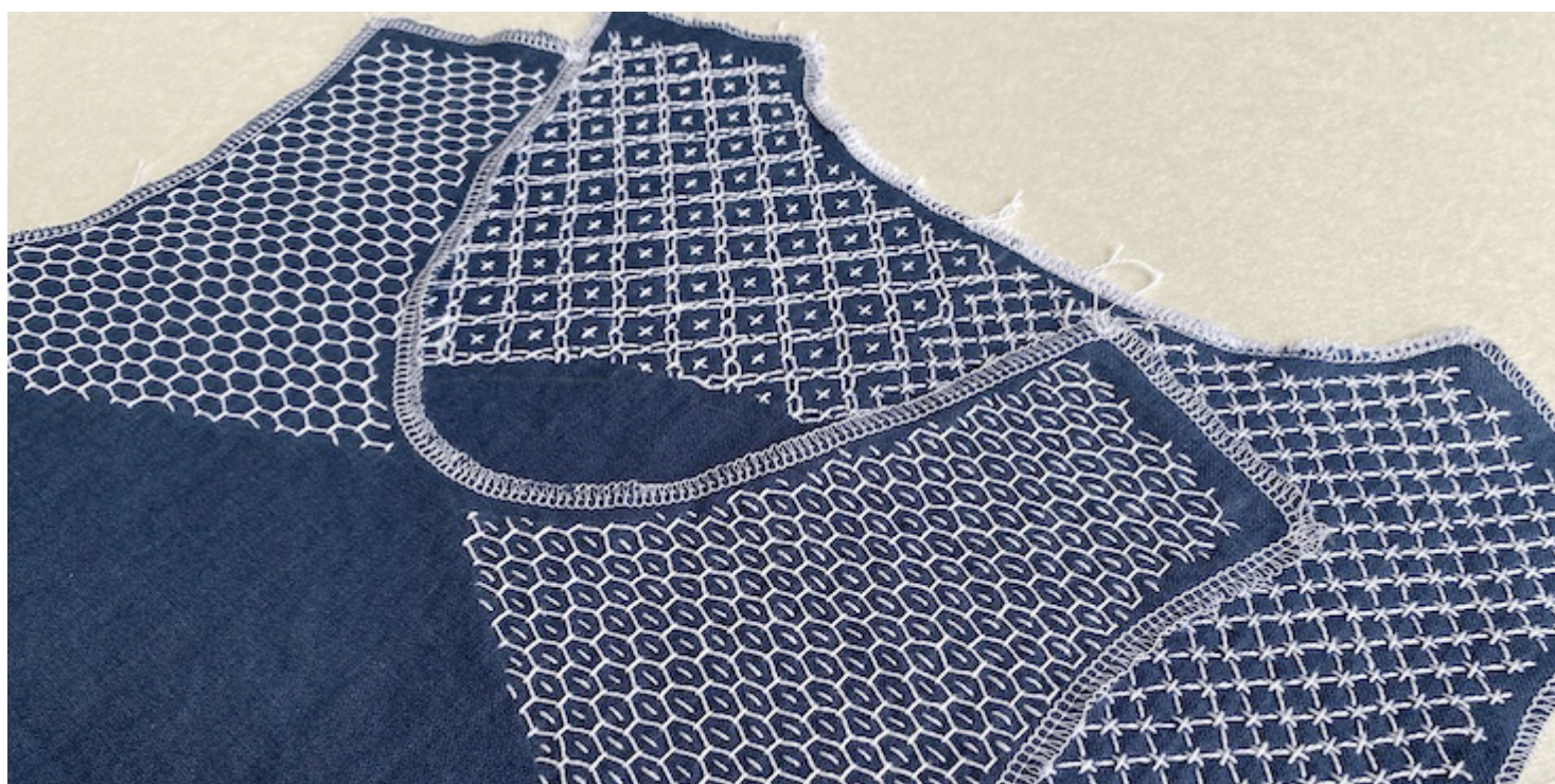
Completed Sashiko embroidery on the front and back bodices

There are two views in this pattern, one is hip-length, and the other is cropped. In addition, there are two options available for finishing the neck, armhole and hem. I went with the option of using the all-in-one facing and the hem facing. The other option is to finish these seams with bias-binding. I chose the option of the all-in-one facing because the facing conveniently provided a layer to protect the reverse side of the embroidery. The Sashiko was applied within the framework of the facings. In the back facing, you can see the elegant curves of the facing which has been showcased by the embroidery.