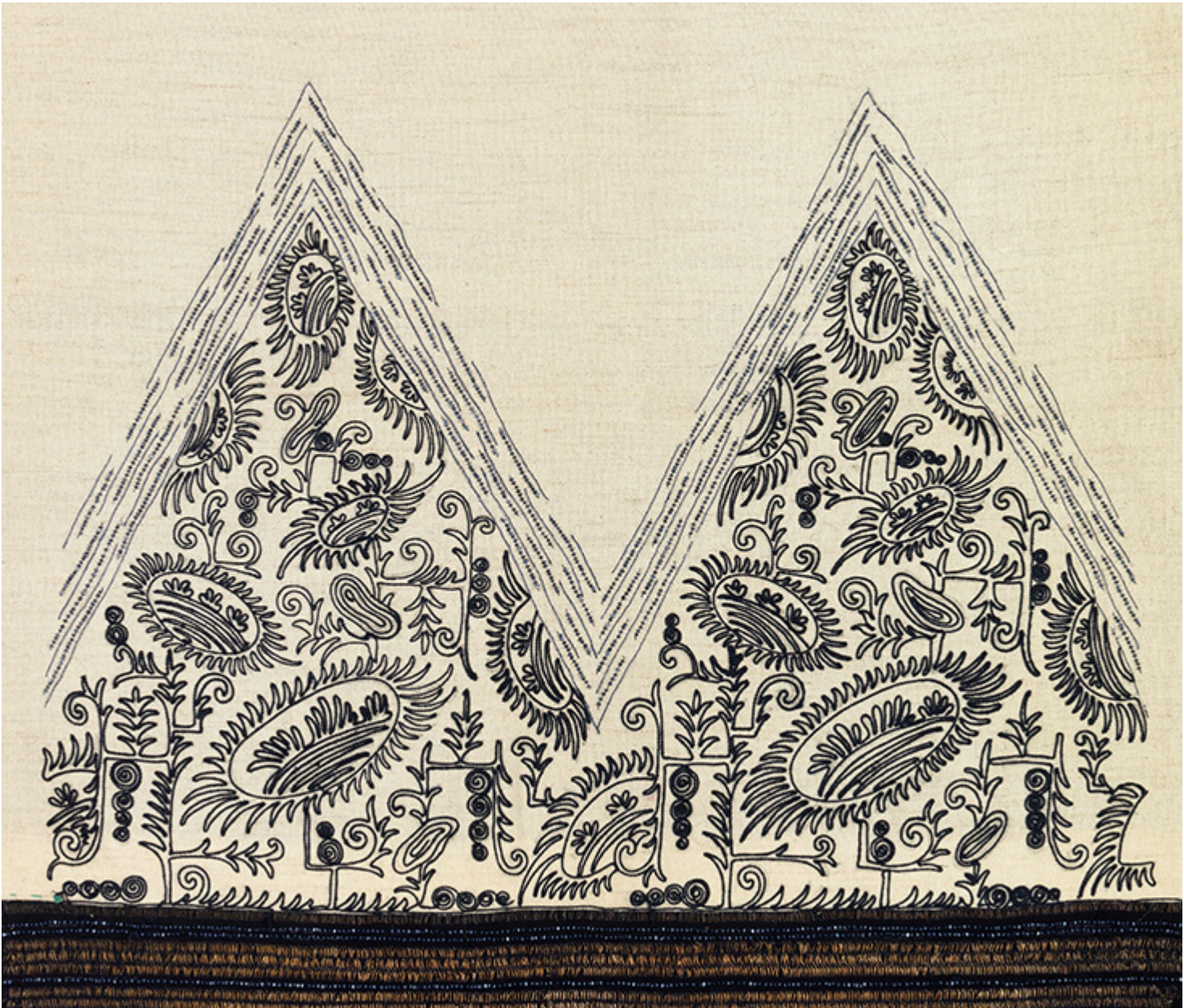
Sarah Lipska, 1920â29

As an embroiderer Lipska was radical and experimental, weaving with metallic, silk, or brightly coloured thread onto a variety of fabrics ranging from silk and cotton to soft panels of leather. To create dense, tactile surfaces she often integrated different textures of thread into the same panel of fabric, or included indulgent elements oozing with glamour such as glass beads or rhinestones, which were brought to life in the flapper party clothes of the 1920s.