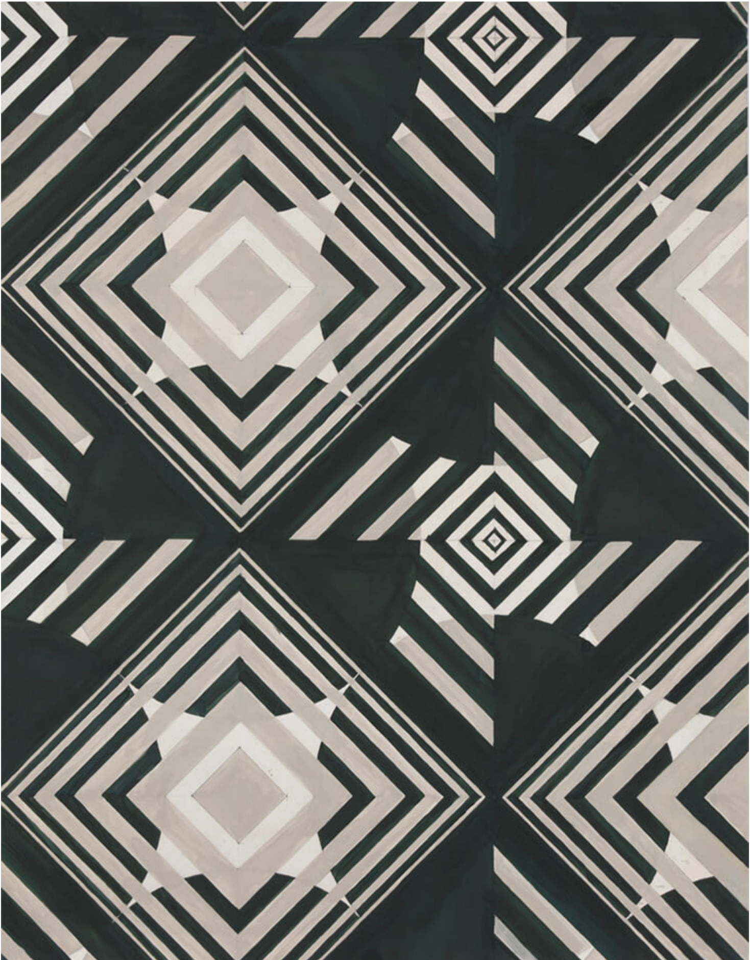
Drawing for a Textile Design Series 'Circles and Rhombi', Anna Andreeva, Page 12 blog.fabrics-store.com