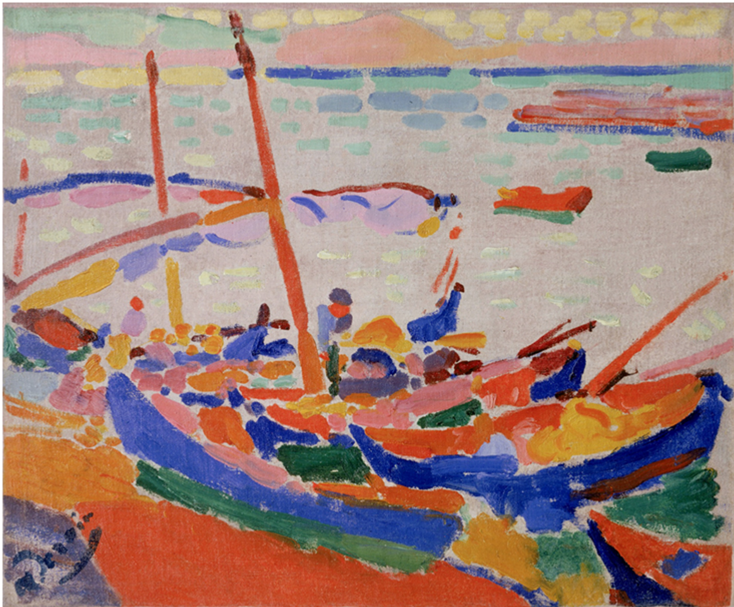
Fishing Boats, Collioure / André Derain / 1905

MECCA ORANGE linen is backlit with scorching heat, recalling French Fauvist Andre Derain's glowing, sun streaked landscapes. He was intoxicated with the golden light in the South of France, painting it with heightened colours that seem to buzz with the electrifying energy of life. Looking back on the frenetic brushstrokes and dazzling colours of Fauvism that defined his career he wrote, "Fauvism was our ordeal by fire" colours became charges of dynamite. They were expected to discharge light..."