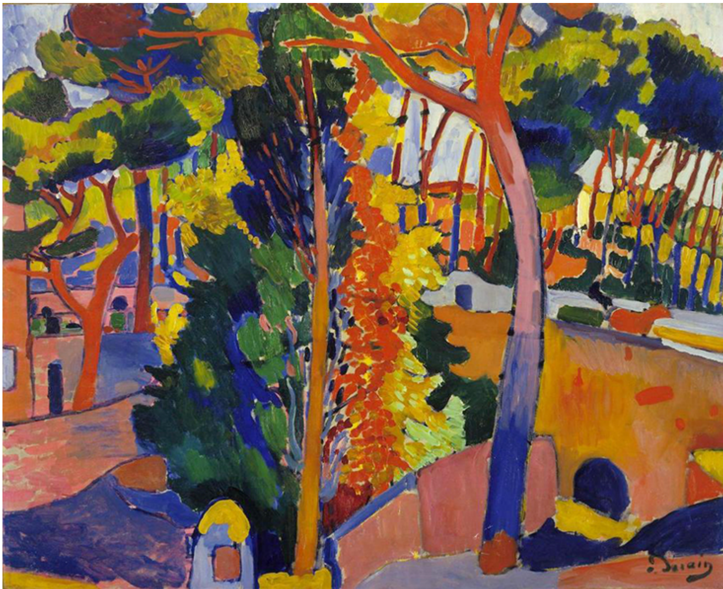
Bridge over the Riou / Andr  Derain / 1906

reflected Derain as he lost himself in the sun-drenched landscape.