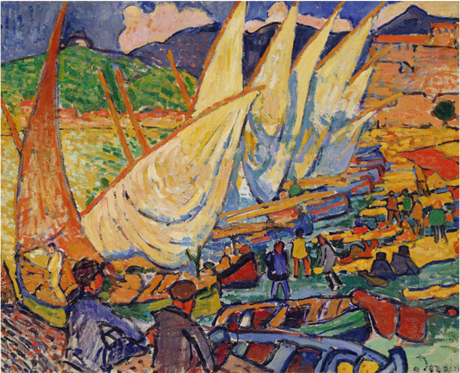
Fishing Boats, Collioure / André Derain / 1905

In the following years Derain explored wider regions in the south of France during the summer months. In 1906 he spent time painting in L'Estaque, following in the footsteps of his great predecessor Paul Cézanne, hoping to find the same entrancing unspoilt idylls. Like Cézanne, Derain sought in nature, "something different" – something which is fixed, eternal and complex. There Derain produced one of his most iconic works of art, The Turning Road, L'Estaque , 1906, where trees become blazing flames of colour, burning orange, red and yellow in the intense hot sunlight, offset by deep indigo patches of cool shadow. "The substance of painting is light,"