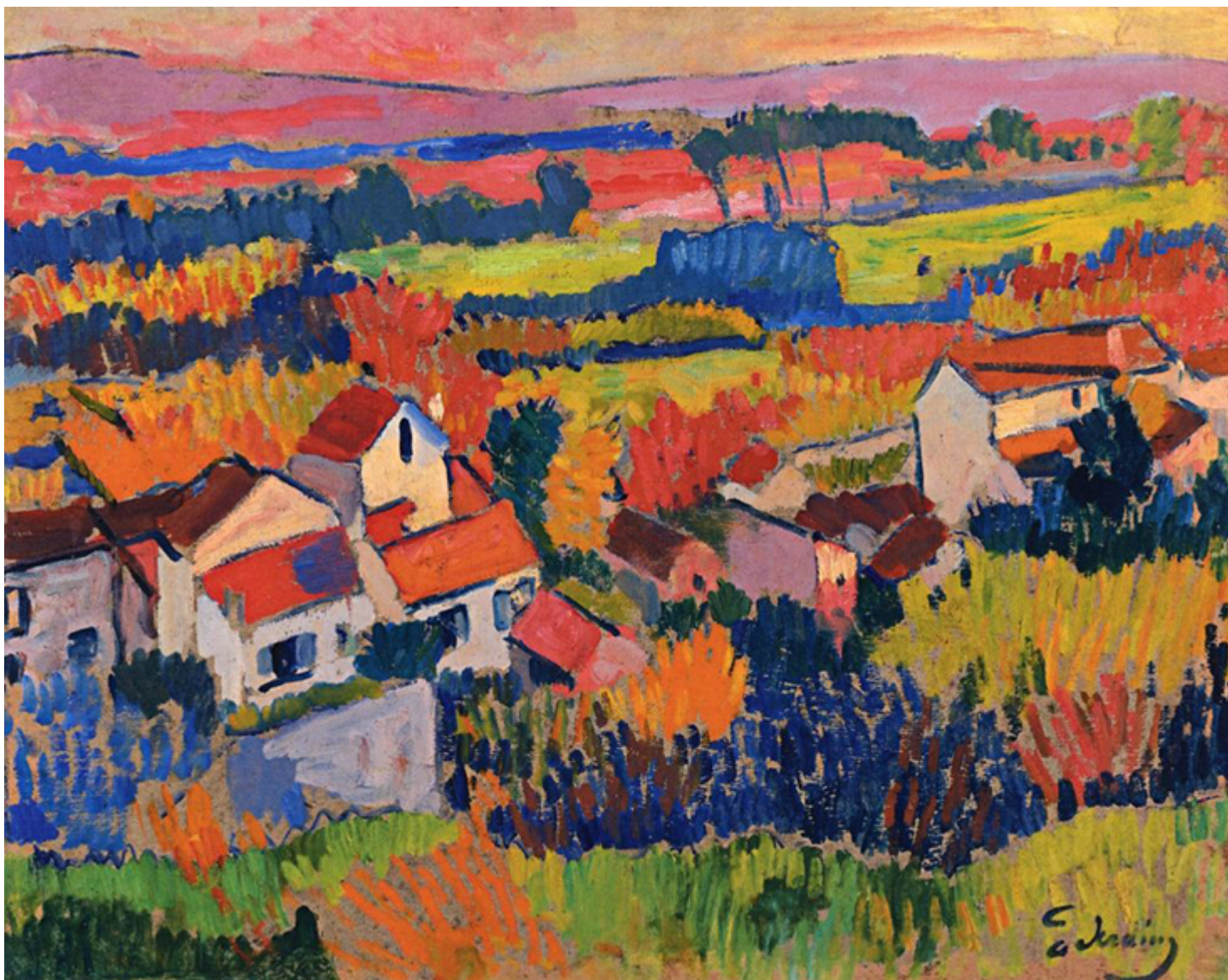
Landscape near Chatou / Andr  Derain / 1904-1905

wilderness, he wrote to his friend and fellow Fauve Maurice de Vlaminck, â believe that here is the only place where all one has are the sensations of a painter.â In The Bay of Martigues , 1908 hot sunlight falls onto the foreground and rooftops and nearly engulfs the entire canvas. Black silhouettes and electric blue water vibrate against zingy orange, making the whole canvas hum with the musical resonance of summer.