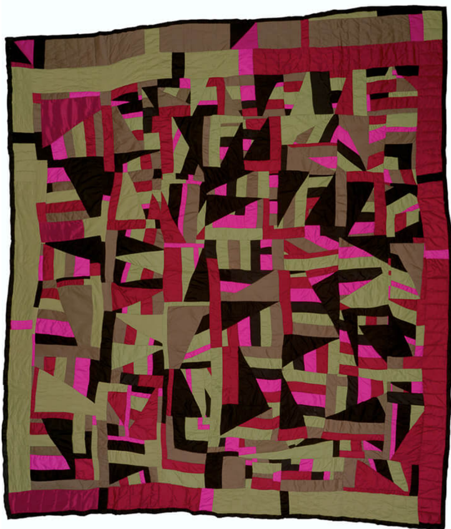
Broken Pieces / Marlene Bennett Jones / 2008 / Cotton and cotton/polyester