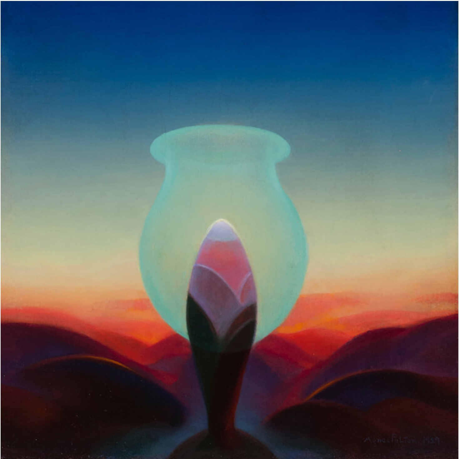
Star Gazer, 1929