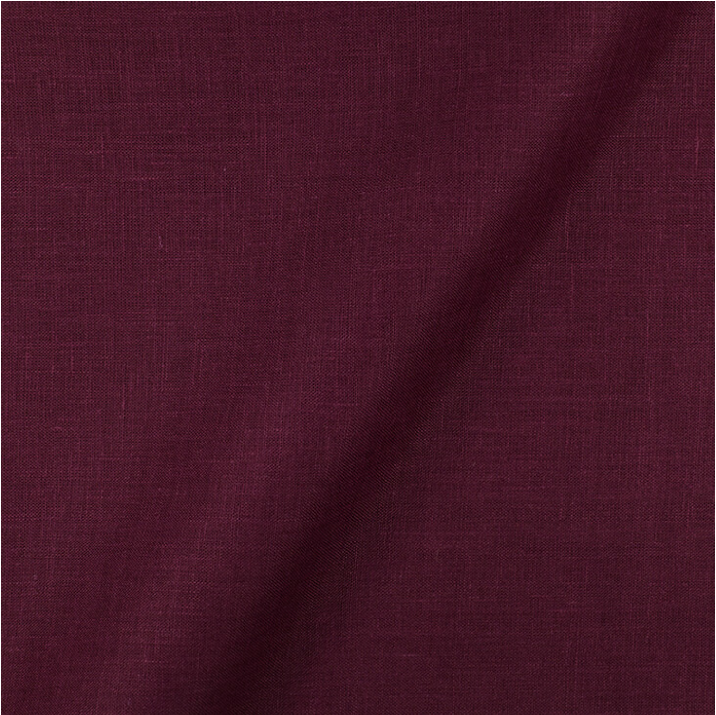
FS Grape Vine Midweight Linen

Pelton was born in Stuttgart, Germany to American parents in 1881. The family travelled through Basel and Switzerland, and later relocated to Brooklyn in 1888. Pelton's mother was a recluse, with a devout Christian faith, and this inward-looking aspect of her upbringing led Pelton to develop