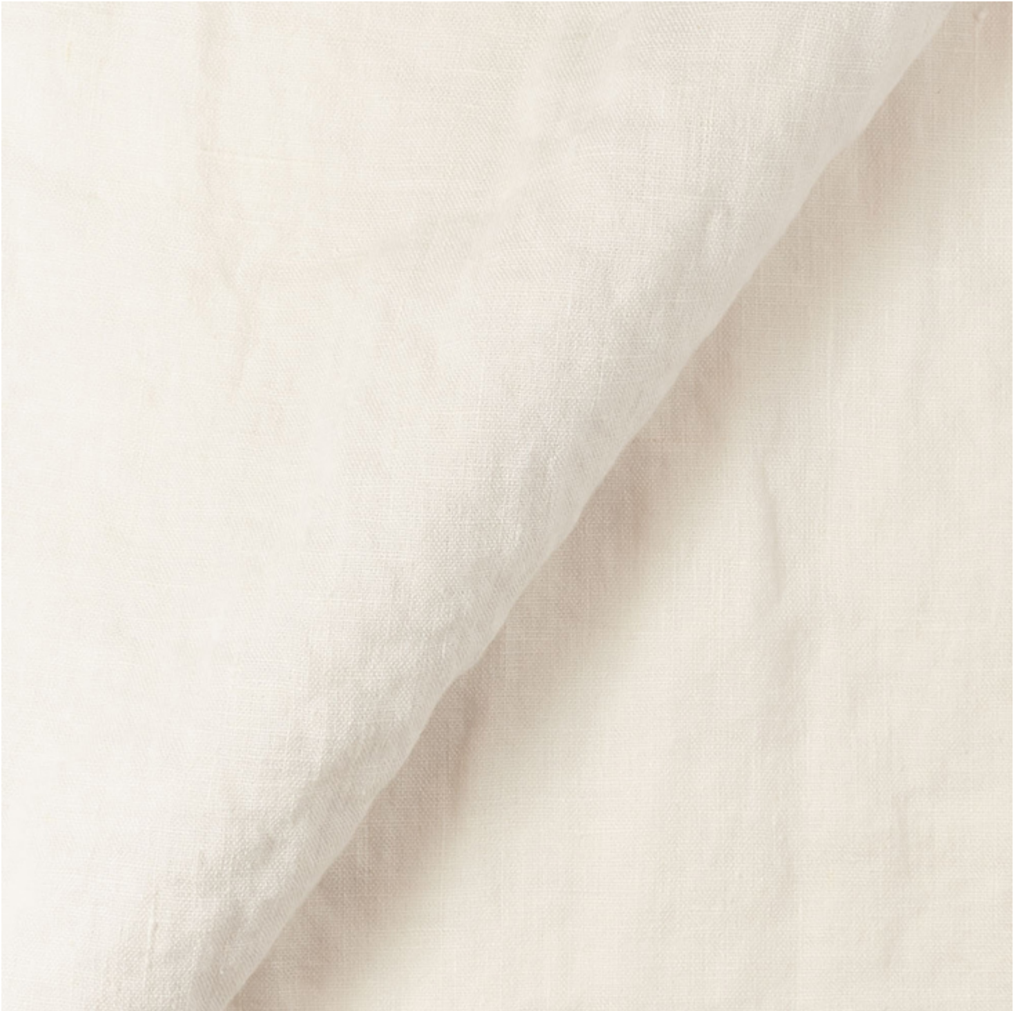
FS BLEACHED Midweight Linen

creativity, it's clear she contributed quite a lot to at least this society.