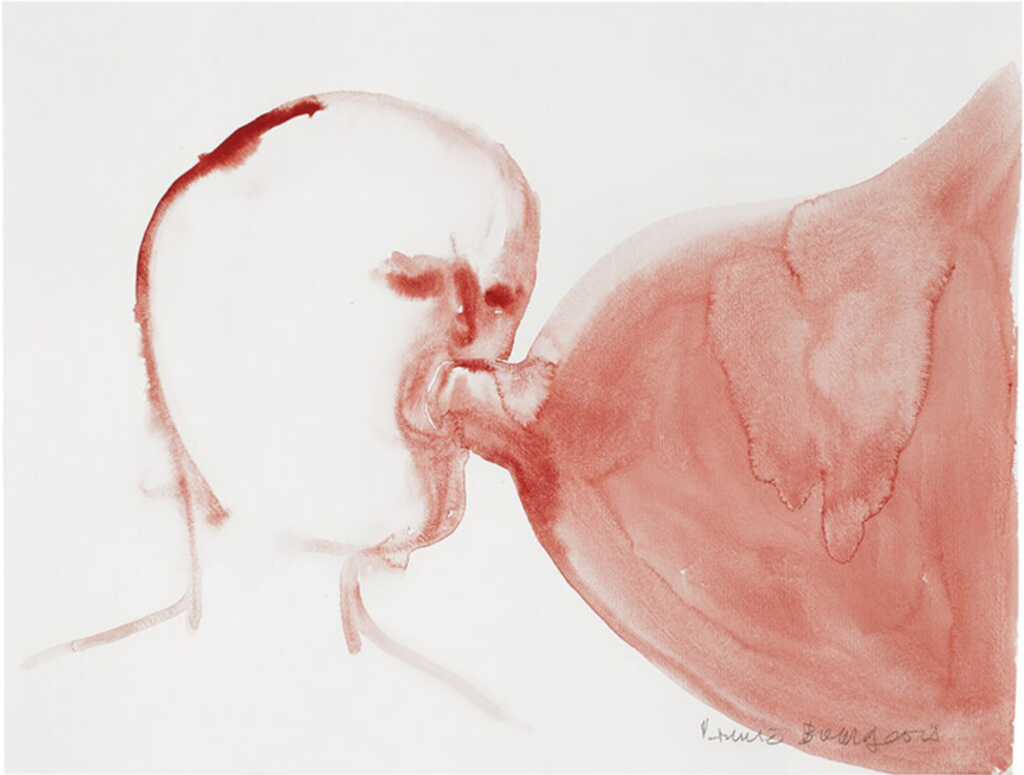
The Feeding, 2007