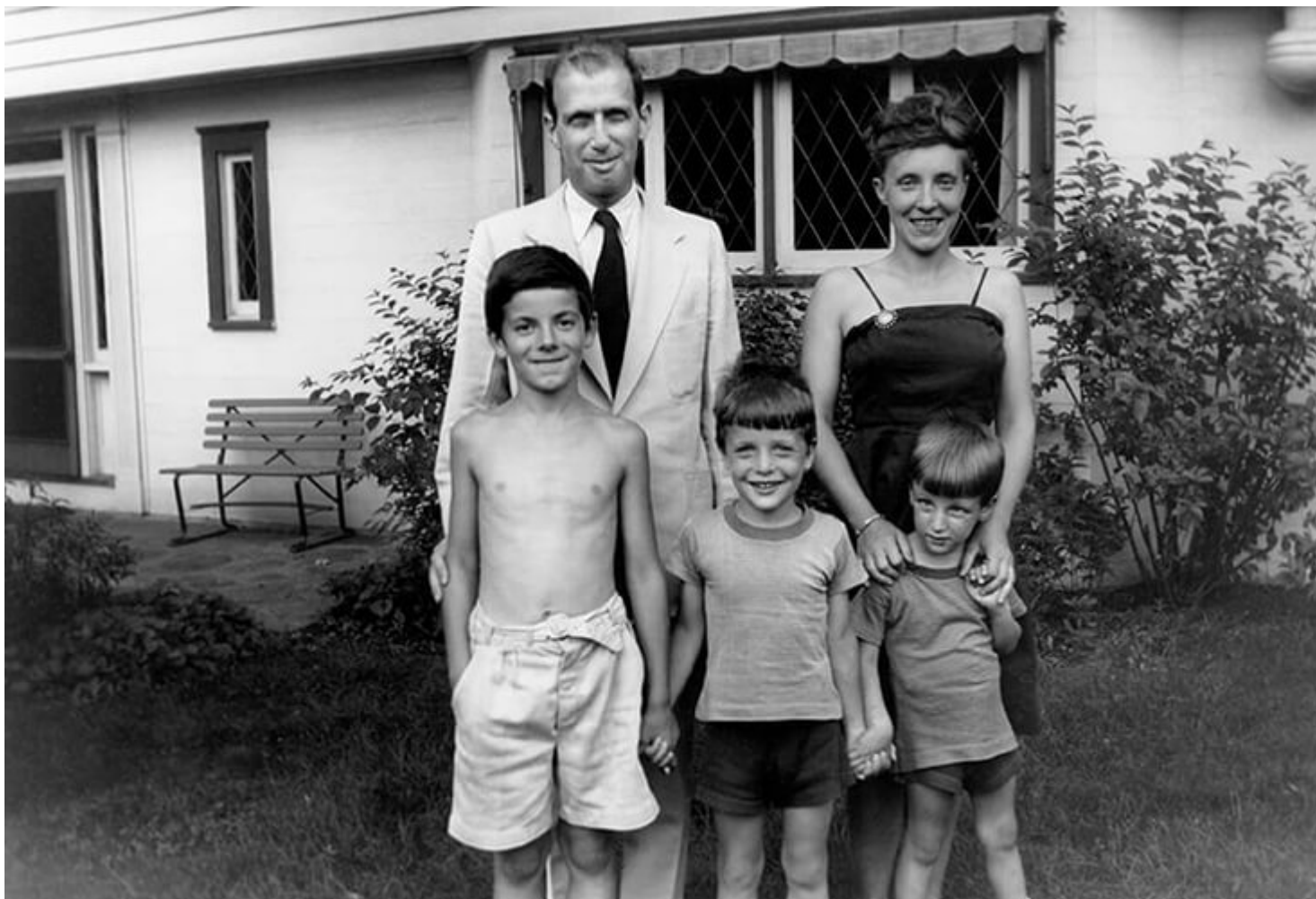
Louise Bourgeois with her husband and their three sons at the Prendergast house in Weston, CT, 1945

impact psychotherapy had on her, allowing her to release the traumas of her past in order to move more sinuously into being a nurturing mother. Art, too, was a healing device that gave Bourgeois room to express, or extinguish her innermost fears and desires.