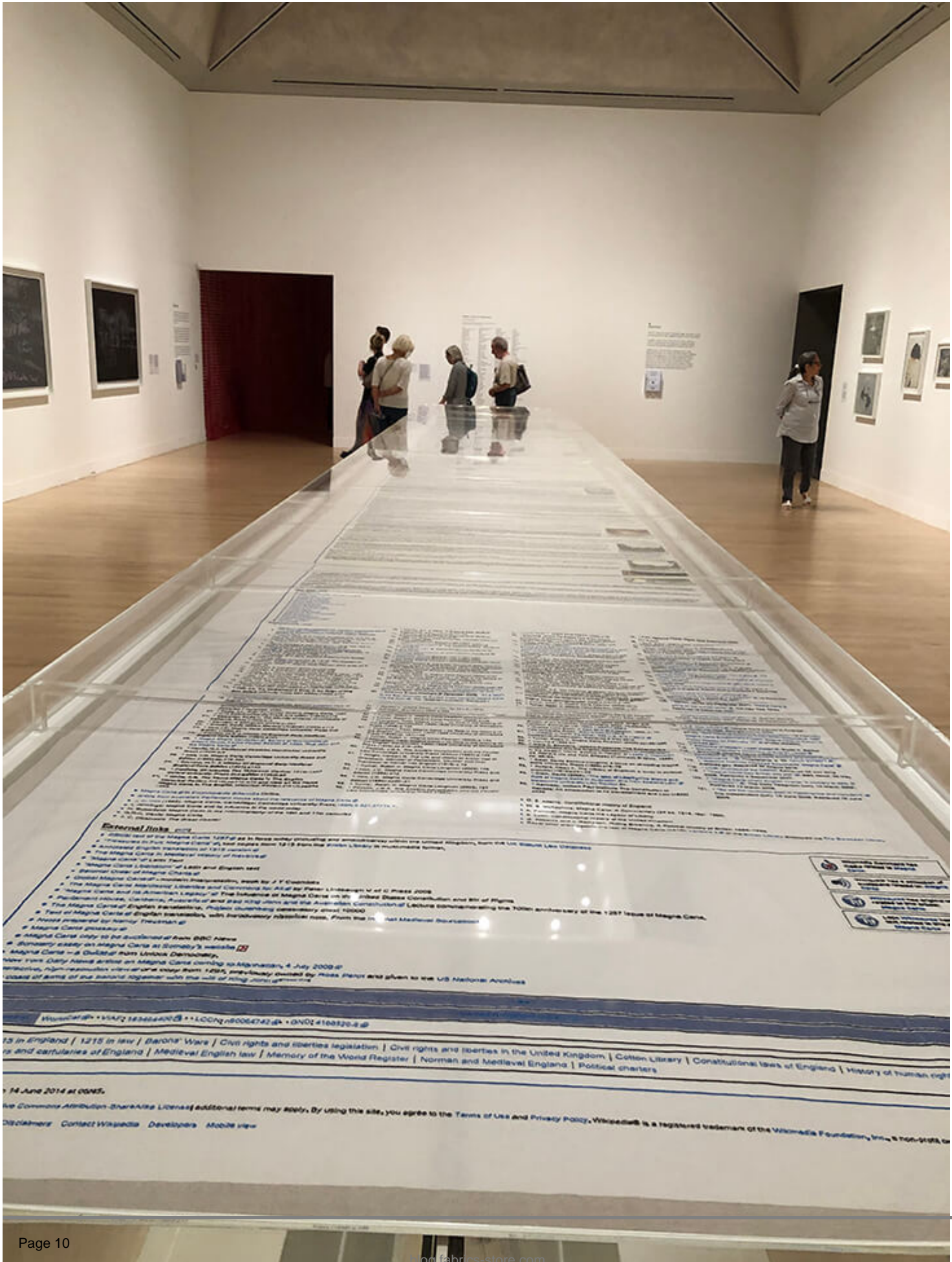
Cornelia Parker, Magna Carta (An Embroidery), exhibited at Tate Britain,