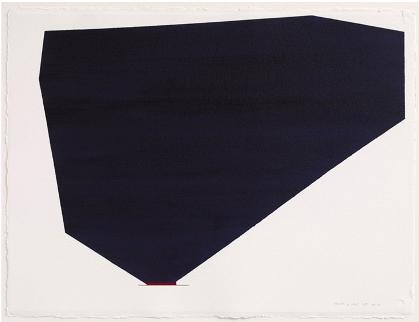
Anne Truitt, 6 Sept '87 No. 1 / Anne Truitt / 1987 / Acrylic on paper

Following her return to the United States the relief was almost palpable in her art, as colours became lighter and brighter, expressing the fresh, breezy light embedded in her inner psyche. Columns often rested on recessed plinths as if floating in the air, as seen in A Wall for Apricots , 1968, while oblique references to landscape were made through tonalities of light, space and colour, illustrated by Breeze , 1978. Writer John Dorsey observed, “If one could unwrap the colour and put it flat on the wall, the verticals and horizontals of landscape would become even more obvious.” Truitt also likened this three dimensional liberation of colour to the freedom she had found within herself, to express who she truly was, writing, “As I worked