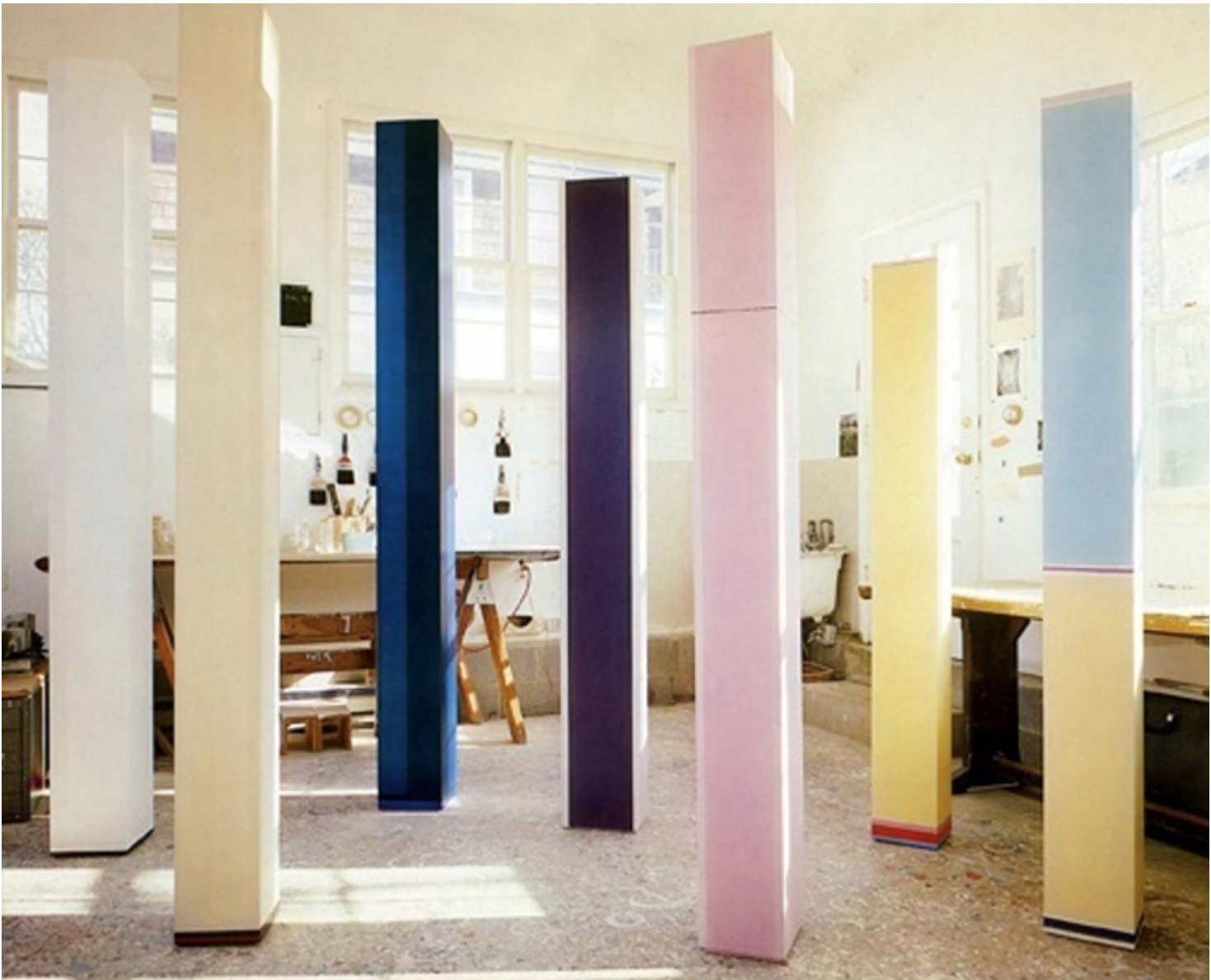
Anne Truitt Studio / 1980

two dimensional work in her later years, including vast beds of colour on canvas and smaller, more intimate works on paper. In 1984 she published Daybook , a sensitively observed, intimate journal chronicling the wrestle between motherhood and an artistic career, reflecting, "it's extremely difficult and you have to make sacrifices â€ You can't have it all. You can't. In a way, you can't have much of a personality or anything because everything has to go into your work."