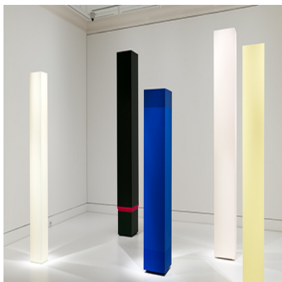
Anne Truitt: Inner Eye