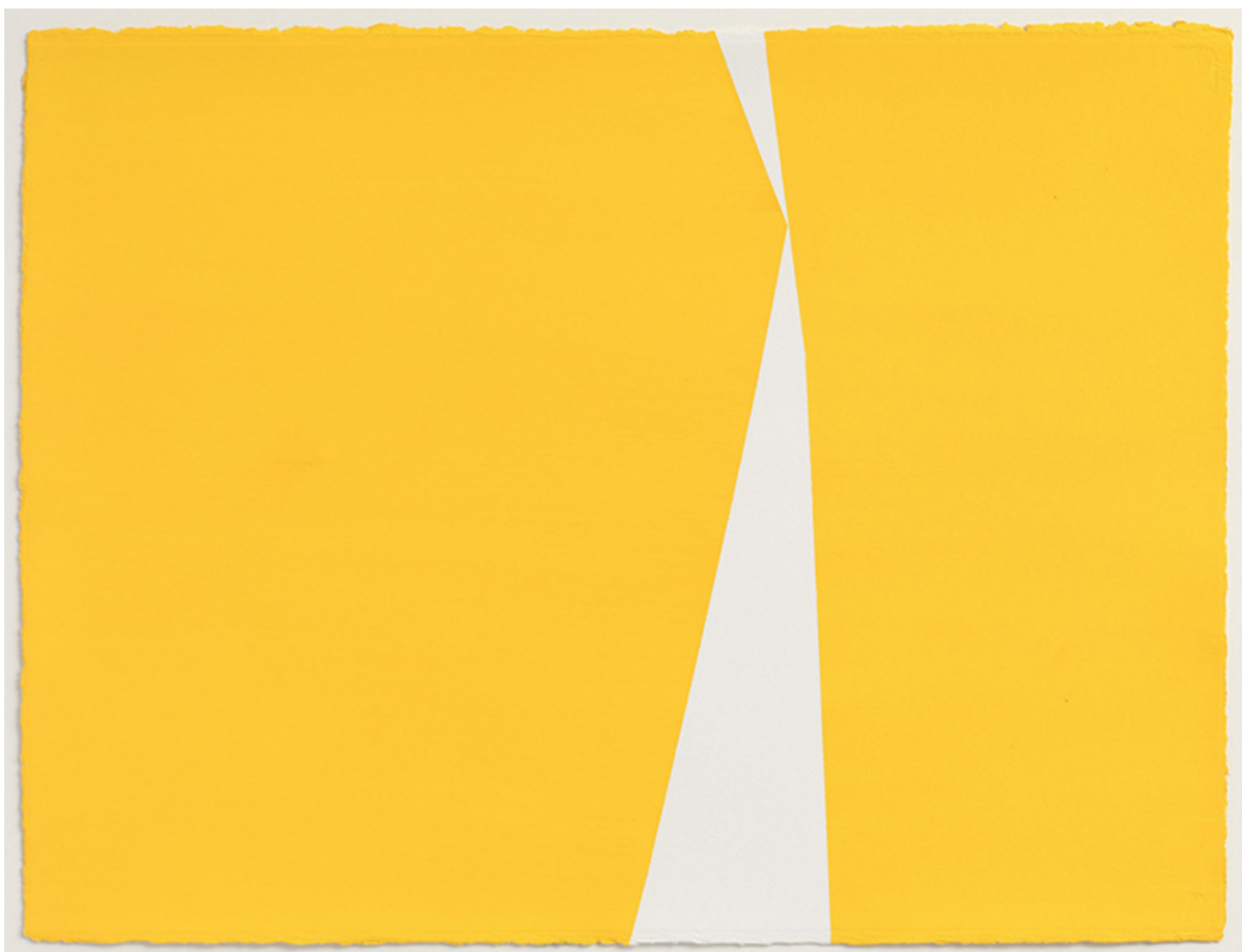
Truitt '91, 1991 / Anne Truitt / Acrylic on paper

along, making the sculptures as they appeared in my mind's eye, I slowly came to realise that what I was actually trying to do was to take paintings off the wall, to set colour free in three dimensions for its own sake. This was analogous to my feeling for the freedom of my own body and my own being, as if in some mysterious way I felt myself to be colour.â