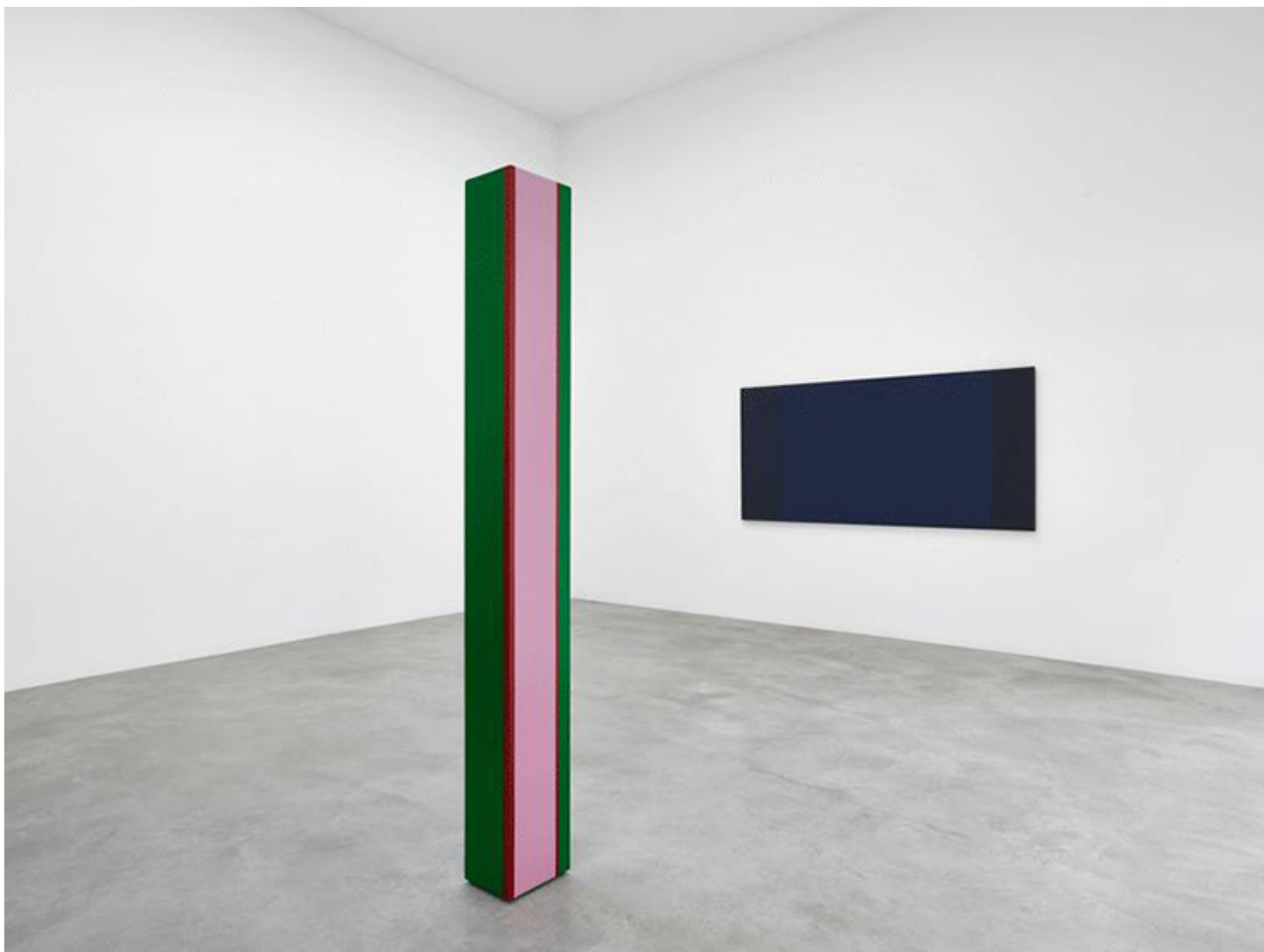
Threshold: Work from the 1970s / Anne Truitt

Teaching at the University of Maryland allowed Truitt to support her family and just about find traces of time to keep developing her art. She was a hugely popular professor, who brought multiple interests in psychology, art history and literature into her art classes, remaining there for the next two decades. In her inspirational lessons she taught others, “By keeping on being what we most intimately are, we can continually redefine ourselves so that we become what we have not been able to be. If we live this way, we surprise ourselves.”