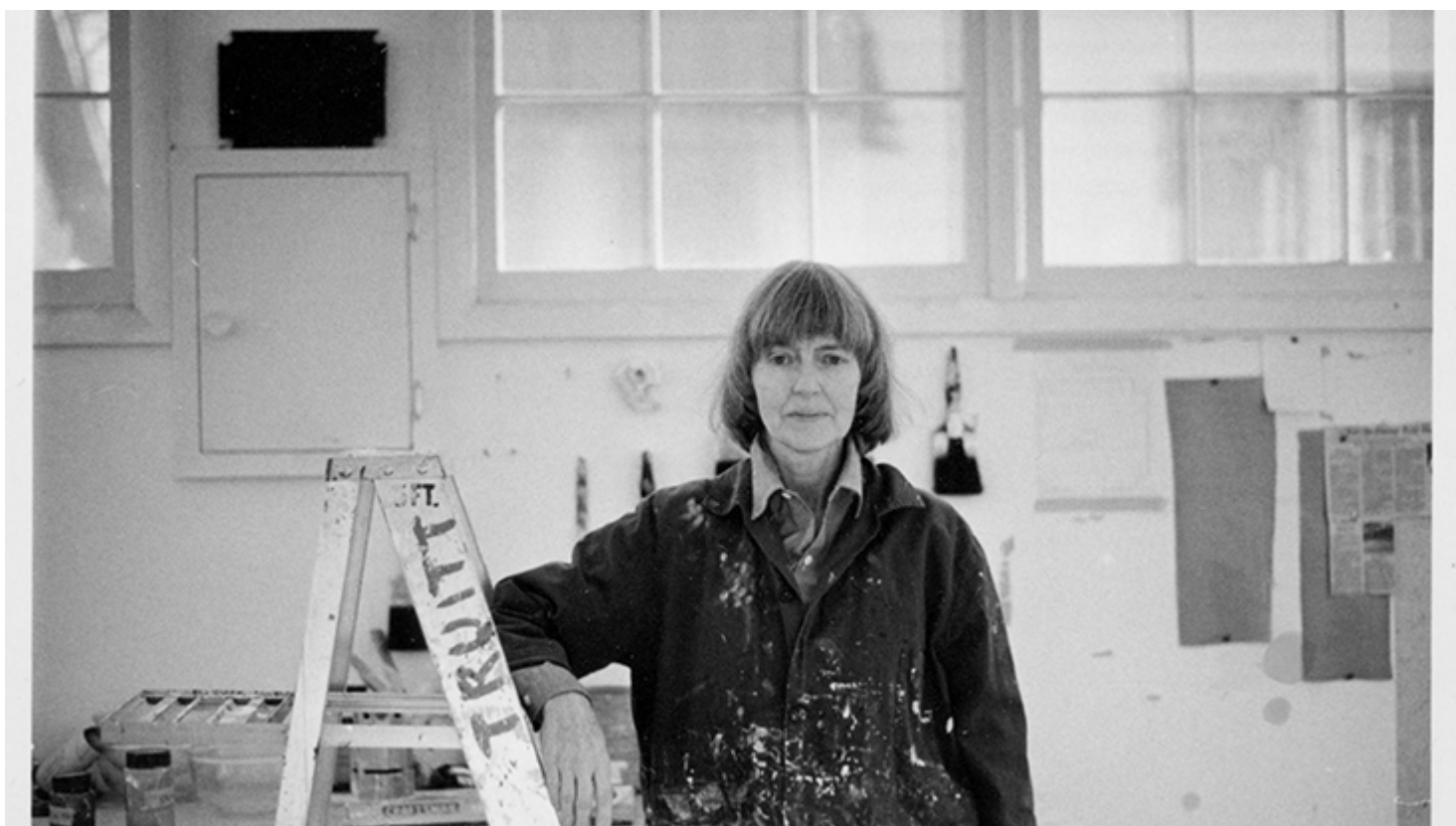
Anne Truitt / Washington DC / 1978