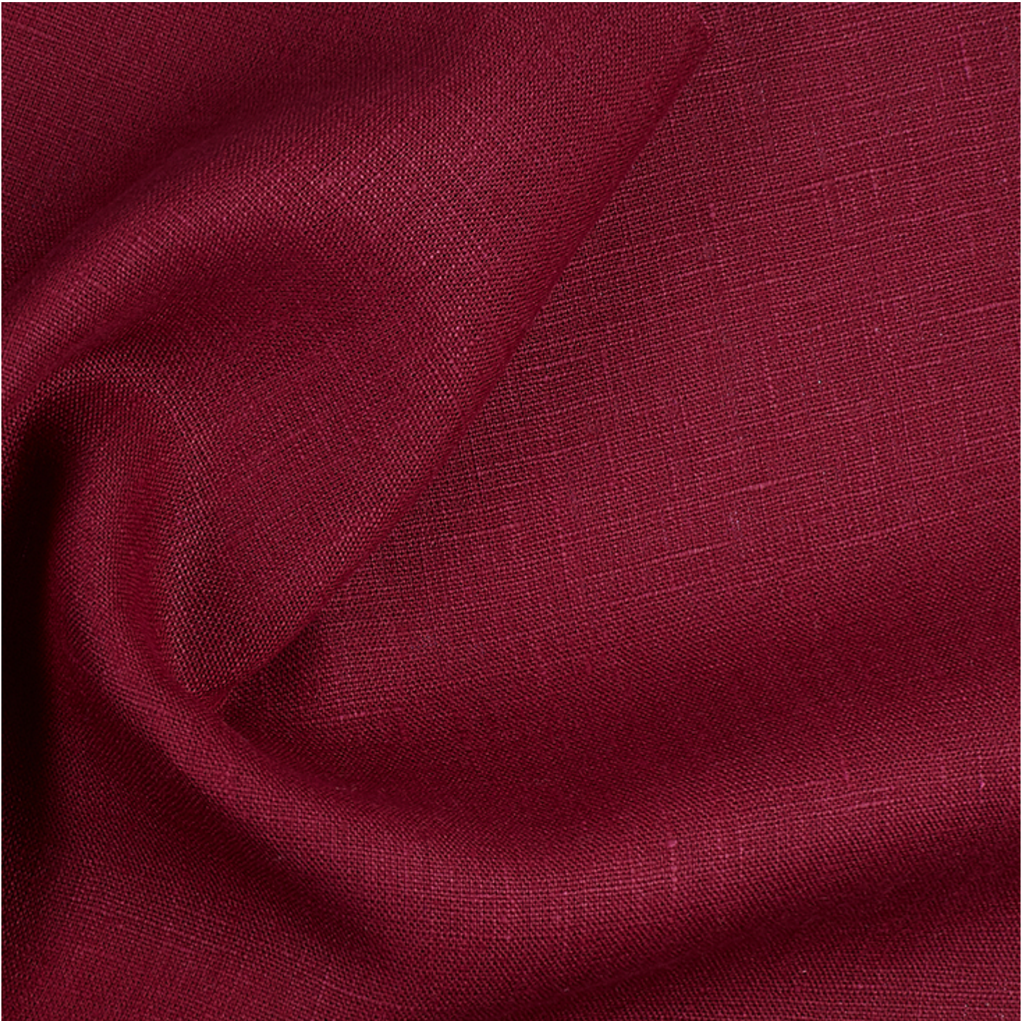
FS DULSE Softened 100% Linen

Born in 1954 in Mumbai, India, Kapoor left his hometown to hitchhike across Europe as a teenager, before deciding to study art at Hornsey College of Art in 1973. Initially focussing on performance art, Kapoor expanded into sculpture as he took on postgraduate studies at Chelsea School of Art.