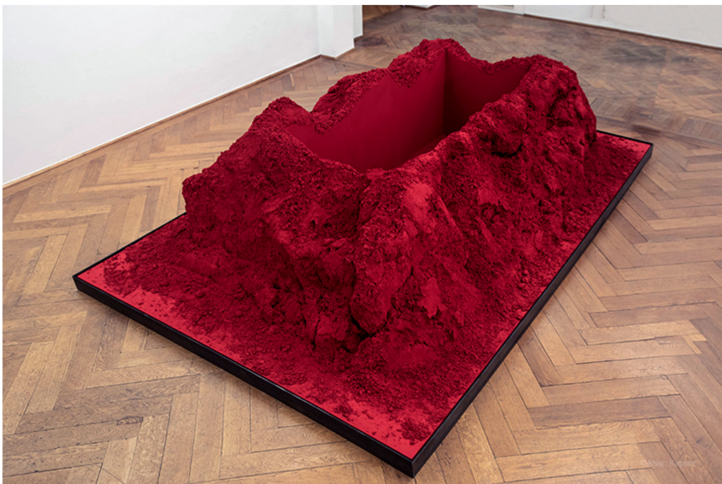
Monochrome Grave Red / Anish Kapoor / 2018

Following a period of uncertainty Kapoor returned to India, where he realised the impact Indian society had inadvertently had on his practice, writing, "I suddenly realised all these things I had been making at art school and in my studio had a relationship to what I saw in India. It was a certain attitude to the object. I was making objects that were about doing, about ritual."