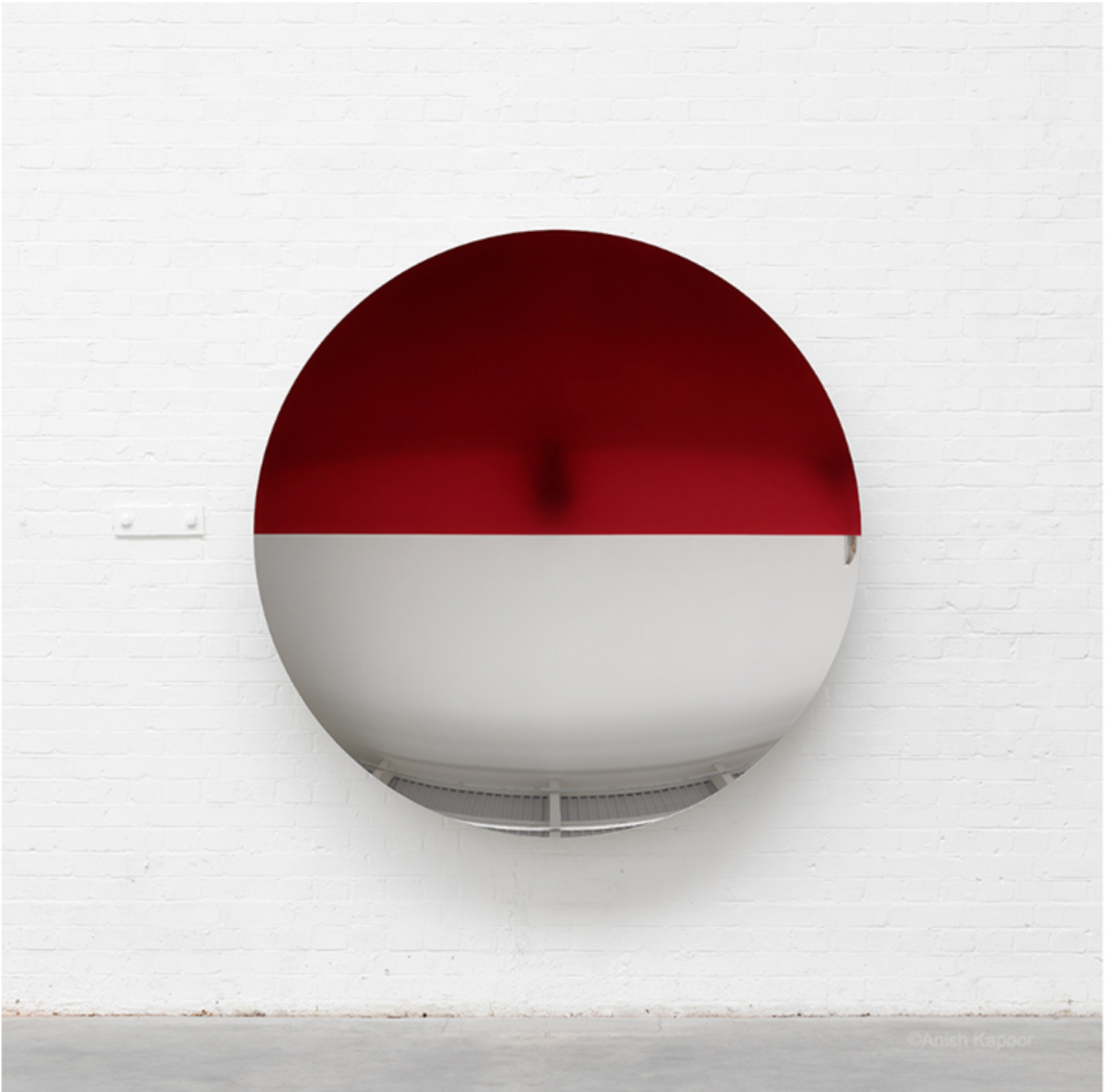
Horizon Red / Anish Kapoor / 2016

Deep, dark and indulgent, DULSE linen's blackberry stained hue can invoke both the theatrical grandeur of royalty and the hidden depths of primordial desire. The colour has great significance for British sculptor Anish Kapoor, whose deliciously sensuous sculptures tap in to red's cultural