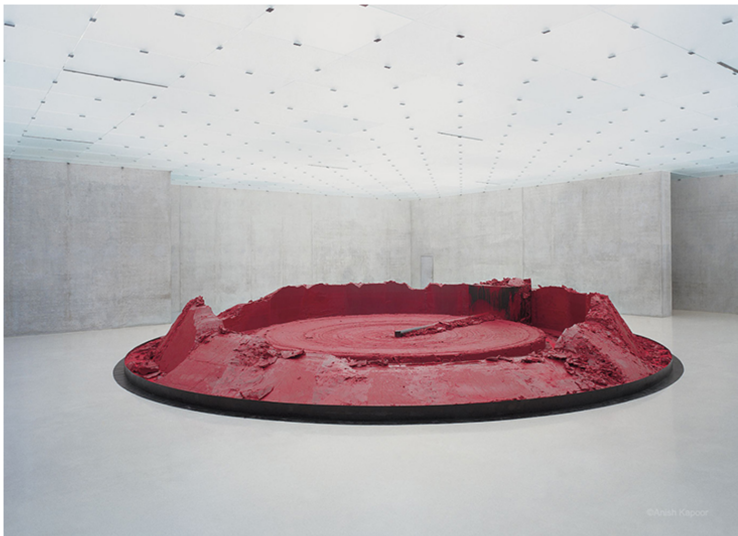
My Red Homeland / Anish Kapoor / 2003

implications of societal violence and the close, primitive process of giving birth at the root of human survival, as Kapoor puts it, "it is the colour of the interior of our bodies. Red is the centre."