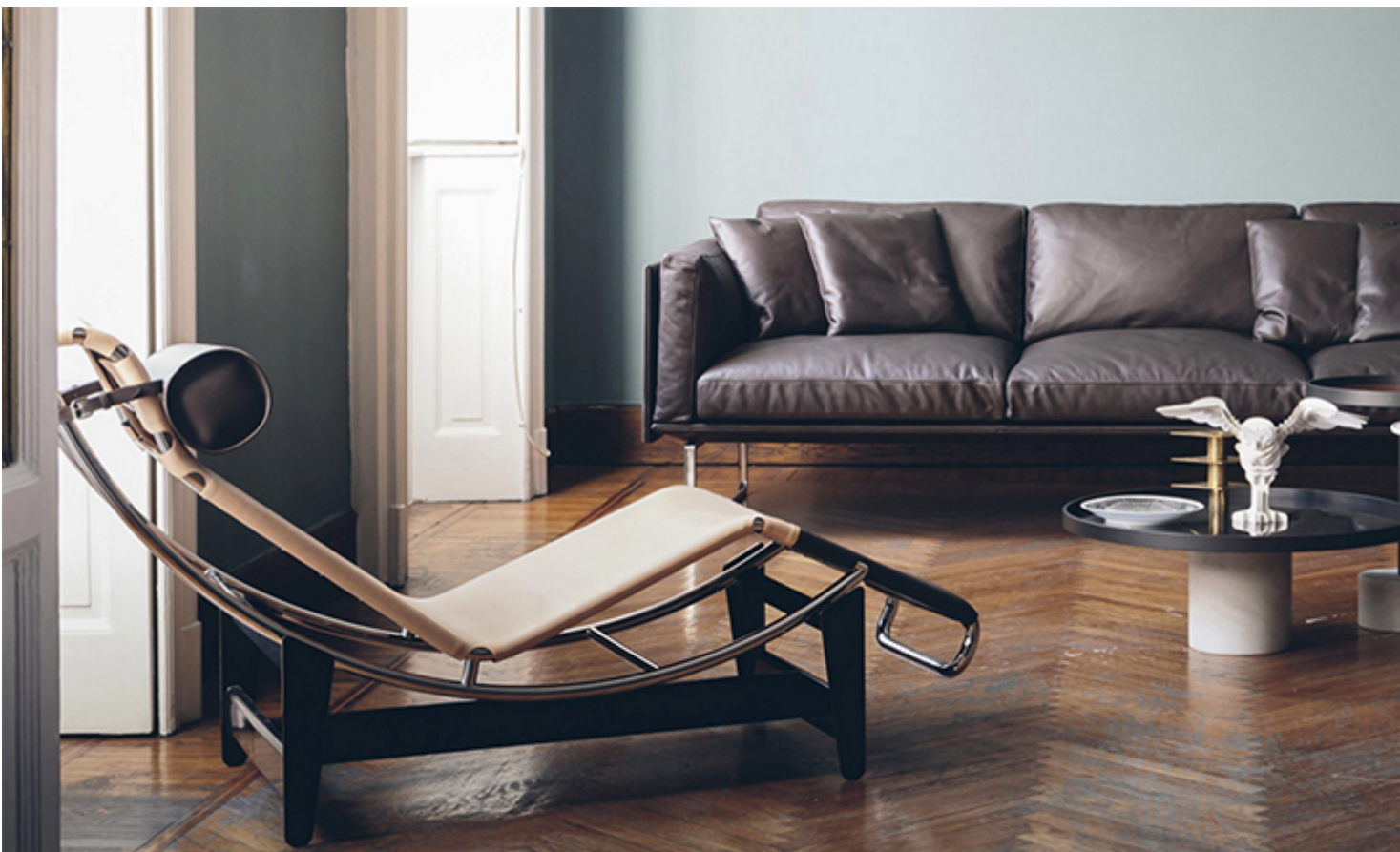
LC 4 Chaise Lounge

In his work, Vers une architecture (Toward an Architecture) he concluded, “A house is a machine for living in,” a concise commentary of his design perspective. He believed each structure should include five specific elements. Villa Savoye is perhaps the pinnacle of resistance in fully endorsing his five points of architecture: an elevated structure supported by pilotis, or columns, usually constructed in concrete, an open floor plan, non-support walls, or free facade, which allows unlimited choice for wall placement, ribbon windows offering natural light and expansive views, and a roof terrace or garden for domestic use. Le Corbusier also ventured into furniture design with his cousin Pierre Jeanneret and Charlotte Perriand, creating the LC Collection using chrome tubing, leather and fabric in shapes that mirrored human form.