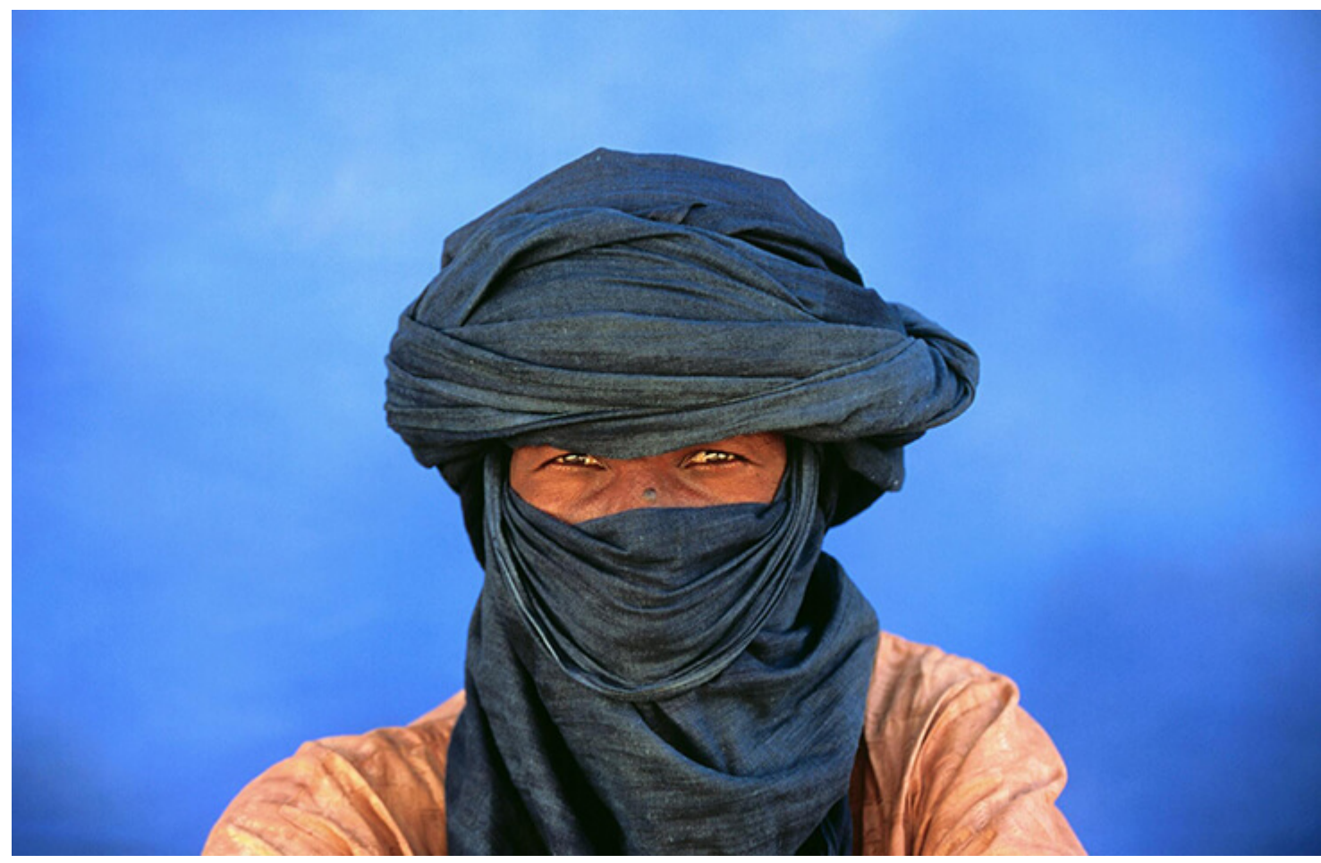
Tuareg men are sometimes referred to as "blue men" as the vibrant indigo dye of their head wraps stains their skin with a blue hue.

dyeing. Women were particularly skilled at producing richly crafted, beautifully made indigo cloths and garments, which were not only a valuable form of currency and status, but deeply embedded with spiritual symbolism, an ethos that still persists in many West African cultures.