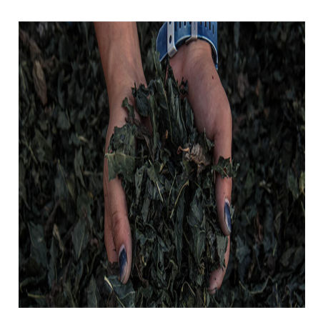
Indigo: Blue Gold