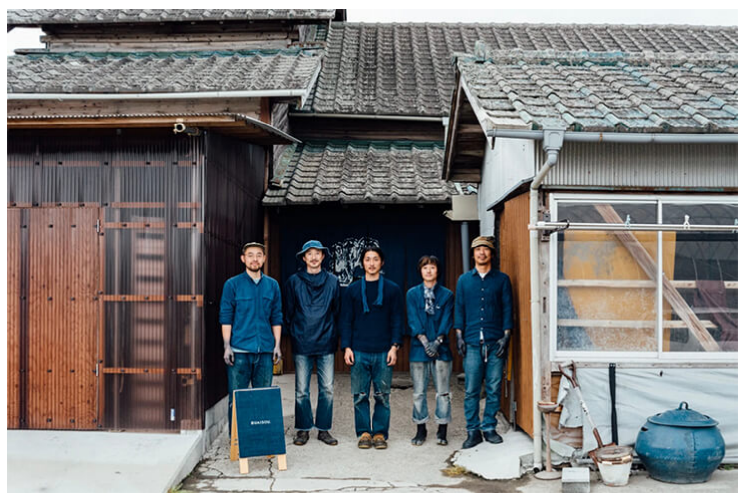
The five members of the BUAISOU collective use traditional methods to create their indigo-dyed artisanal wares in Japan

Indigoâs mysterious dark beauty and the challenging processes required to make it usable even led many to call the colour âblue gold.â But as a result, Indiaâs indigo trade became brutal and bloody, as workers were exploited, abused and overworked. As a cheaper alternative, Europe produced woad dye from the more commonly available knotweed, or Isatis tinctoria, but it was less vibrant and steadfast than the Indian variants. In a bid to protect their woad indigo, French and Norwegian officials even banned the importation of Indian indigo into their markets.