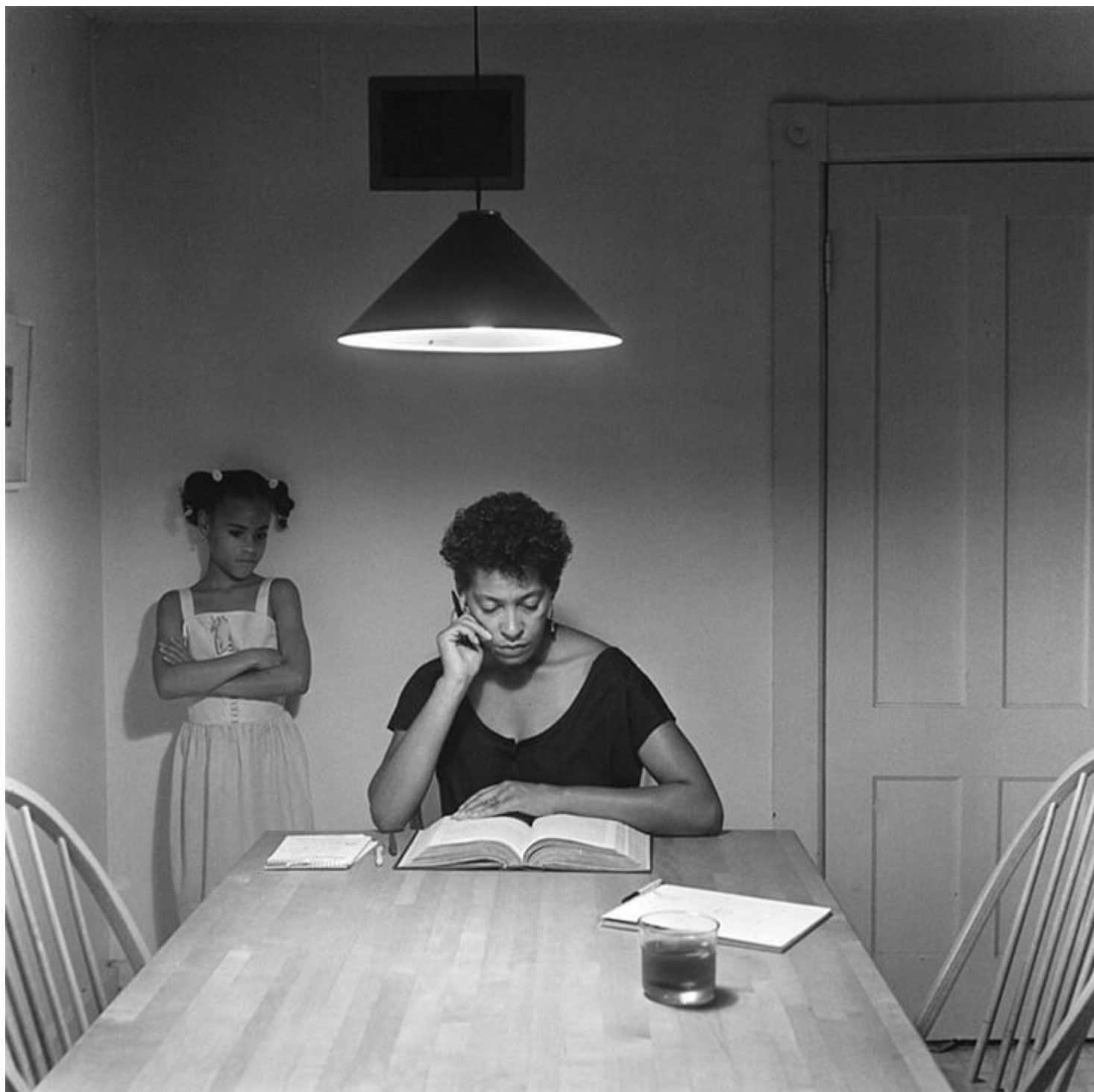
Carrie Mae Weems, Untitled (from the Kitchen Table Series) , 1990

One of the most celebrated images in Weems' Kitchen Table series is Untitled (Woman and daughter with makeup) (from Kitchen Table Series) , 1990, which shows how a young girl learns the traits and masquerades of womanhood by miming the behaviour of her mother. On the one hand,