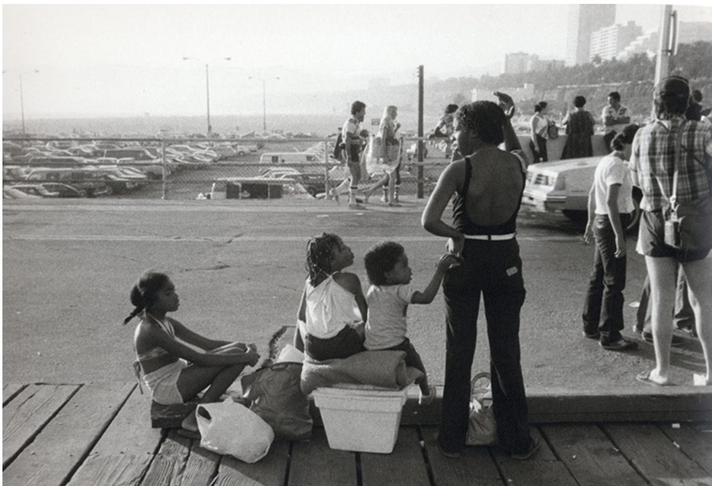
Carrie Mae Weems, Mother with Children, from Boardwalk, Santa Monica, 1980–82

Carrie Mae Weems is one of the most radical photographers to emerge out of contemporary America. In her deeply emotive imagery, she examines how our social relationships define who we are, and give us a sense of belonging in an increasingly uncertain world. Perhaps it's no surprise then, that Weems became a mother at a young age, and relied heavily on her family to help her raise her daughter while pursuing a career as an artist. These challenges and the intimacy of her family relationships are writ large over much of her photographic work, from her early years as a documentary image maker, to her more recent conceptual ponderings. She describes her imagery as, "the battle around the family...monogamy...and between the sexes."