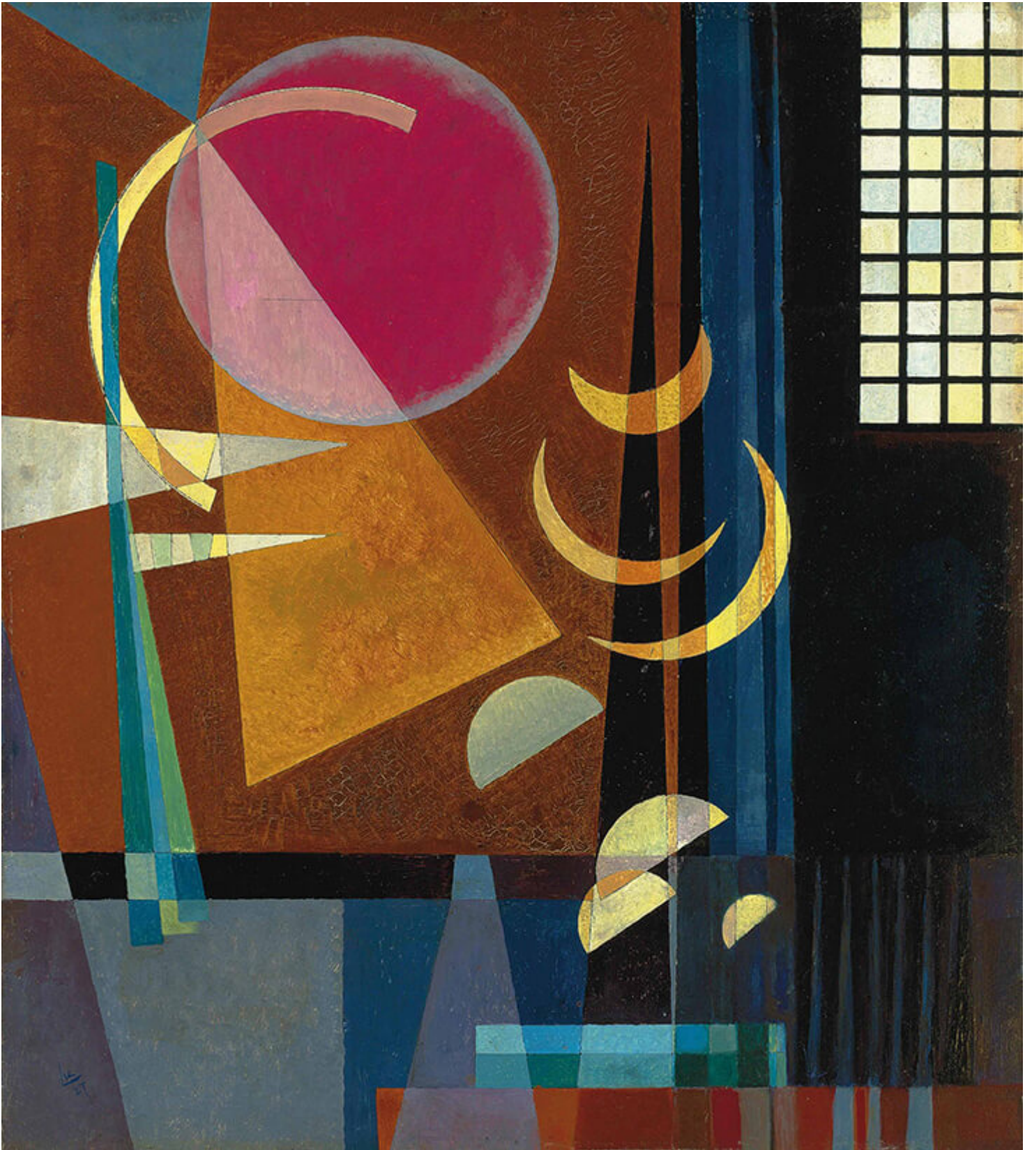
Wassily Kandinsky, Scharf-Ruhig, 1927, made during the peak of the artist's