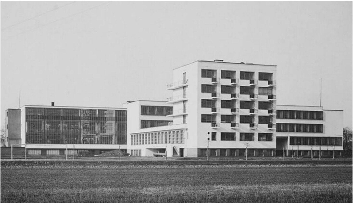
The Bauhaus campus in Dessau, designed by Walter Gropius

In 1925, the Bauhaus moved from Weimar to Dessau, where Gropius had designed a new premises. The building he created was the ultimate showpiece for the Bauhaus style, featuring a geometric, modernist style throughout the exterior and interior. When Gropius stepped down from the leadership role at the Bauhaus in 1928, the institution had already begun to change, with a greater emphasis on taking art into industry, and the production of useful objects that could play a role in the lives of ordinary people. His successor was the architect Hannes Meyer, later followed by the architect Mies van der Rohe in 1930. By the early 1930s, the Bauhaus's emphasis on intellectual freedom and experimentation was under threat from Germany's rising Nazi party, and sadly, the school was forced to close in 1933.