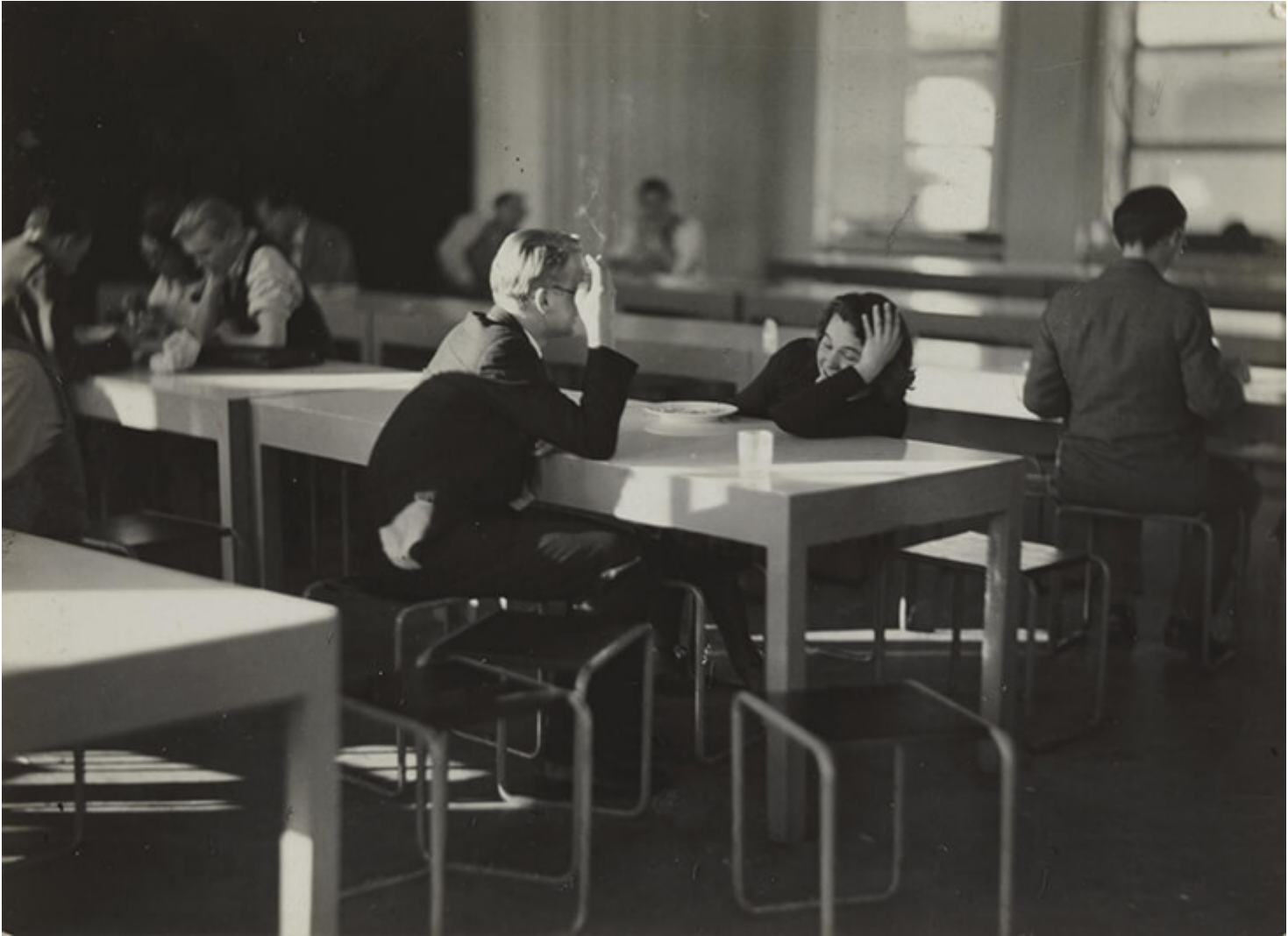
Cafeteria After Lunch, Bauhaus, Dessau, 1932

This was far from the end for the visionaries who had pioneered the Bauhaus. Many emigrated to the United States, bringing with them their most radical ideas. Josef and Anni Albers became founding teachers at the innovative Black Mountain College in North Carolina , and Josef later went on to teach at Yale University. Meanwhile, both Breuer and Gropius secured teaching posts at Harvard. Moholy-Nagy founded the eccentric New Bauhaus in Chicago in 1937, which was later absorbed into the Illinois Institute of Technology, where Mies van der Rohe was both a teacher and site designer. Being allowed to continue their ground-breaking work around modernist design aesthetics in the United States meant the legacy of the Bauhaus lived on, shaping the nature of design across Europe and the US. The school's radical teaching style had a particularly profound impact on the