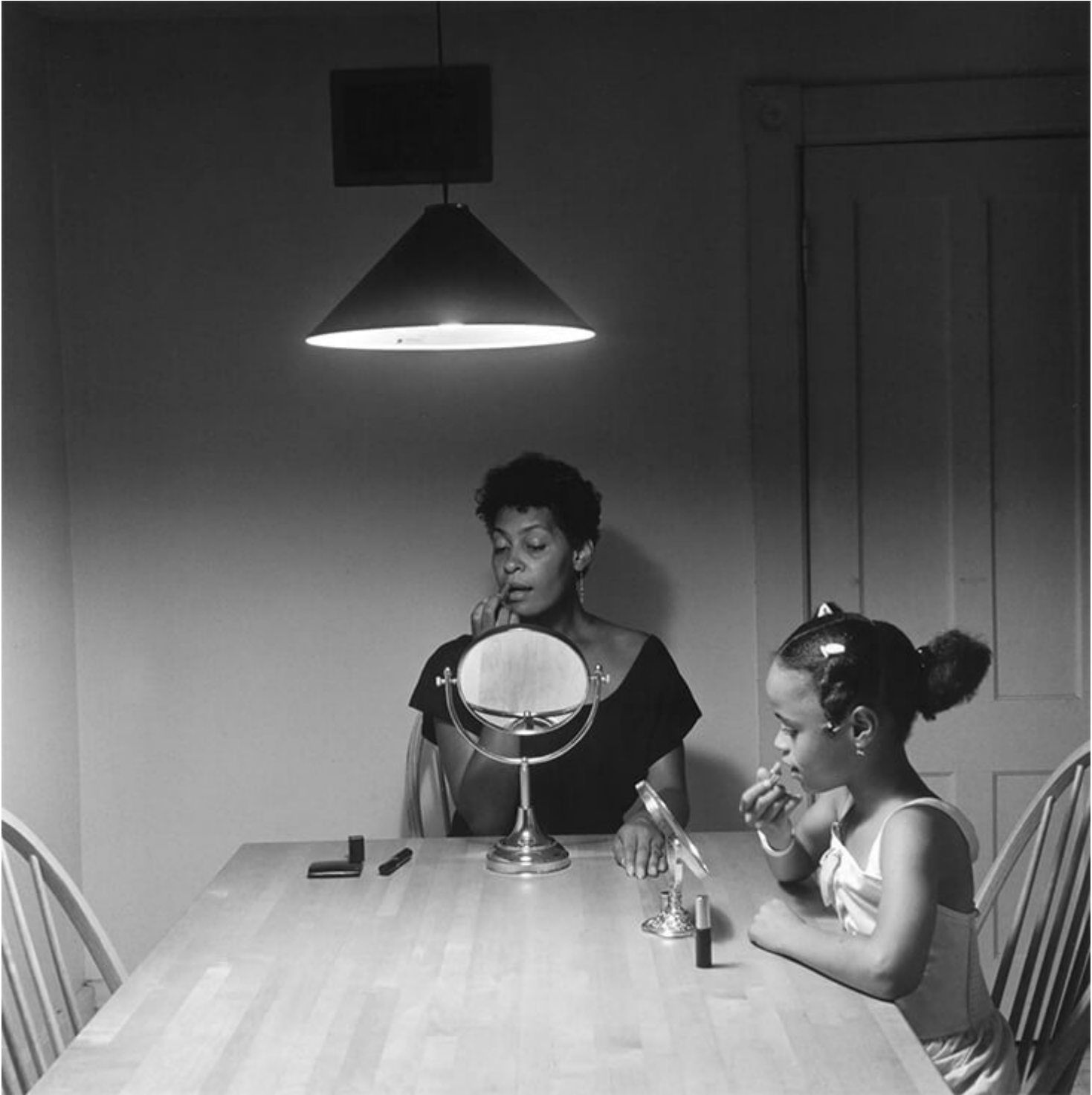
Carrie Mae Weems, Untitled (Woman and daughter with makeup) (from Kitchen Table Series ), 1990

It was when Weems' daughter was older that she found greater stability and direction, earning a degree from the California Institute of Arts in 1981, and