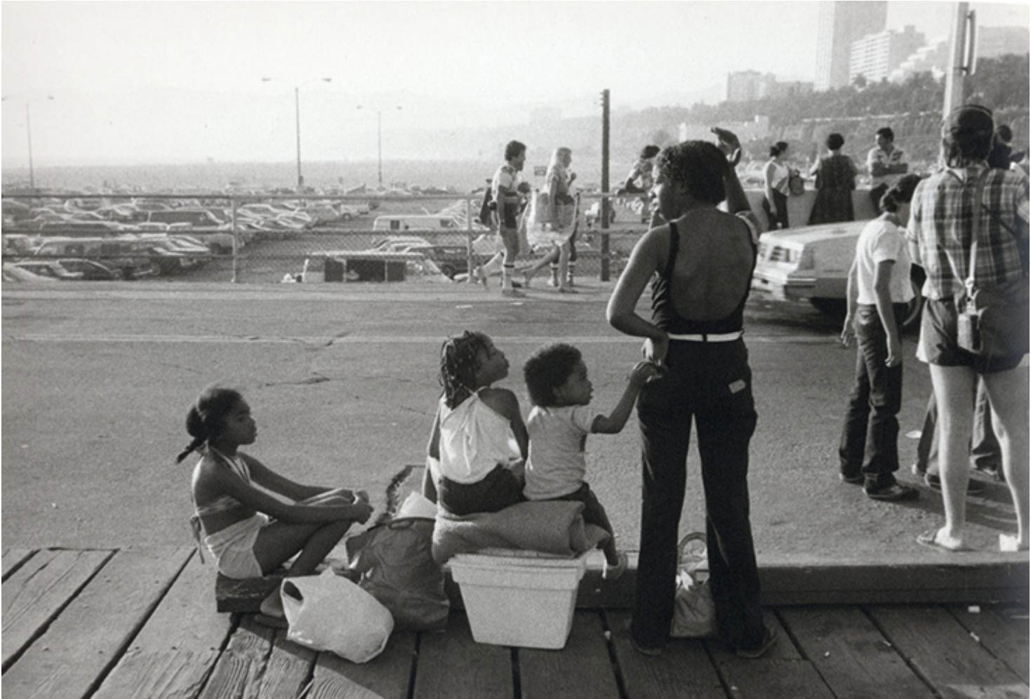
Carrie Mae Weems, Mother with Children, from Boardwalk, Santa Monica, 1980–82

Carrie Mae Weems is one of the most radical photographers to emerge out of contemporary America. In her deeply emotive imagery, she examines how our social relationships define who we are, and give us a sense of belonging in an increasingly uncertain world. Perhaps it's no surprise then, that Weems became a mother at a young age, and relied heavily on her family to help her raise her daughter while pursuing a career as an artist. These challenges and the intimacy of her family relationships are writ large over much of her photographic work, from her early years as a documentary image maker, to her more recent conceptual ponderings. She describes her imagery as, "the battle around the family...monogamy...and between the sexes."