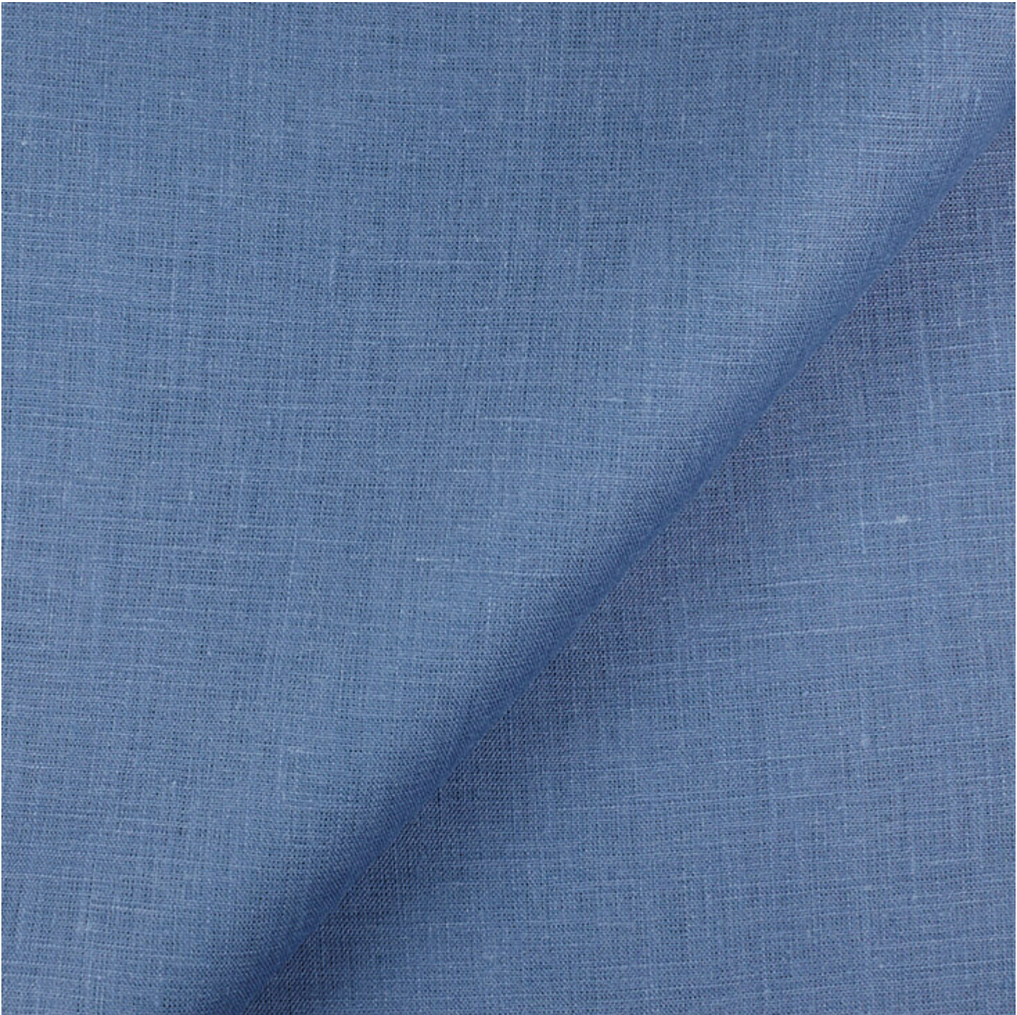
FS CORONET BLUE Midweight Linen

Kokoschka was born in 1886 in the town of Pöchlarn, Austria. When he was just three years old his family relocated to Vienna, where he remained for the rest of his childhood. He showed artistic promise from an early age and at the age of 18, he earned a scholarship to study at the School of Arts