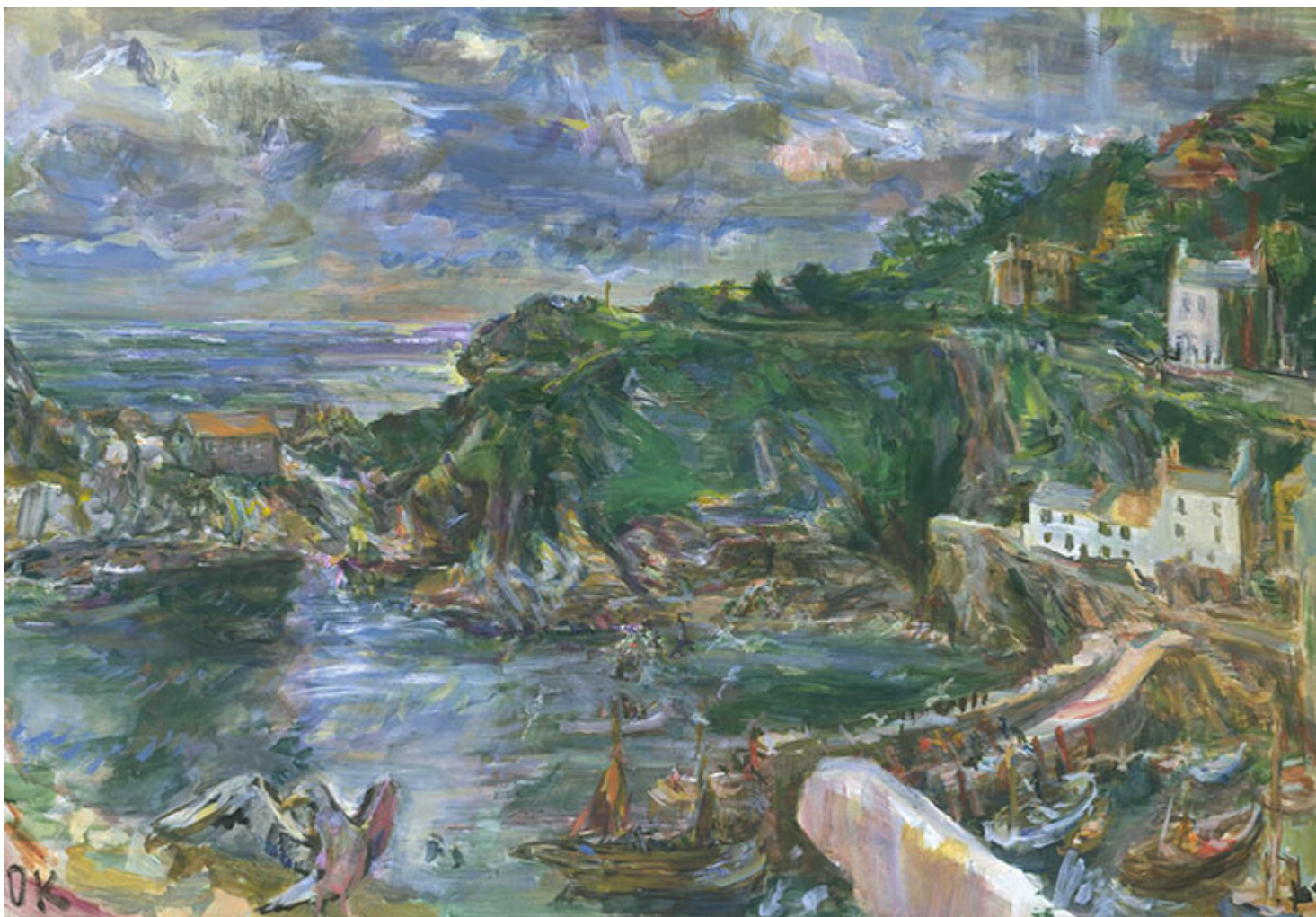
Polperro II, 1939

In the years that followed Kokoschka was increasingly drawn into Austrian artistic circles, and he moved towards painting portraits and landscapes with a free, expressive style. Although his subjects were based on the real world, Kokoschka felt a strong desire to express the turbulent emotions he felt inside in response to his subjects, and his way of doing this was with free brushstrokes and intense colour. In the wide-open scene Istanbul I , 1930, Kokoschka looks down on the city's harbour from above, allowing him to take in the breath-taking scene as it unfurls outwards before him. Vivid blue sky is awash with his trademark heather blue, a colour reflected like a mirror in the sparkingly bright water below.