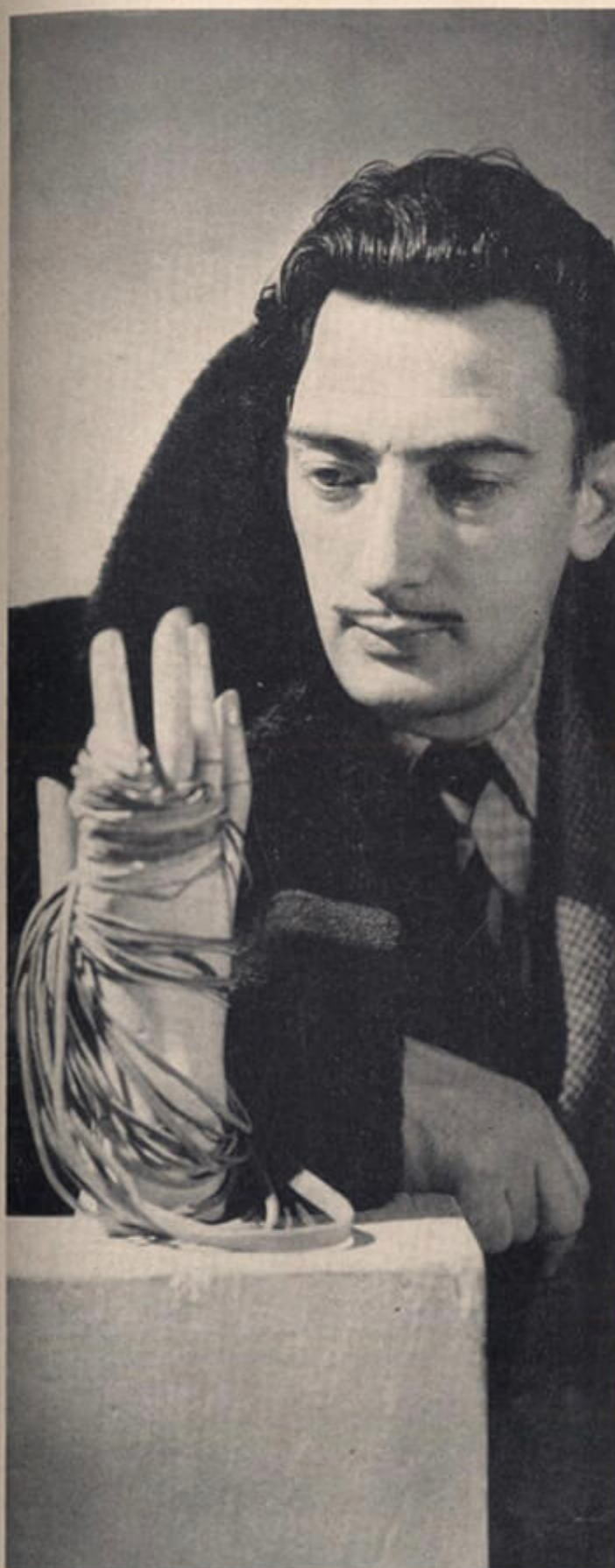
SALVADOR DALÍ, famous surrealist painter and designer, who created the exciting sets for Wagner Massine "Bacchanale" two seasons ago, has this year contributed the libretto, sets and costumes for the new ballet "Labyrinth" with choreography by Massine to Schubert's Seventh ("Heavenly Length") Symphony.