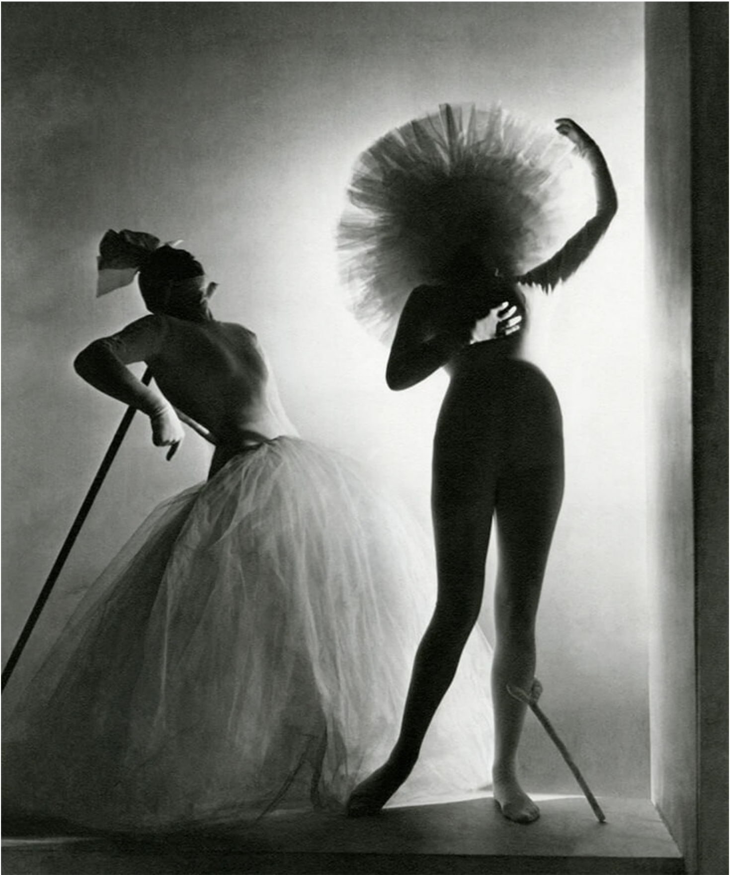
Dancers in costumes designed by Salvador Dali for the Ballets Russes