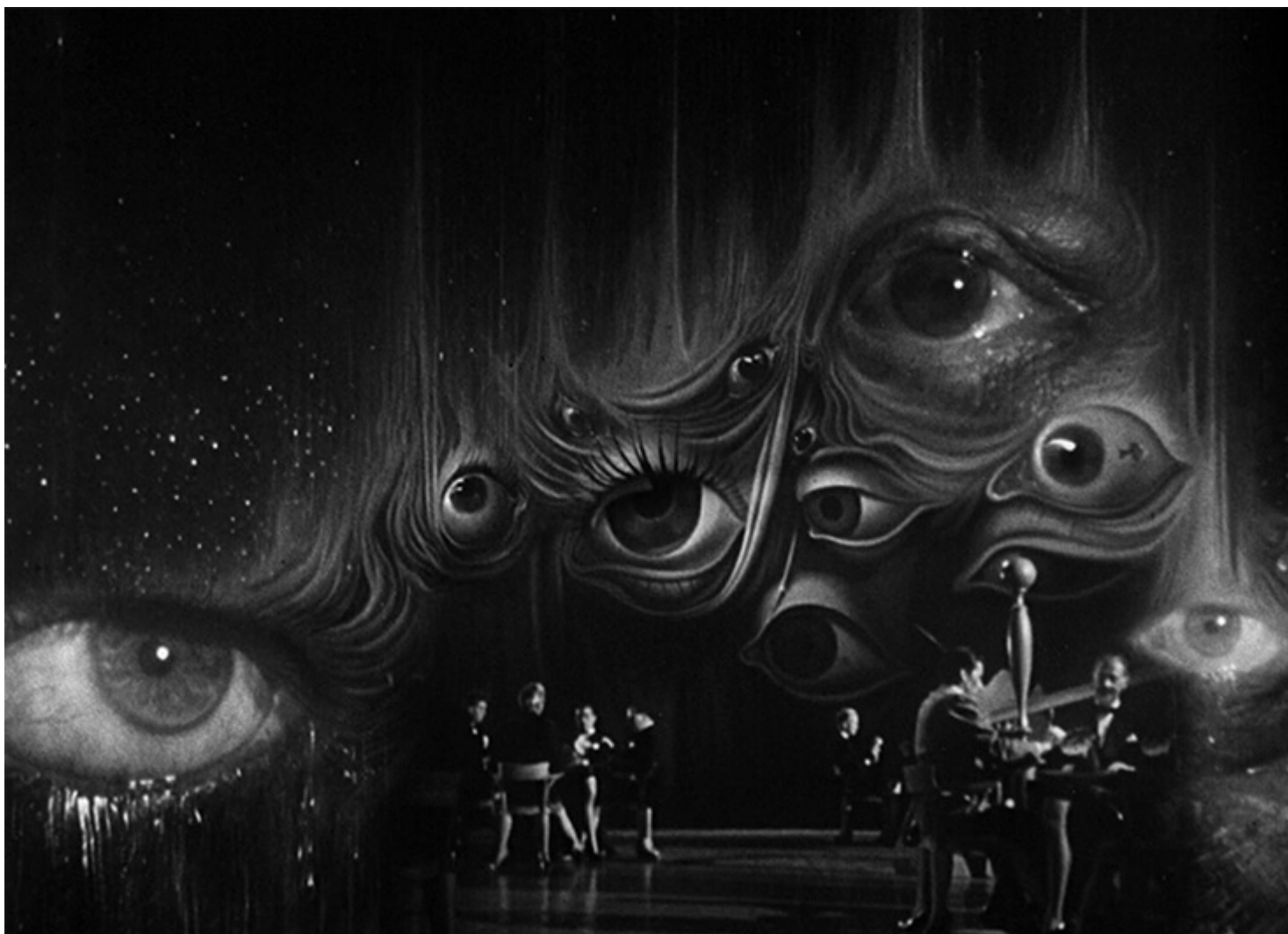
Salvador Dalí's creepy backdrop for Alfred Hitchcock's Spellbound, 1945

Dalí continued his love affair with the ballet for many more years, with projects including the curtain backdrop for a Wagner production of Mad Tristan at the International Theatre of New York in 1941, and set and costume designs for Ana María's Ballet Espanol production of The Three-Cornered Hat in 1949. During this time Dalí also produced a huge cinematic backdrop for Alfred Hitchcock's Spellbound , featuring grossly oversized glassy eyes and other hauntingly surreal objects, proving just how far-ranging the influence of Diaghilev's Ballets Russes had become.