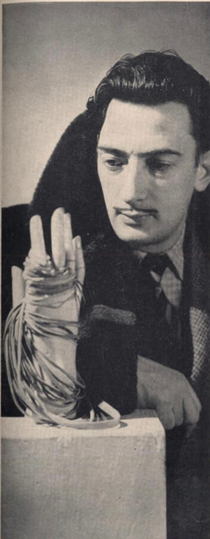
SALVADOR DALI, famous surrealist painter and designer, who created the exciting sets for Wagner-Massine "Bacchanale" two seasons ago, has this year contributed the libretto, sets and costumes for the new ballet "Labyrinth" with choreography by Massine to Schubert's Seventh ("Heavenly Length") Symphony.