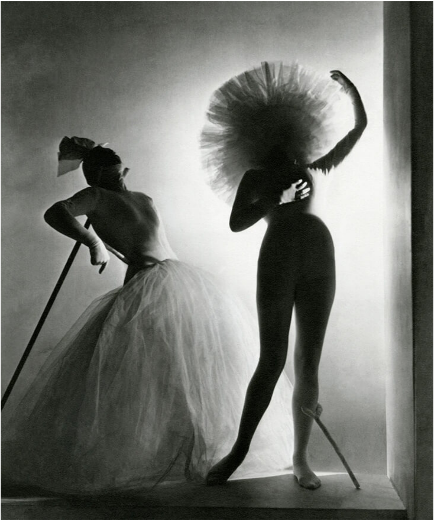
Dancers in costumes designed by Salvador Dalí for the Ballets Russes