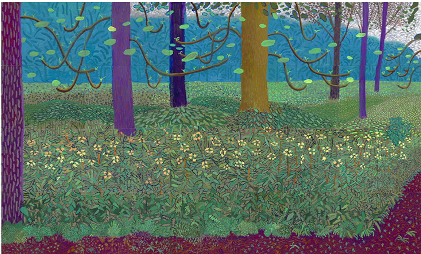
Under the Trees, Bigger / David Hockney / 2010-11

Hockney spent much of the 1990s experimenting with abstract landscapes and broken, faceted spaces. In 1997, he visited an ailing friend in Yorkshire and the experience re-connected him to the landscape of his youth. A series of vast, riotously bright British landscapes followed, culminating in the epically scaled display at London's Royal Academy, A Picture Picture , 2012. Based on iPad drawings made on location, these works have the synthetic brightness of the Californian sun, transforming British countryside into kaleidoscopic patterns of colour and light. Under the Trees, Bigger , 2010 combines a rich blue backdrop with lush, floral undergrowth and vivid, indigo and ochre tree trunks, creating an enveloping feast for the eyes.