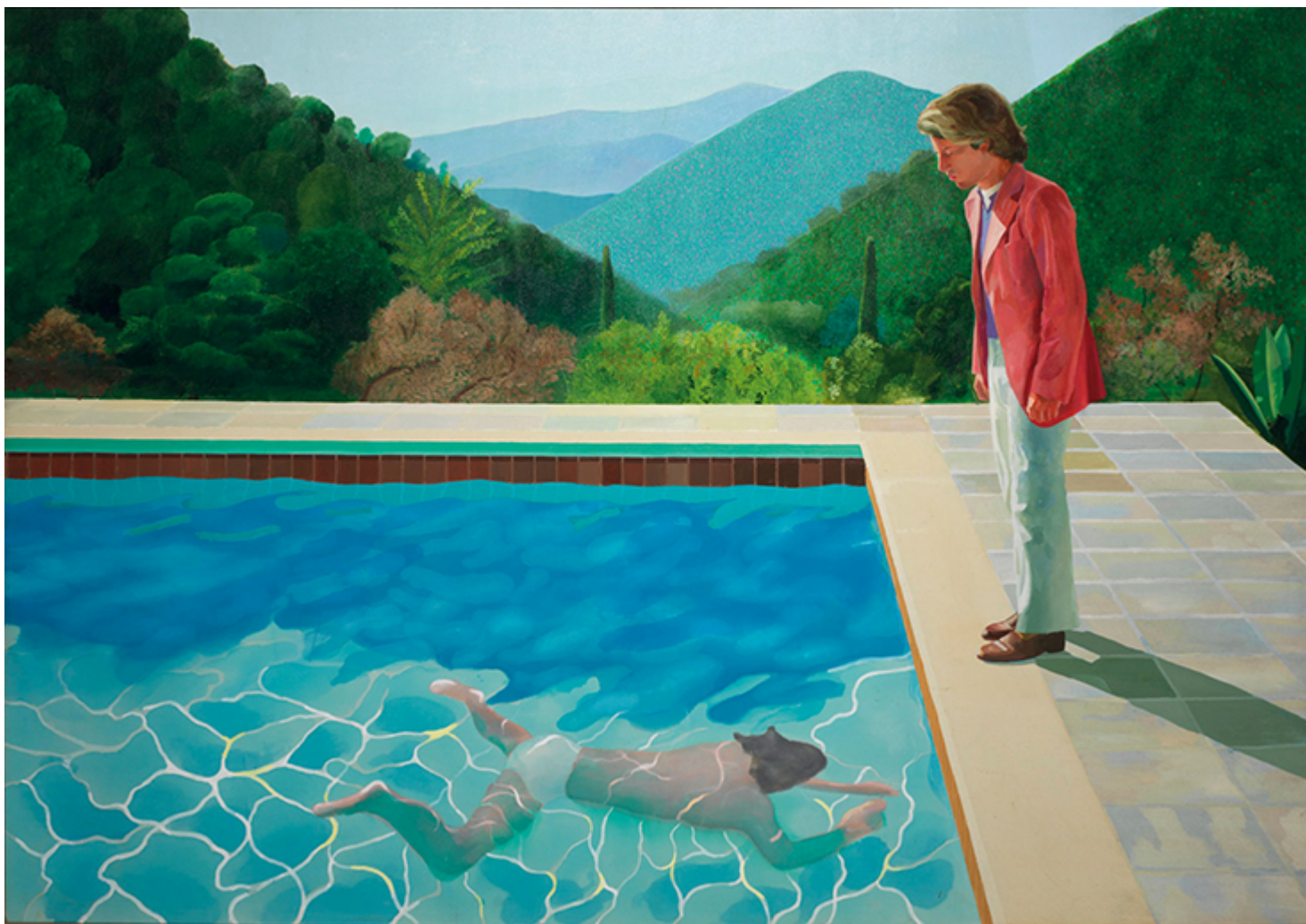
Portrait of an Artist (Pool with Two Figures) / David Hockney / 1972

Throughout the 1960s and 70s Hockney moved between Europe and the US, but Californian homes and swimming pools were a mainstay in his practice, painted with enduring blues that speak of endless summers. Hockney was also drawn to the subject of the double portrait in the 1970s, and made various portraits of his friends, as seen in Portrait of an Artist (Pool with Two Figures) , 1972. Here Hockney paints his former lover, the painter Peter Schlesinger, standing fully clothed, while another, nearly nude male figure delves deep into the rippling blue water as it waves in and out of the sunlight, forming an aqueous patchwork of turquoise and cyan blue.