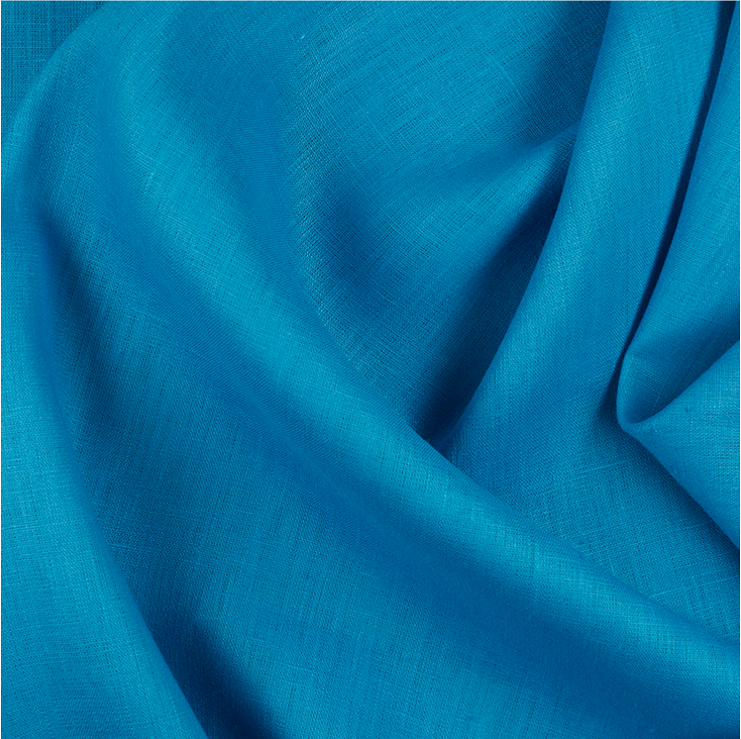
FS PACIFIC BLUE Softened 100% Linen

Early paintings from the 1960s featured literary or autobiographical elements, sometimes loosely referencing his homosexuality. An avid movie goer and an admirer of modernist architecture, Hockney was fascinated by Hollywood, and after completing art school in 1963 he made his first visit to