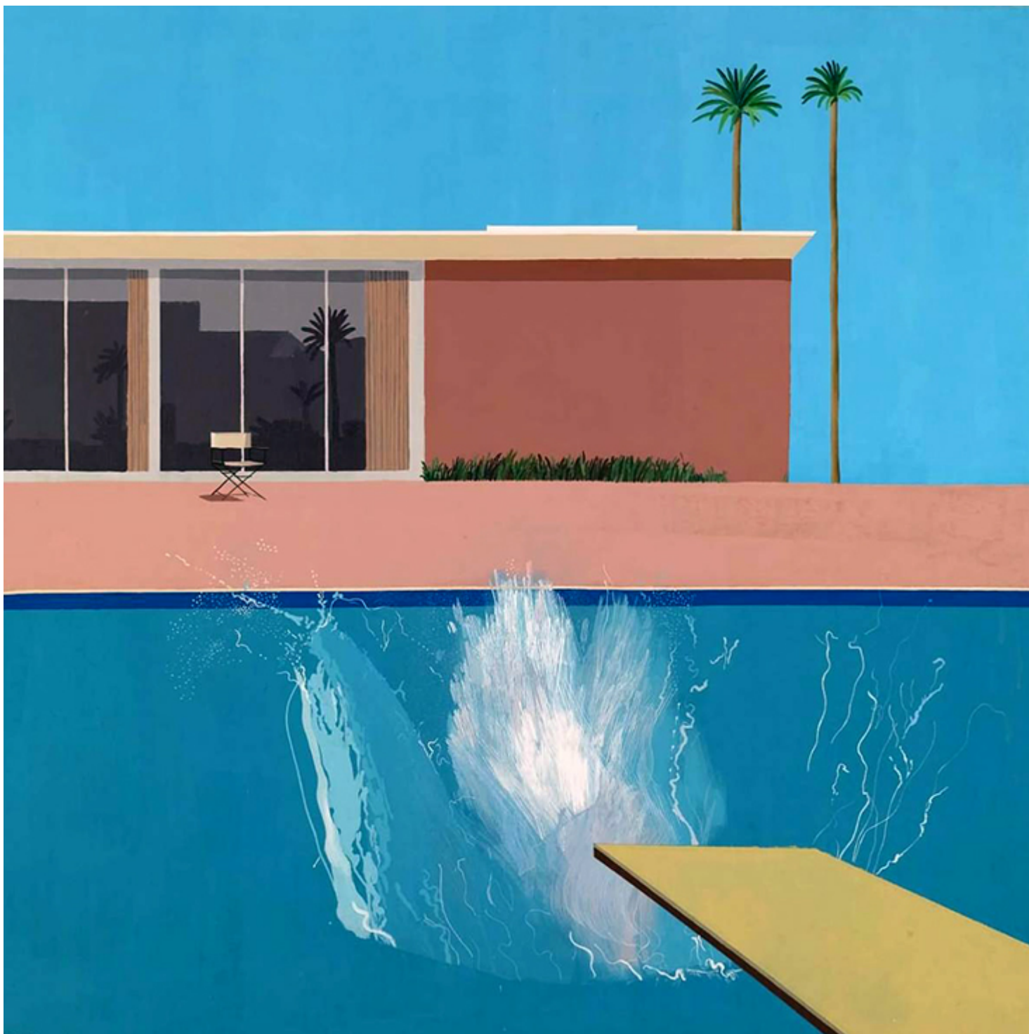
A Bigger Splash / David Hockney / 1967

Bold, vibrant and filled with optimism, PACIFIC BLUE linen mirrors David Hockney's dazzling, eye popping blues. Celebrated for his playful and adventurous colour palette, Hockney spent his early years as an artist living and working in LA. Moving between the UK and US in his later years, the