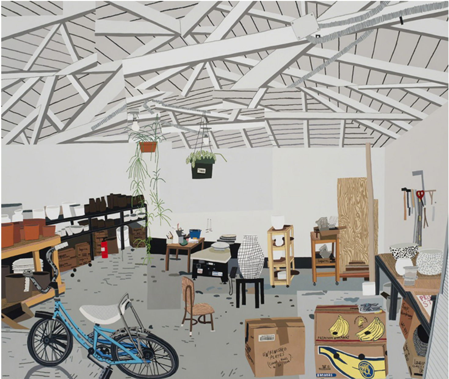
Shioês Studio on Palms / Jonas Wood / 2015