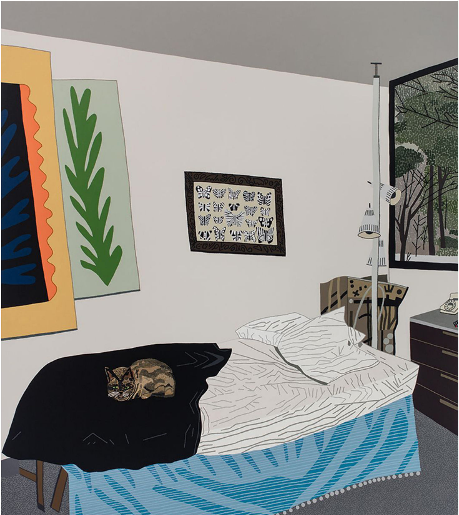
Helen's Room / Jonas Wood / 2017