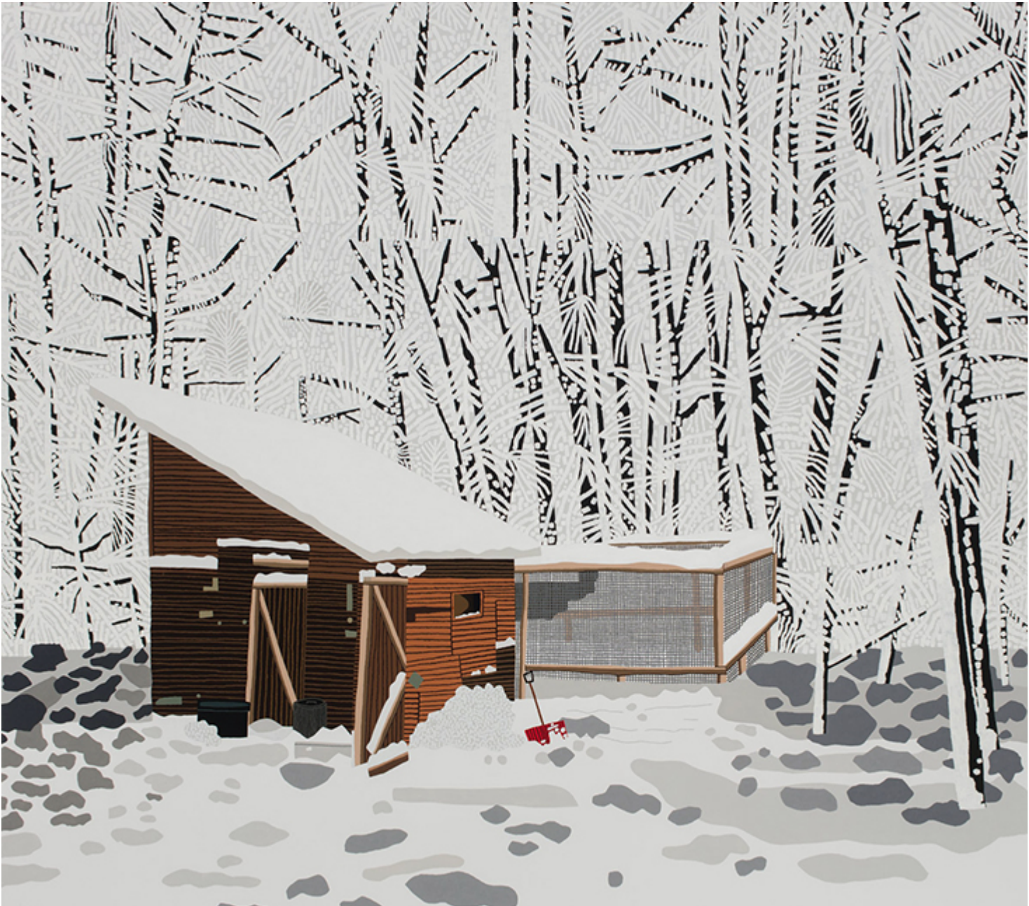
Snowscape with Barn / Jonas Wood / 2017

choice to enter the arts as an adult seem natural. He was particularly influenced by the props his mother made for school plays, remembering, "It was a really big deal in retrospect that I was around sets and plays and props. Because my paintings are like that, in a way. They are not real. They have a theatrical vibe."