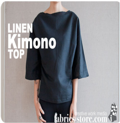
Linen Kimono Top